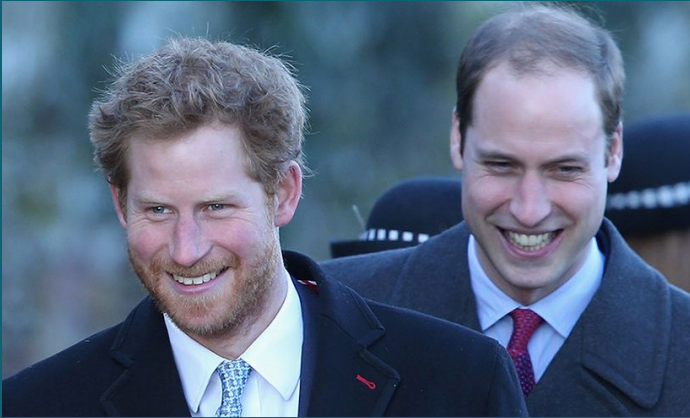
Prince Harry and Prince William