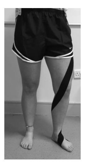
Figure 1. Kinesiology taping application

Before participation within this study each subject completed a health screen questionnaire and informed consent form in order to assess their suitability for the project and gain their approval, gate keeper consent was also enforced. All informed consent forms were stored in a locked filing cabinet. The research proposal for this study was sent and approved by the York College (York, UK) ethics committee. Participants were given the right to withdraw from the project at any time, and all data collection was conducted under the supervision by a qualified physiotherapist.