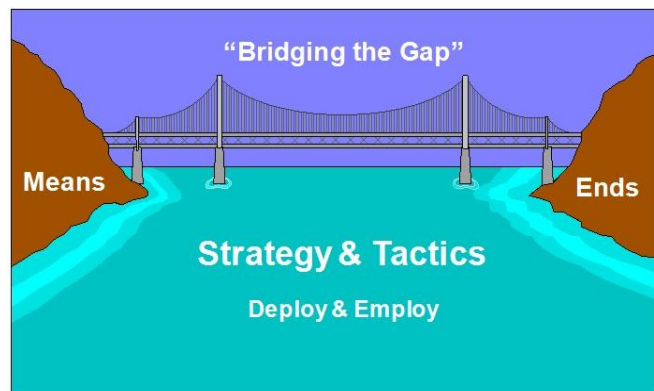
Figure 2 – Strategy & Tactics

Strategy, in general, refers to how a given objective will be achieved. Consequently, strategy in general is concerned with the relationships between ends and means, that is, between the results we seek and the resources at our disposal. Strategy and tactics are both concerned with formulating and then carrying out courses of action intended to attain particular objectives. For the most part, strategy is concerned with deploying the resources at your disposal whereas tactics is concerned with employing them. Together, strategy and tactics bridge the gap between ends and means (see Figure 2).