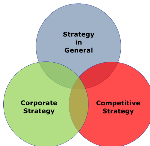
Figure 1 – Three Forms of Strategy

There are at least three basic forms of strategy in the business world and it helps to keep them straight. The objectives of this brief paper are to clarify the general concept of strategy and draw attention to the importance of distinguishing among three forms of strategy: (1) general strategy (or just plain strategy) (2) corporate strategy and (3) competitive strategy (Figure 1).