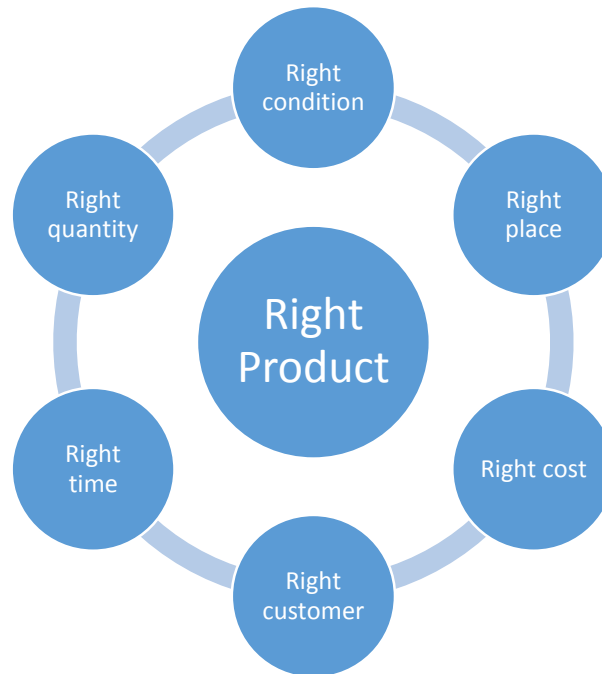
Graph 1. The 7 R's of Logistics

Specified function has the following features. First, they represent a set of interrelated functions for the formation, organization, management and implementation of material flow in the process of commodity circulation. Secondly, the carriers of these features are in one way or another involved in this process: supply, sales, and transport services enterprises, associations, business associations, corporations and inter-regional and regional commercial and trade intermediary organizations and enterprises. In addition, the coordinating role in the organization of goods movement can exercise state structures that control the transport, trade, material and energy resources. Third, the criterion of effective implementation of these functions is the minimum unit total cost of moving goods, since each of the elements of these costs belongs to a significant proportion of their total. (Bazhin, 2003)