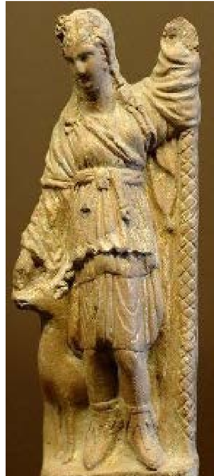
Fig. II.8: Greek Artemis.

Admittedly, Greek culture had an enormous impact upon the Ancient Mediterranean world. While we must include all the mythological data from Rome's contributing cultures, we should also give proper weight to Greek ideas. Ample evidence remains of its impact upon Italian myth in Etruria and Latium, dating from the fifth century B.C.E. and even earlier. One needs look only to the importation of the Greek alphabet around the seventh century to appreciate the Hellenic influence in early Italy. Mythographers, however, cannot easily measure the footprint left upon the inheritors of Greek culture due to the absence of extensive literary remains in Italy; nonetheless, those sources that do remain to us point to a strong Hellenic tradition in Latin literature. From Plautus' plays incorporating Greek plots, dramatic concepts, and even locations and characters, to the fragments of Ennius making mention of well-established Greek myths, the Hellenic presence in Roman myth seems irrefutable. 11 Taking these facts, along with the weight of so much scholarly momentum, one understands the temptation in conceding that Roman myth is little more than