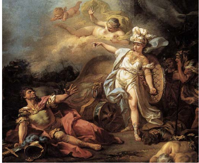
Fig. VI.1: Minerva victorious.

humanity (Virgil, Georgics 5.60). 36 When the Gauls threatened Rome, Juno's sacred geese alerted the city's defenders to an incoming raid (Livy 5.46). Whether as a Celestial or Chthonic goddess, Juno looks down upon the Roman people, guiding and protecting them so long as they remain faithful to her. In both cases, she sees to