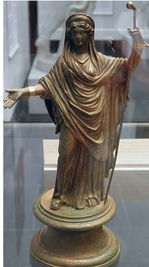
Fig. I.2: Juno Regina , bronze statuette from 1 st century.

Roman myth offers many examples of goddesses, each with potentially dozens of cognomina . Virgil, Ovid, and other Latin writers all have strong representations of the divine feminine within their bodies of works. In his Aeneid , Virgil presents Juno as the all-powerful queen of Heaven (1.12-6 and 4.124-46), and contemporary artistic representation supported his depiction of the mighty Juno Regina (cf. Fig. I.2). Despite this synchronicity, the writer offers contrasting views of Venus, evoking the adulterous patroness of Paris in his Eclogues (2.60) and yet presenting a dedicated mother and protector in his Aeneid (1.269-303). 2 This seeming inconsistency of divine presentation is commonplace in Roman myth. While Ovid seemingly presents Juno only as the jealous wife of Jupiter in his Metamorphoses (1.589-779 and 2.836-75), 3 in his Fasti , the queen of the gods receives his reverential respect (6.17-63). These mythological manifestations of Roman goddesses can vary in their apparent representation or purpose not only from one author to another, but also from one appearance to another within multiple works by the same writer.