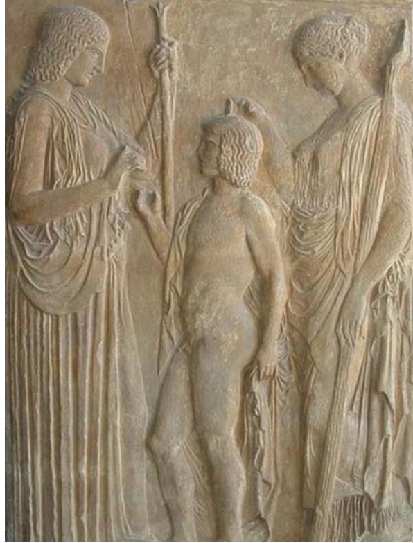
VII.3: Ceres and Proserpina, at opposite points in life.

ruler, Dis. Even swift Mercury, who carries souls into the afterlife, has some influence in the Underworld. Untamed Proserpina, however, along with her mother, Ceres, holds the key to immortality and potential reincarnation (Servius 4.609 and cf. fig. VII.3). A man may bow to whichever patron god he chooses, but if he wishes peace in the Elysian Fields, then two goddesses truly hold his final destiny. These two goddesses, mother and daughter, control the secrets to life and death in Roman myth, with special festivals dedicated to one or both of the