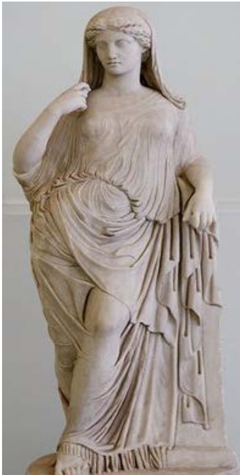
VI.2: Venus as a bride.

at war and their goddess is no different. Urban Minerva receives the spoils of defeated enemies from victorious commanders and thrills to gladiatorial combat during her festivals (Livy 45.33 and Ovid, Fasti 6.205). She is patron to both the skillful crafts and the liberal arts of Rome, to leadership, and to people of intellect (3.4-10 and 3.815-21). Slaves trained in her arts hold the highest value, and Romans of skill give thanks to this Urban goddess (Virgil, Aeneid 4.284 and Varro 7.28). Minerva even receives credit for having invented mathematics (Livy 7.3 and Ovid, Fasti 3.815-34). Anything overt that a visitor may observe about Rome upon viewing the people going about their lives owes to the influence of Minerva. As an Urban goddess, she embodies all the ideas, the values, the very identity of Rome; everything that separated them as a culture from the outside world is attributable to the Urban goddess.