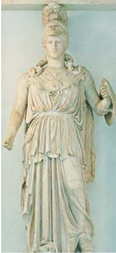
Fig. 1.1: Marble statue of Minerva from the 2 nd century B.C.E., displaying both Greek and Roman themes.

an agrarian society, with a strongly animistic mythology. The gods of this ancient culture were not specific deities, but rather spirits that possessed the world around them, living in the hills, rivers, sea, and open sky (Michels, 25-7). In the Aeneid , Virgil refers to this tradition when Aeneas reaches Italy. In thanksgiving for the apparent end of their journey, the hero has his people pay homage first to the indwelling spirit of the land and to the Earth herself (7.159-65). As the Romans absorbed the myths of their surrounding cultures, their understanding of the gods adapted. Anthropomorphized representations of the sky and the fertile earth found their way into the Roman world. This blending of cultures did not result in the end of animism,