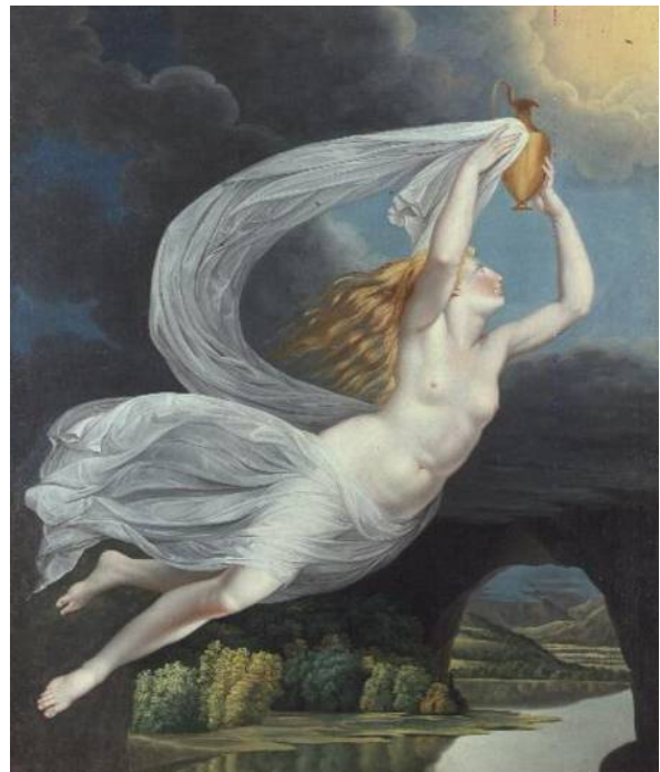
Fig. IV.1: Iris, messenger of Juno.

Arguably, the myths in which the Celestial goddess' presence is most obvious are those in which she manifests most literally. When, in describing the myth of Jupiter's great flooding of the world, Ovid describes how Iris, an agent of Juno, drew water and nourishment for the clouds, he connects both goddesses directly to imagery of the sky ( Metamorphoses 1.270-1,