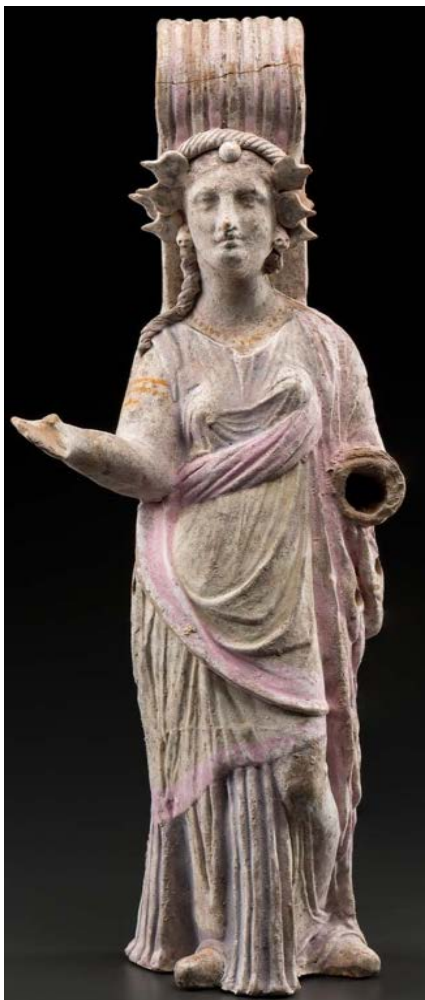
Fig. I.3: Venus/Aphrodite from Southern Italy, 3 rd century B.C.E.

An additional difficulty obstructs the categorization of Rome's goddesses: that scholarship tends to identify Roman mythology as little more than a development of Greek myth. Any investigation into the culturally distinctive identity of a Roman goddess must first reconcile its multiple cultural influences. While the hybridized myths of Rome certainly reflect their Greek contributions, in order to understand the Latin goddesses as having an independent mythology, we need to factor in the mythographic contributions of Rome's other predecessors, from the Etruscans to the Oscans and other distinct native cultures. Rather than trying to ignore these