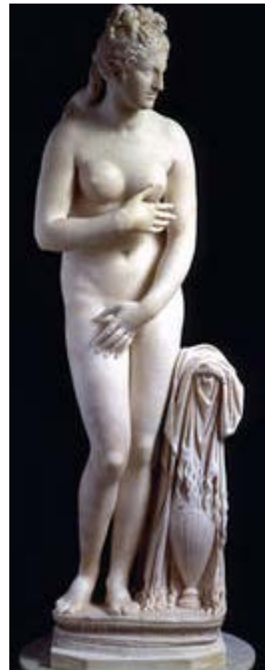
Fig. I.4: Capitoline Venus, 4 th century Rome.

Through our analysis, mythoi emerge that unify the divine feminine within Roman mythology. We can identify four universal themes, original to this analysis and independent of a goddess' specific identity, that represent a primal ordering of the Roman universe. These basic categories: Celestial, Chthonic, Urban, and Feral, contain within them not just a superficial, mythological