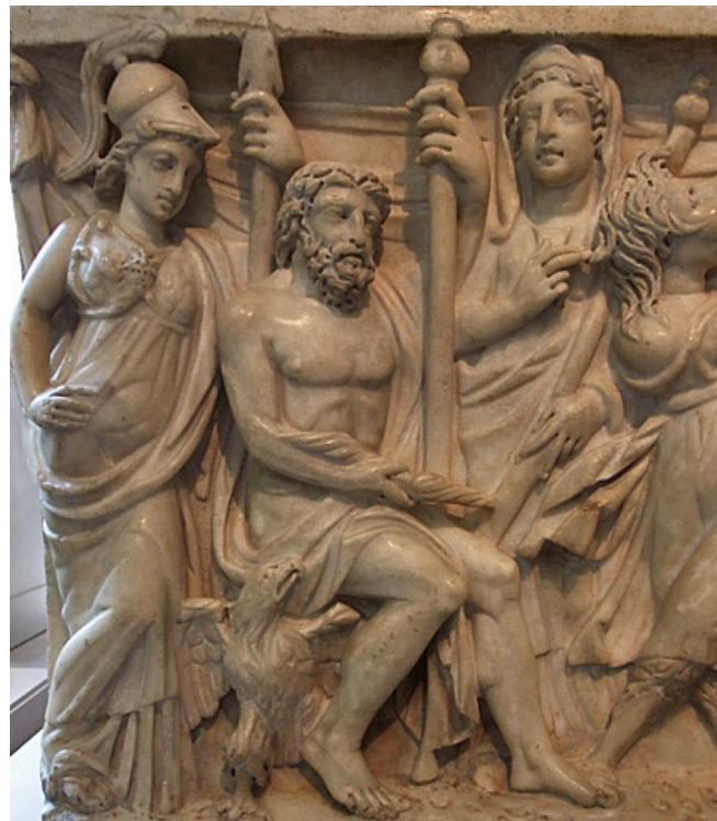
Fig. IV.3: The Capitoline Triumvirate, Juno standing at Jupiter's side.

Arguably, the best, most renowned examples of the Celestial goddess occurs in Virgil's Aeneid . Within the great Roman epic, both Juno and Venus shed the roles of their Hellenic predecessors in favor of the awesome visage of the Celestial goddess. As