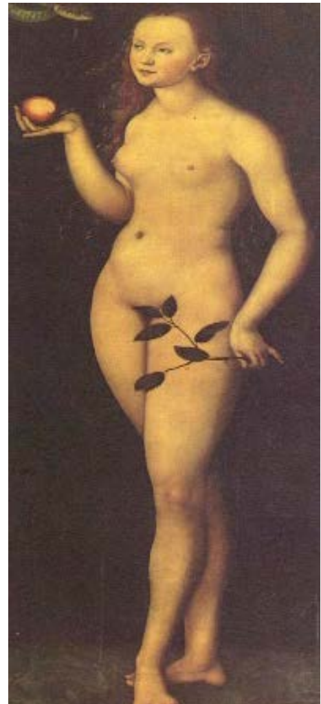
Fig. II.4: Eve with the forbidden fruit.

mythologists of the twentieth and nineteenth centuries respectively, strongly advocated a structuralist approach to mythography (Campbell, Occidental Mythology , 6-8, 292-3; and Müller 23-37, 209-11, 213-7, 224-8). For example, Joseph Campbell closely associates the myths of Persephone with those of Eve because both have imagery of maidens, fruit, and serpents (9-10, 14-5; cf. Fig.II.3-4). Doing so, however, disregards the social significance of the Expulsion myth within Judeo-Christian cultures, and the