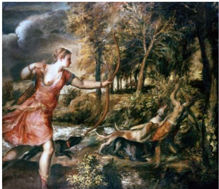
Fig. VII.1: The Death of Actaeon.

The most easily recognizable Untamed goddess is Diana. She surrounds herself with the spirits of nature in scenes of the unexplored Wilderness, as Actaeon discovers to his dismay (Ovid, Metamorphoses 3.138). Untamed Diana embodies the mystery of divine nature, a power forbidden to man (cf. fig. VII.1). As the mistress of nymphs, surrounded by springtime imagery, Diana blends metaphors of