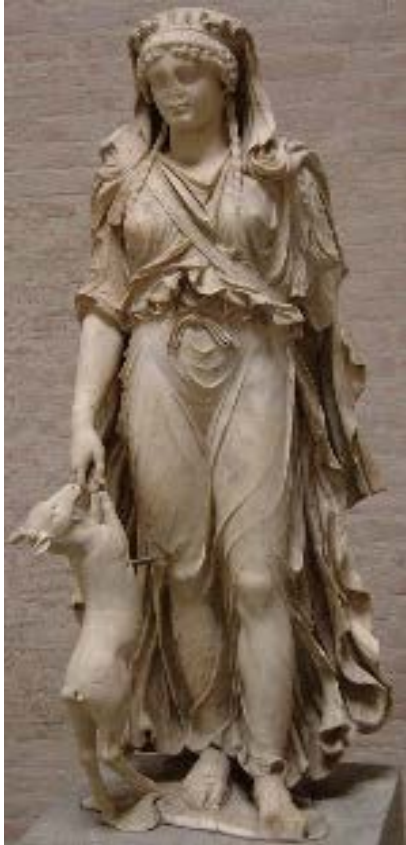
Fig. II.7: Roman Diana.

generally misleading. Worse, in purely academic works the preconception also exists that native Italian myths were abandoned in favor of Greek (Bremmer and Horsfall 120). 8 All too often, mythographers misidentify Roman myth as a subset of Hellenic. As a default, scholars habitually assign the gods of Rome epithets such as “the Roman equivalent of the Greek...” 9 These descriptions often correspond to Hellenic divinities of only approximate attributes in a specific period of Hellenic culture. For example, Tripp identifies Diana, with the Greek Artemis, a virgin goddess. Given the similar iconography of these two goddesses, this association would seem reasonable (cf. Fig. II.7-8). Tripp goes on, however, to point out, without explanation, that some Roman myths name Diana the consort to the god Virbius (200). 10 By presenting contradictory material with little or no context, these sources can do more harm to mythography than good. In an analysis of any particular goddess, a mythographer can reach false conclusions because of a faulty premise, that is, the association of disparate or only loosely connected myths.