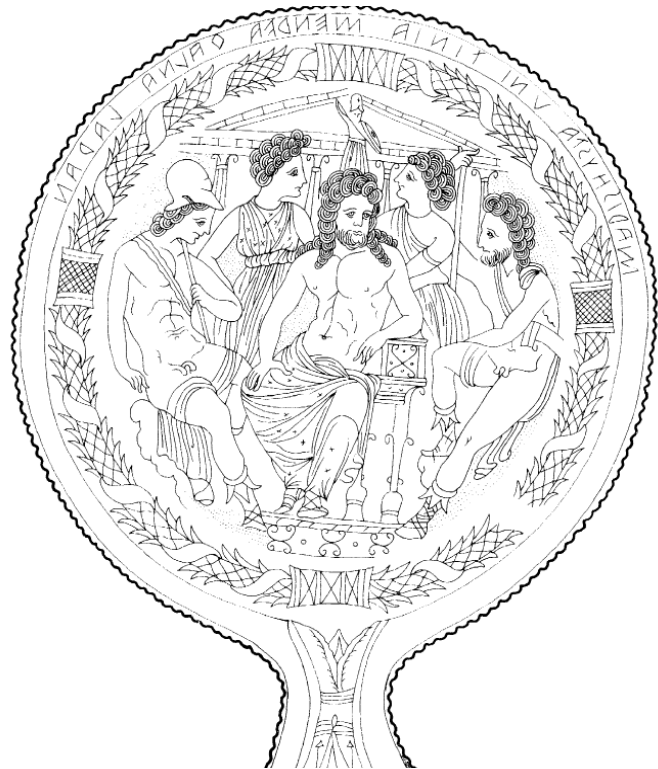
Fig. IV.2: Uni at the side of Tinia, king of the gods.

Juno is, in fact, the most obvious example of the Celestial goddess. She holds the highest station as princeps among goddesses. As Juno Lucina , she is the light-bringer, matriarch of the Roman pantheon, holding the highest status among spirits and divinities (Ovid, Fasti 6.49-59). A shining goddess, equated to the moon, Celestial Juno is a timekeeper that marks out the natural advancement of the world while watching over it (Varro 5.18, 5.49, and