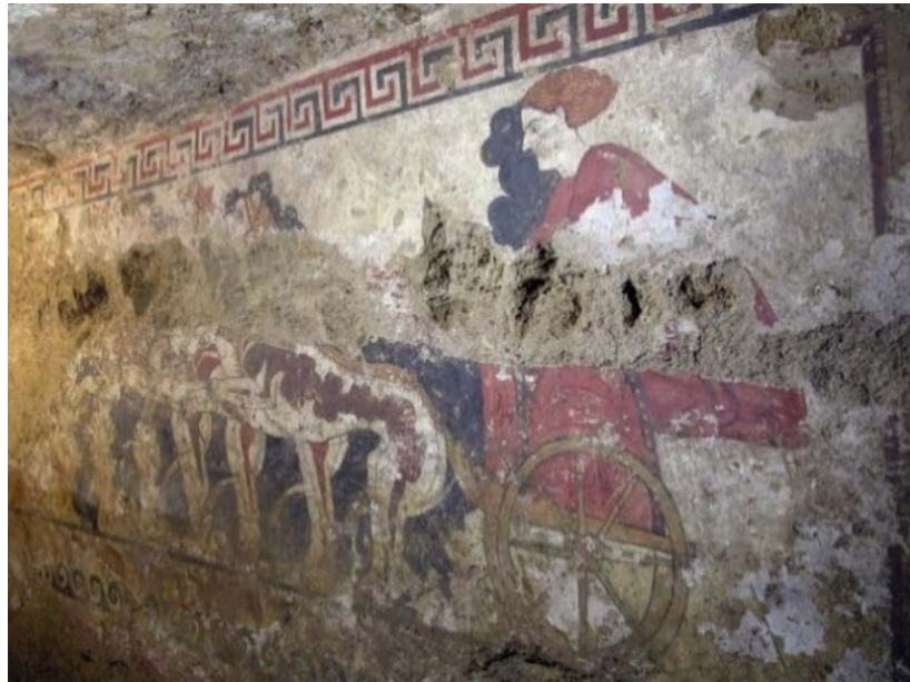
Fig. III.2: Etruscan tomb painting of a spirit guiding a hero to the afterlife.

Roman myth shares with other cultures in a similar separation of the divine realm, the mundane, and the realm of the dead. Latin literature, for example, often explores the concept of the soul and afterlife in detail. 17 The people of Italy, perhaps even more so than