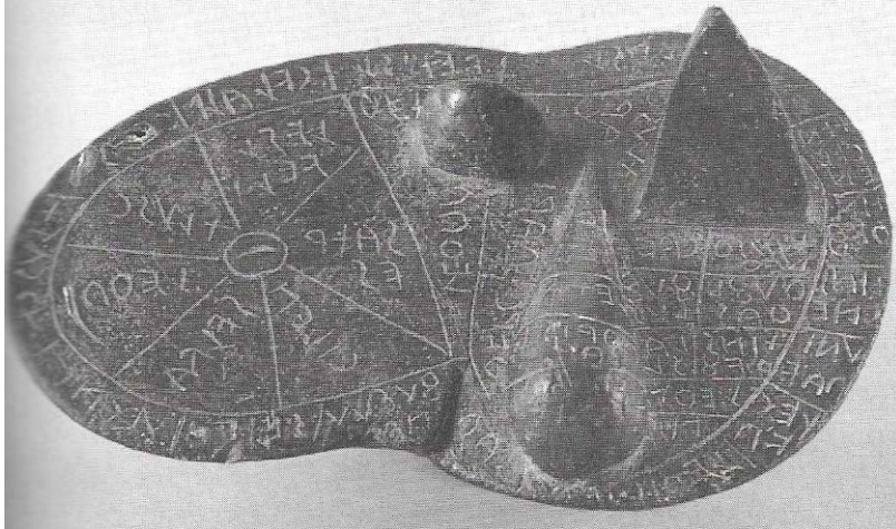
Fig. III.1: The Piacenza Liver

between the higher realm of the gods, the natural, living world, and the realm beyond death. 14