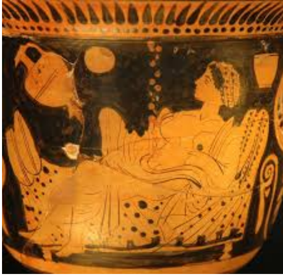
Fig. II.1: Zeus visits a reclining Danae.