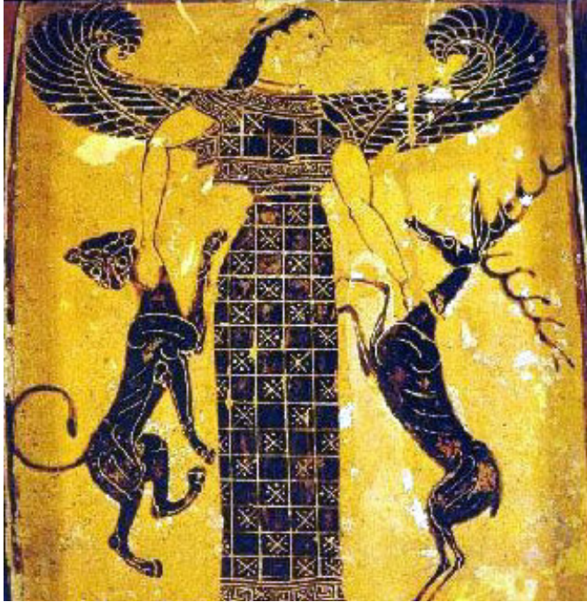
Fig. VII.2: The Mistress of Animals

untapped fertility and unapproachable maidenhood. Her celebrations in southern Italy and Sicily, forbidden to men, included wild dancing, singing, and other orgiastic rites. 42 She is the final descendant of the pre-Hellenic Mistress of Animals (cf. fig. VII.2), in command of the fertility of nature and celebrated by orgiastic rites (Nilsson 503-40). Diana's myths seem to revolve themselves invariably around her status of