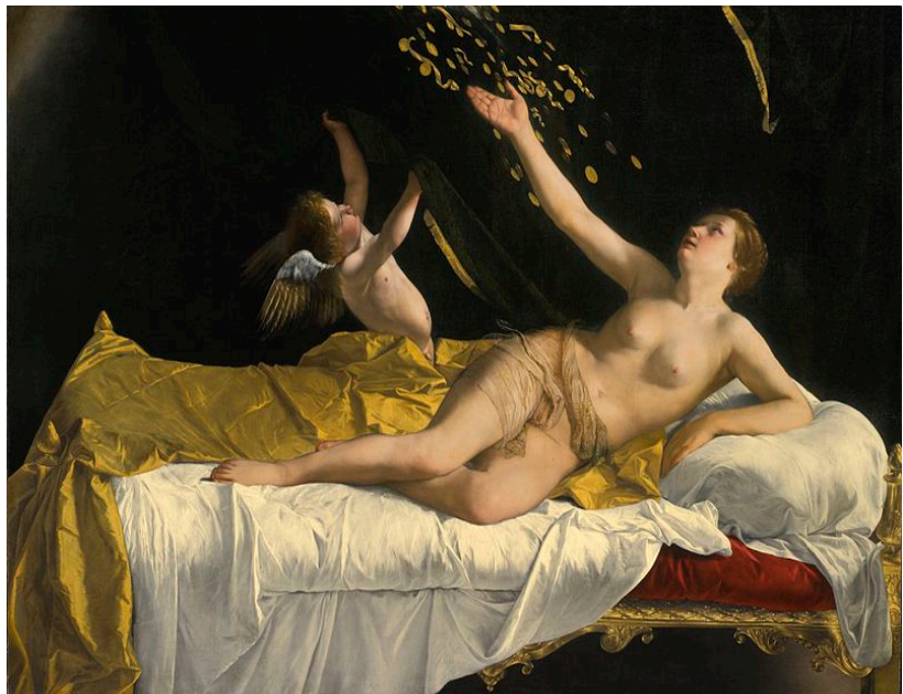
Fig. II.2: Danae, reclining, receives the shower of gold.

seems inextricably linked to a divine visitation (cf. Fig. II.1-2). Hellenic storytelling, in its various forms, is so foundational to the Western world that even thousands of years later we do not deviate from their patterns. Such a strong emphasis in the literary