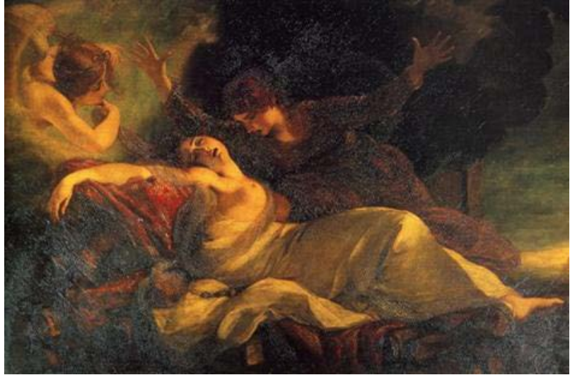
Fig V.1: The Death of Dido.

are the pomegranate, the serpent, and the golden branch. The fruit represents fertility and life, the snake since ancient times has association with health and rebirth, and the golden branch is synonymous with the changing of seasons, both spring and