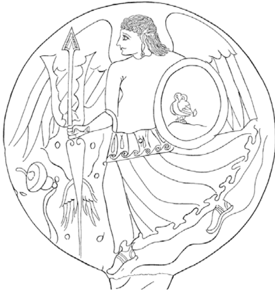
Fig. II.5: A pre-Hellenic Minerva, winged, lacking armor, and wearing feminine garb, but with Athena's owl.

to say nothing of any other contributing myths.