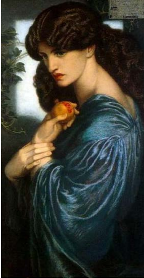
Fig. II.3: Proserpine. with the forbidden fruit.

community towards connecting Greek and Roman ideas would surely impact the analysis of their myths. Any scholars that are a part of these societies so dependent upon Greek ideas would be as naturally inclined towards them as would any storyteller.