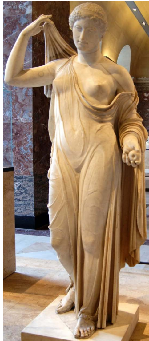
Fig. V.2: Venus Genetrix.

Everything relating to the mundane world and mortal life revolves around the Chthonic goddess, from the literal in fertility and reproduction to the more esoteric seasons. Venus, in her full expression of womanhood, illustrates this versatility. She originated as an agrarian fertility goddess, responsible for the blooming of spring and the beginning of new life in all its forms (Macrobius 1.12). Association with the Hellenic Aphrodite influenced the Roman understanding of Chthonic Venus as a sexual goddess, governing the act of lovemaking (Apuleius 2.8