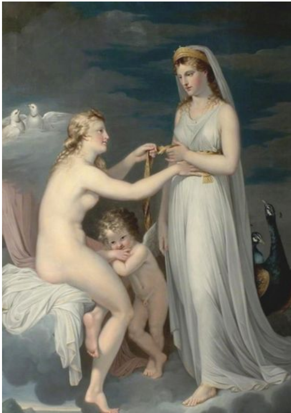
Fig. IV.4: Hera borrows Aphrodite's magic girdle in order to seduce Zeus.

Aeneas' nemesis, Juno curses the Trojans for not only the dishonor inflicted upon her in the past, but also for the slights their descendants shall commit in the future. 27 Juno renounces fate, manipulates the weather, employs lesser gods and goddesses, and even defies her husband, all to extend the suffering of the Trojans (1.12-43, 2.718-21, 4.108-20, 4.133-46, 5.673-722, 7.347-416, 9.1-14, and 10.73-117). In some ways, Venus works just as hard to protect her son, Aeneas, and ensure his destiny in Italy. She manipulates Dido into love, pleads with Jupiter for the protection of the Trojans, and seeks the help of Neptune and Vulcan for her son in his times of