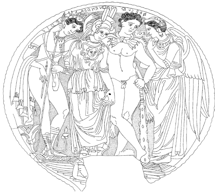
Fig. II.6: Menra in a romantic embrace with Hercle (center).