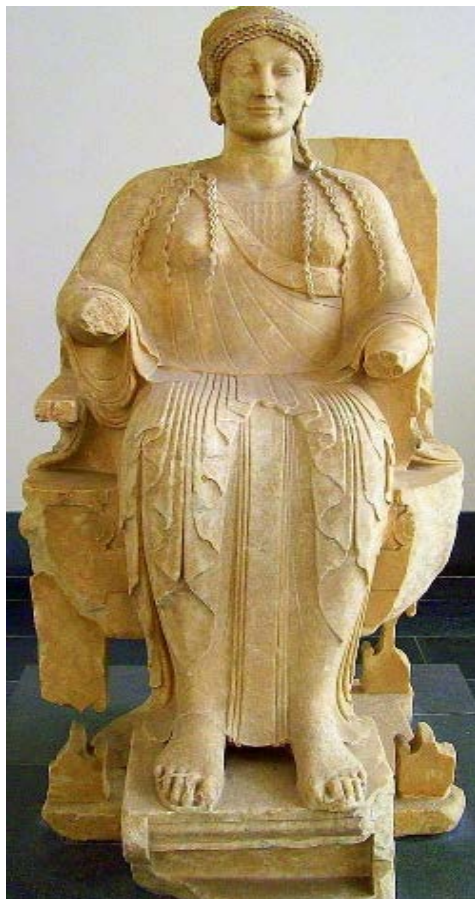
Fig. IV.5: Proserpina enthroned.

Celestial goddesses are active, undeniable contributors to the narrative. Whereas Grecian Hera uses deceit to try to thwart her husband’s command, Roman Juno openly defies a similar edict ( Iliad 14.153-353 and Aeneid 4.129-34). Whereas Grecian Aphrodite gives aid to Aeneas but retreats from the battlefield the instant she faces injury, Roman Venus stands before the wrath of both Jupiter and Juno in defense of her son ( Iliad 5.297-430 and Aeneid 4.124-311 and 10.16-7). In the Aeneid , lesser gods submit to Juno’s vengeful plans in reverence of her sovereignty (1.93-8 and 7.405-28). Venus gives aid to her mortal son, from shielding his approach to Carthage to weaponry for his battle against the Latins (1.508-10 and 8.694-7). Both of these goddesses use their influence over mortals, other divinities, the elements, and themselves, manipulating events