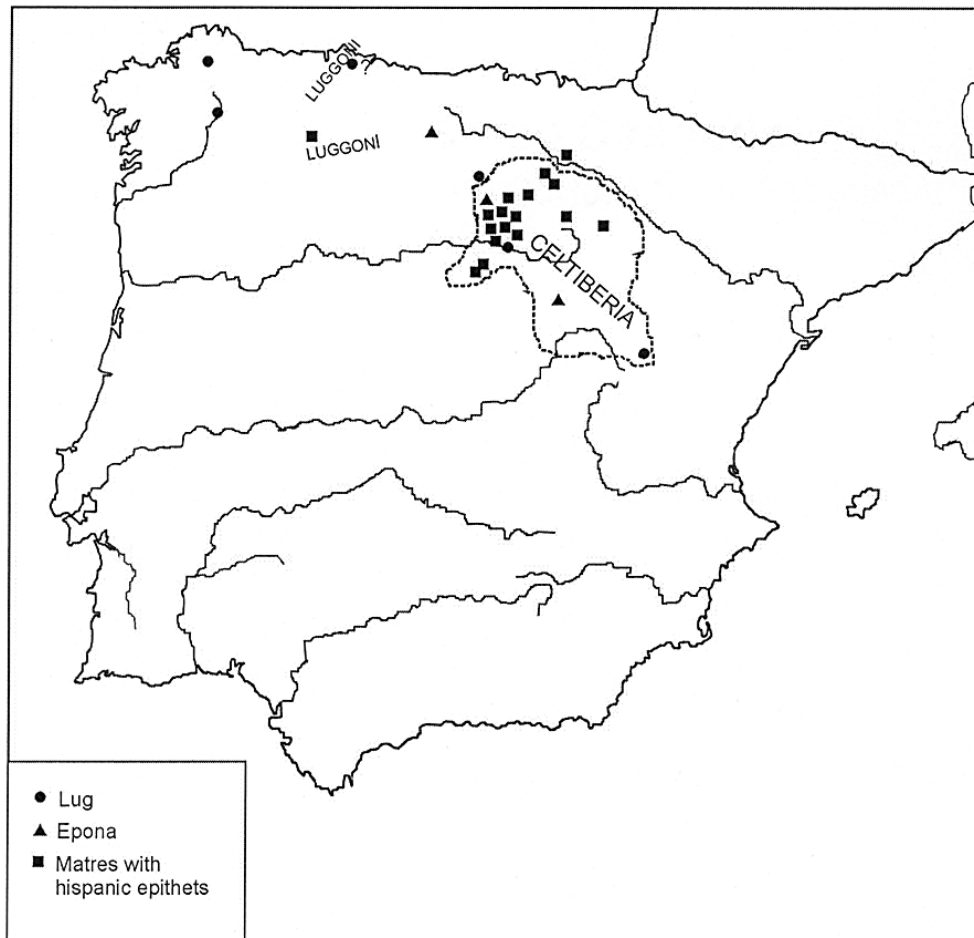
Figure 4. Epigraphic evidence for Lug , the Matres , Epona and the boundaries of Celtiberian territory.

The last region in which a concentration of a group of theonyms can be identified is the eastern region of the Spanish northern Meseta (Figure 4). The regional deities found here are, as we have seen, Lugus , Aeius , the Matres and Epona . The evidence for these is concentrated in the