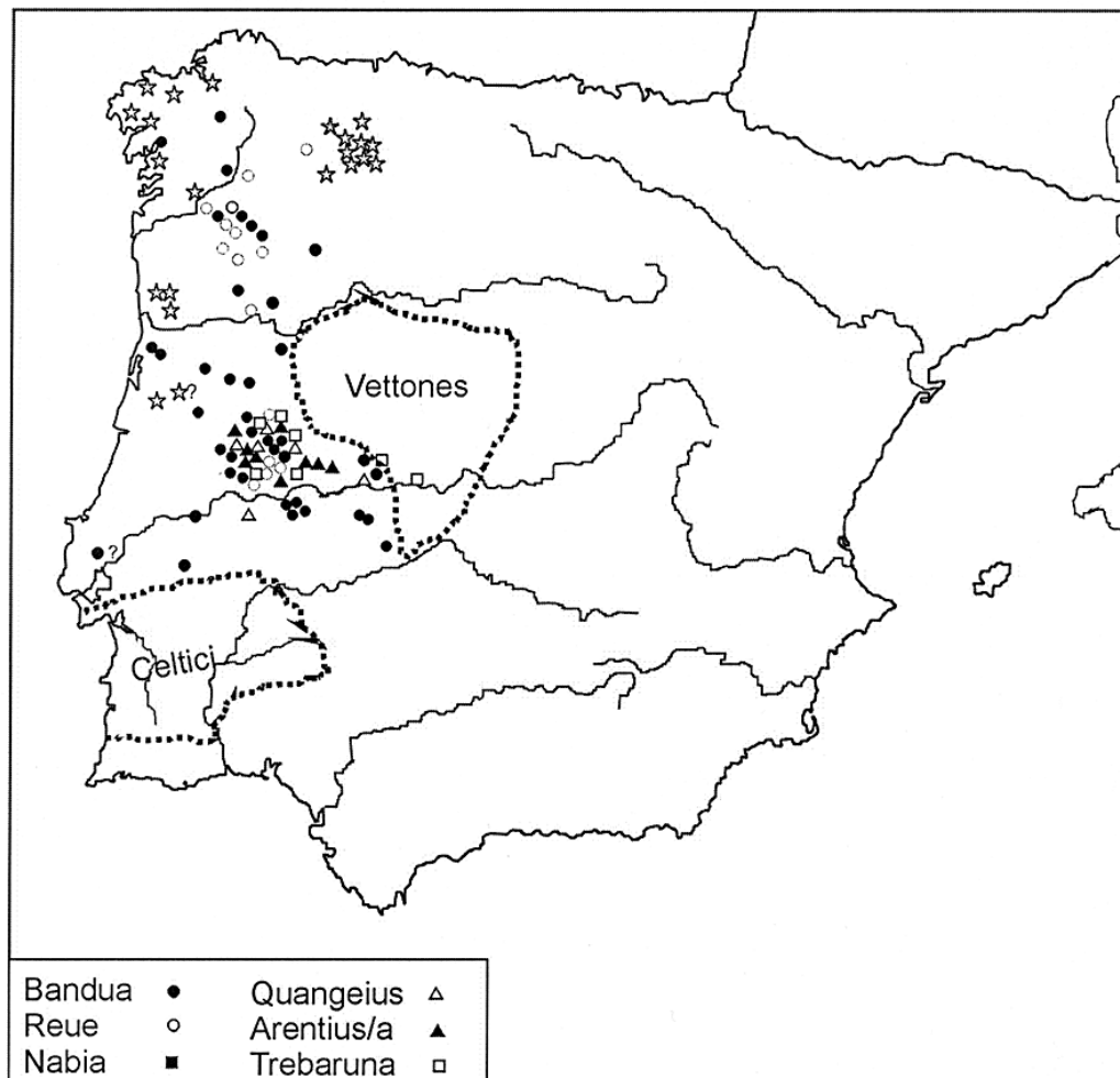
Figure 3. Lusitanian deities and the territories of the Vettones and southwestern Celtici .

The territory that was without doubt inhabited by the Lusitani corresponds approximately with the area where various inscriptions in the Lusitanian language have been found (Figure 3): in Lamas de Moledo, located in Castro Daire, Viseu (Untermann 1997: 750-754), Cabeço das Fraguas, located in an elevated area in the district of Pousafoles, Sabugal, Guarda, and in Arroyo