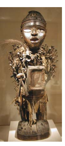
Kongo power figure, Art

person, covering a basket containing the relics. Very abstract and severely geometric. Picasso owned one of these, and the influence can be seen in the image at left and in paintings such as his famous Les Demoiselles d'Avignon. At left is a Kota reliquary figure from Gabon, carved from wood then covered with brass, copper, and iron. Convex faces represent females, while concave ones represent males.