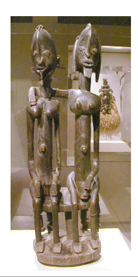
Dogon Primordial Couple, Metropolitan Museum, NY

IV: Four Kinds of Sculptures (created from clay, metals, and wood):