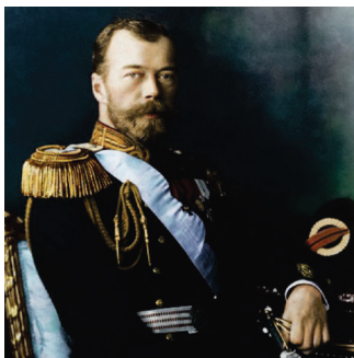
Unrest in Russia, 1905 and 1917