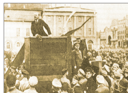
Lenin and the Bolsheviks

World War I had destroyed the Russian economy. Vladimir Lenin, a Russian revolutionary who had fled Russia, returned in 1917 and organized factory workers to seize the government. These workers were part of the Bolsheviks (which means “majority” in Russian), and their actions were called the Bolshevik Revolution. For the next three years (1918-1920), 14 million Russians died in a civil war and the following economic crisis. Among those killed were Tsar Nicholas and his family. Lenin and the Bolsheviks defeated their rivals and formed the world’s first government based on communism . Communism was an idea proposed by German philosopher Karl Marx who believed a class-less and equal society would exist after workers and peasants seized power. Lenin ordered that all farmland be distributed among the peasants and gave control of factories to committees set up by the workers. Lenin’s efforts to repair the Russian economy were called the New Economic Policy (NEP). Under the NEP, peasants were able to sell their crops, but the government kept control of major industries such as banks and communications. Lenin organized the country into 15 republics (what we might call states) that were controlled by a central government. The name of the country was changed from Russia to the Union of Soviet Socialist Republics (U.S.S.R.), sometimes shortened to the Soviet Union.