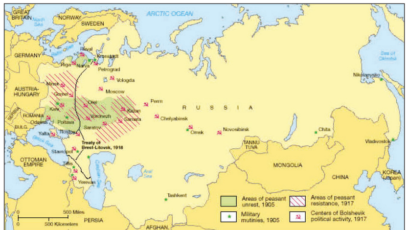
Unrest in Russia, 1905 and 1917

The war effort took 15 million men from the farms and factories creating a worker shortage. There were food shortages and food prices rose, all of which created anger and unrest in Petrograd. The food shortages got worse due to the bad winter of 1916-1917, and soon there was famine in the cities. Russia was not prepared economically or militarily to fight the war. Unlike its German counterparts, the Russian army was badly led and poorly equipped. Repeated defeats in WW I caused the Russian government to lose the support of the Russian military. In sum, Russian deaths reached 1,700,000 with another 4,900,000 wounded during WW I.