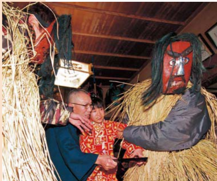
As the namahage chase away laziness from the kids, family members play at protecting their kids from the namahage .

The whole point for the people where this custom is observed, however, is that the namahage are actually good spirits come to warn children and adults alike against laziness, and to offer blessings for good health, bring good harvests from the fields and food from the sea and hills, and grant good luck and happiness for the new year. Homes receiving visits from namahage are ready to welcome them cordially with food and saké made from recipes passed down from one generation to the next.