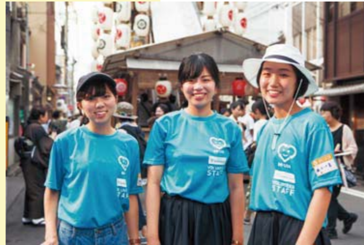
Matching T-shirts for the approximately 2,200 volunteers, many of them university students.

The Gion Festival in Kyoto goes back 1,100 years. Fantastic floats take to the streets, and around 600,000 people from all over Japan are there to see them. But the event generates almost 50 tons of garbage, some of which gets left on the streets.