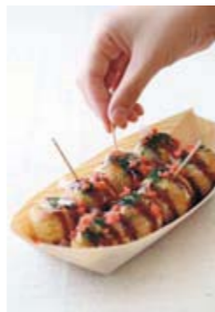
Sold in boat-shaped containers at street stalls at festivals.

Pour wheat batter into hot semi-spherical molds, add diced octopus, flip the mixture about to cook into small round dumplings, and you have tako-yaki . Browned to a diameter of about 3 or 4 cm (perfect for popping in the mouth), they are sized for eating on the move, ideal for festival time.