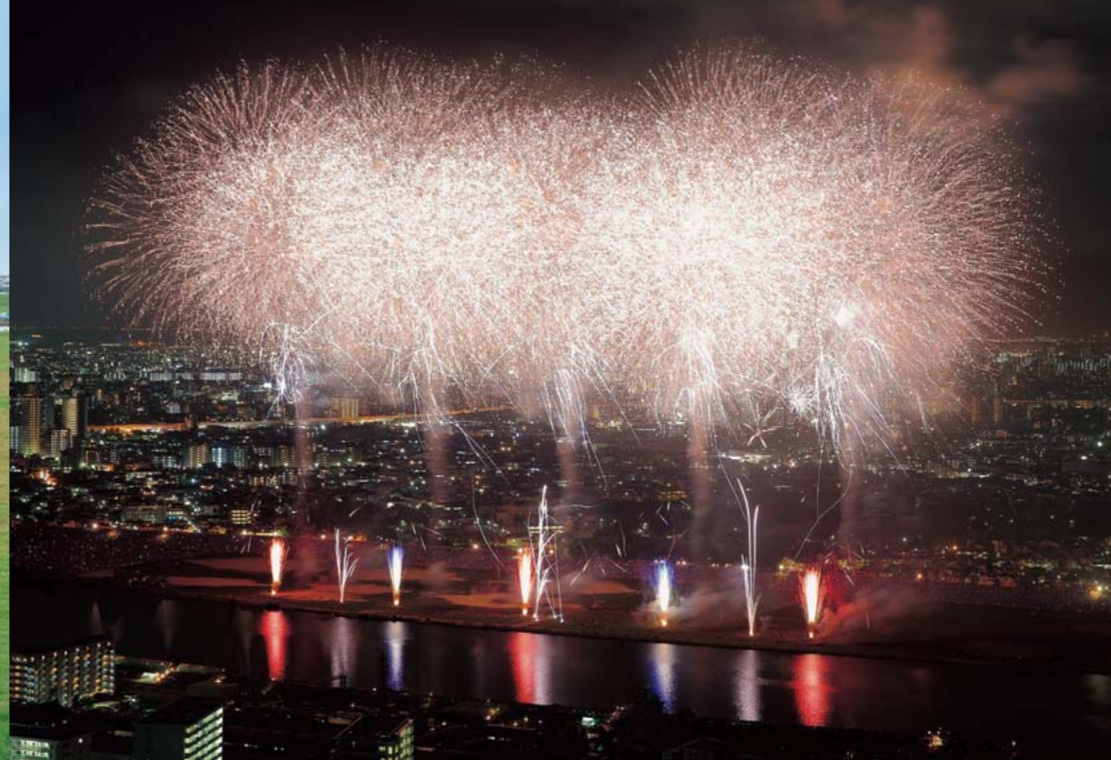
Scene from a display organized by Kagiya for the Edogawa Fireworks Festival in Tokyo.