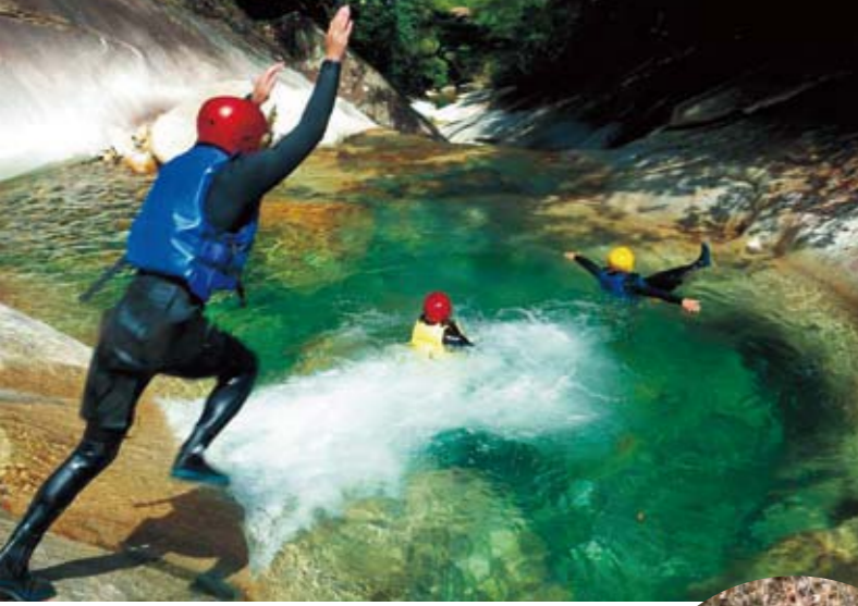
Deep in the mountains within Saiki city limits, in the south, a river flows over an enormous slab of rock in the Fujikawachi Gorge. Here you can enjoy the thrills of "canyoning" and other adventures.