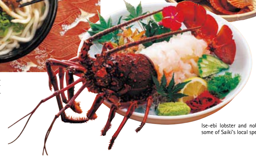
Ise-ebi lobster and noble scallop are also some of Saiki's local specialties.

blackened with charcoal to rub on each other's faces, all in fun as a wish for happiness.