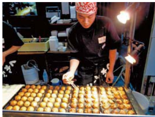
A tako-yaki vendor at the festival. Metal skewers are used to flip tako-yaki several times to make them come out round.