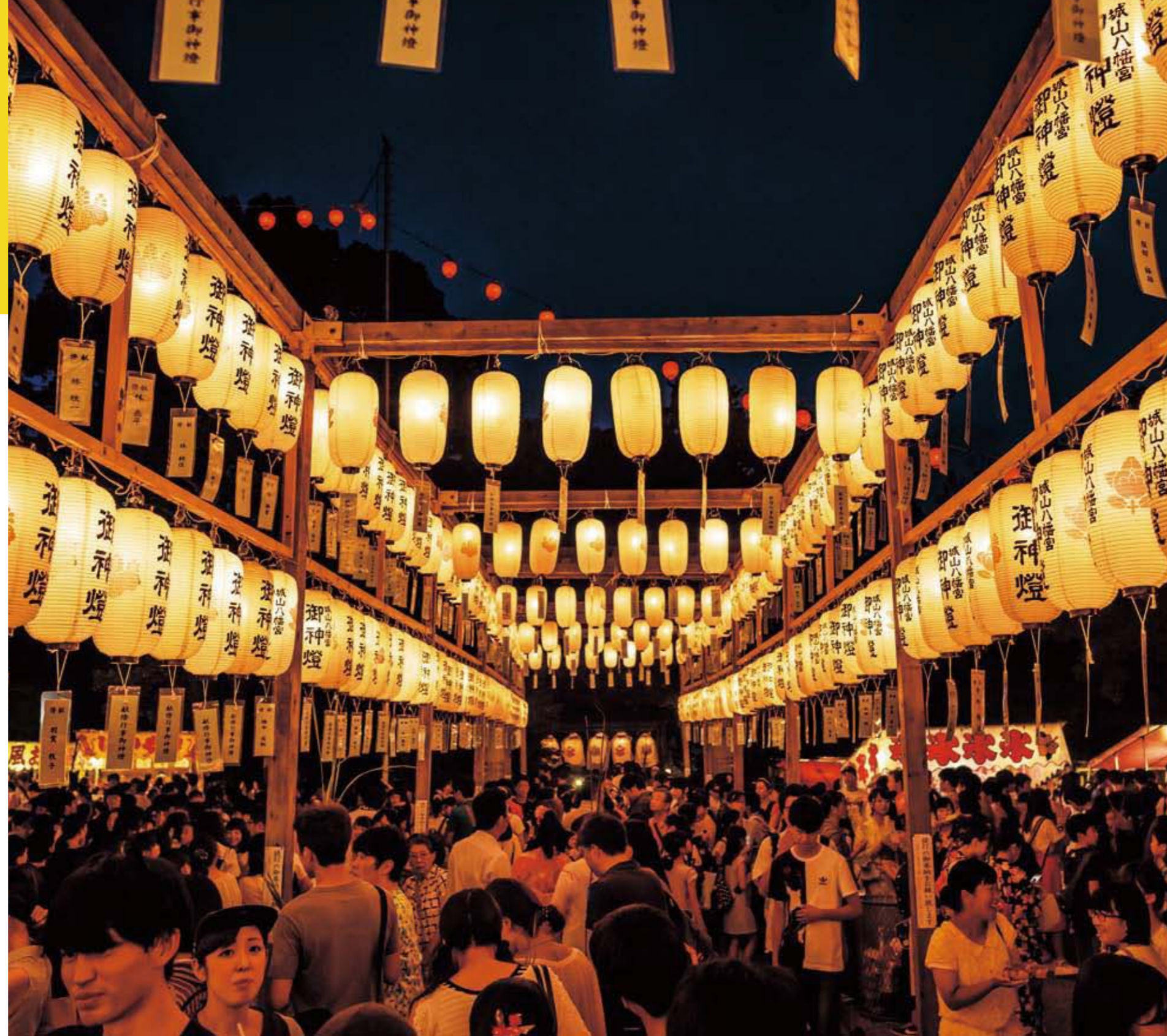
Above: Lantern light creates the otherworldly atmosphere unique to Japanese festivals.

Published by: Ministry of Foreign Affairs of Japan 2-2-1 Kasumigaseki, Chiyoda-ku, Tokyo 100-8919, Japan http://www.mofa.go.jp/