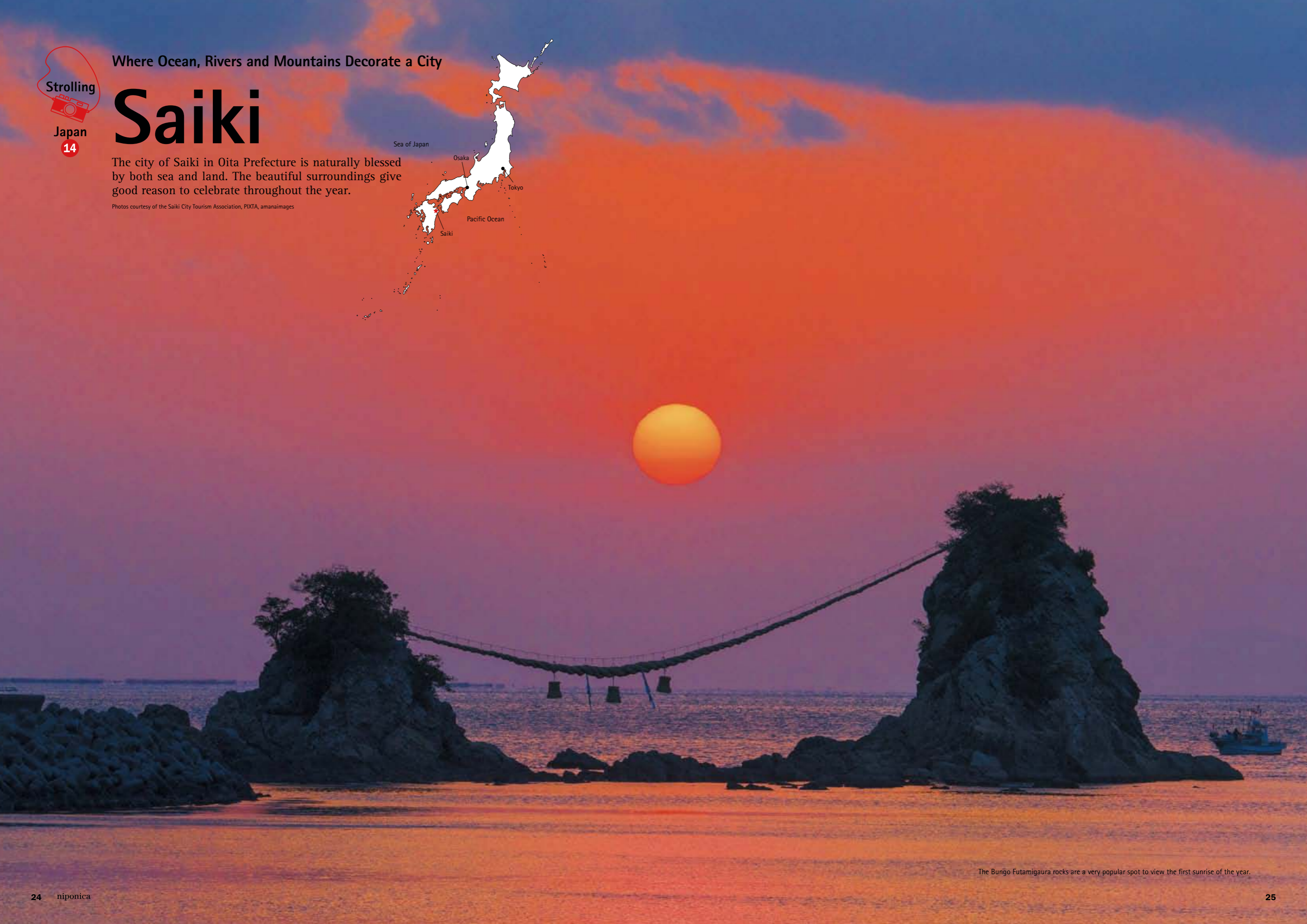
The Bungo Futamigaura rocks are a very popular spot to view the first sunrise of the year.