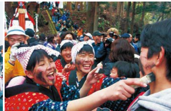
Above left: The Johyara Festival is held every September. Hopes for good fishing are accompanied by big colorful banners flapping in the sea breeze. Above right: A fun way to wish for future happiness: participants in the Kiura Sumitsuke Festival rub charcoal on each other's faces. The more charcoal, the happier the outcome. Left: Green tourism programs include interacting with the locals, to learn about Saiki's natural environment, culture and history.