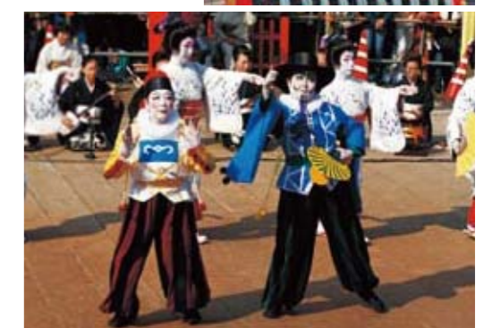
Above: Yamahoko floats in the Gion Festival decorated with fabrics woven abroad. Below: Dancing styles and attire originating in the Netherlands, at the Nagasaki Kunchi Festival.