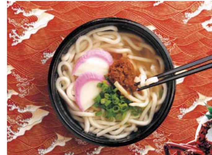
Fish stock goes into making goma dashi udon . Boiled noodles are dropped in the bowl, the piping hot stock is poured on, and the meal is ready.