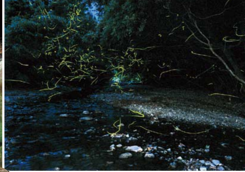
Japanese fireflies numbering in the hundreds of thousands gather over the upper reaches of the Bansho River within the city limits, from the middle of May to mid-June. They are celebrated with local festive events. Left: Japanese serow (goat-antelopes) and sobo-sanshouo salamanders are among the rare wildlife living in the western mountains.