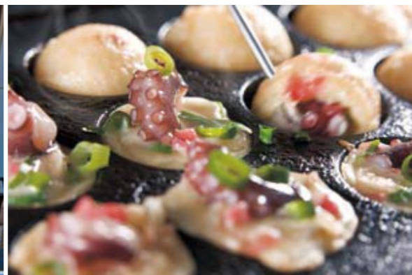
Place wheat flour and diced octopus into the batter in the semi-circular frying mold.