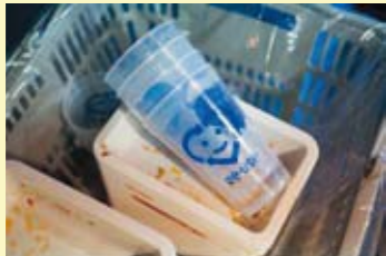
"Reuse" marks have helped reduce the amount of garbage.

Collaboration: Gion Festival Action Plan for Zero Garbage Association