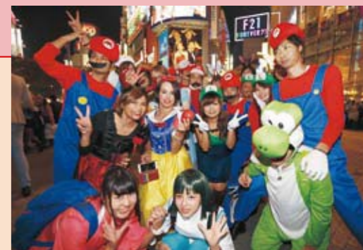
Young people dressed up as characters from anime shows and video games.

Special sales counters at department stores offer costumes, together with makeup sets and accessories. The economic ripple effect from this fad is growing year by year.