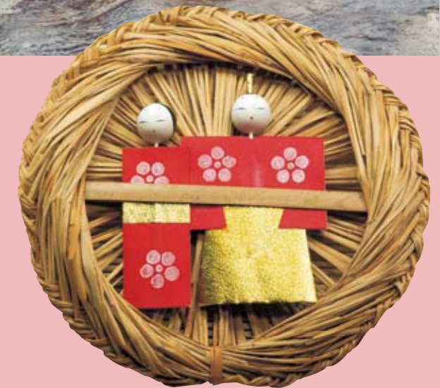
Top: Girls in their best kimono set the dolls afloat with their wishes. Above: Dolls of a married couple could be used in a ritual as substitutes for people.

Since the custom first developed about 400 years ago, the dolls, made generally from paper, are brushed against a person's body so that misfortune and bad luck is transferred to the dolls, and then to the river after the dolls float away. Today, girls dressed in their festive best gather on the riverbed on the day of the festival and, together with their sisters and other family members, set the dolls on the flowing water. The scene is quite colorful, just the right setting for a girls' festival.