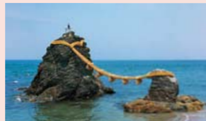
These outcrops in the sea are regarded as sacred.

spirits of ancestors coming to visit this world. Good harvests in autumn called for thanks to be given to the gods for their blessings. Cold winter days were a time to express thanks for a year free from misfortune and hopes for the new year. So you see, the seasons and their changes were celebrated as a way to ask the gods for help in overcoming change and adversity. The result is a wide variety of festivals held throughout the year, even today.