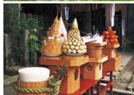
1 Rice planting festival held with prayers for a rich harvest. 2 Bon dances in summer said to chase away spirits that make people sick. 3 Vegetables and other fruits of the harvest are dedicated to God in autumn. 4 A divine spirit is said to come in the form of an ogre in winter to bring blessings.