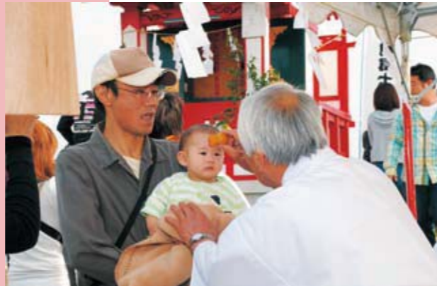
Above: The red seal on the forehead stamped by the shrine represents divine protection. Below: The priest at this Shinto shrine radiates affection as he makes the red seal.