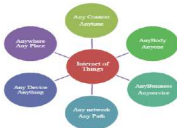
Figure 1. Dimensions of IoT [10]

According to these definitions, Figure 1 shows the dimensions of IoT.