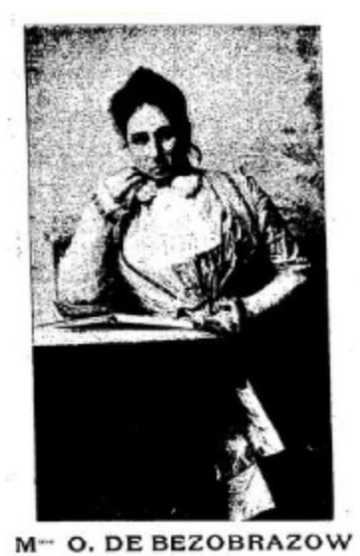
Fig. I: The only extant photo of Olga de Bézobrazow, taken from the 1903 Revue Moderne

With the assistance of popular French feminist Clothilde Dissard, Bézobrazow selffunded, edited, wrote in, and published—on a monthly, bi-monthly, and once even tri-monthly basis—the consciously didactic Revue between May 1896 and April 1897. On any given page of any edition, one could find an esoteric poem, an installment from a contemporaneous novella, a polemic, a literary review, a legal, sociological, or historical inquest, or an overview of international or local current affairs in literature, society, and politics. The Revue's stated purpose was to arrange a plurality of voices from diverse national and cultural backgrounds (although the vast majority of contributors were French and Russian writers claiming noble lineage) "for the active exercise of feminine propaganda".17