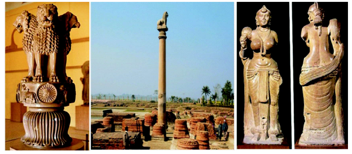
aesthetics of a female body as conceptualized during that historical period.Lost-wax casting,

A bronze statuette 10.5 cm. (4.1 inches) high, hailing from Mohenjodaroin astanding position, was named 'Dancing Girl' with an assumption of her profession. This bronze art works found at Mohenjodaro show more flexible features when compared to other formal poses. The girl is naked, wears a number of bangles and a necklace and is shown in a natural standing position with one hand on her hip. She wears acowry shell necklace with three big pendants and her long hair styled in a big bun rests on her shoulder. This statue reflects the