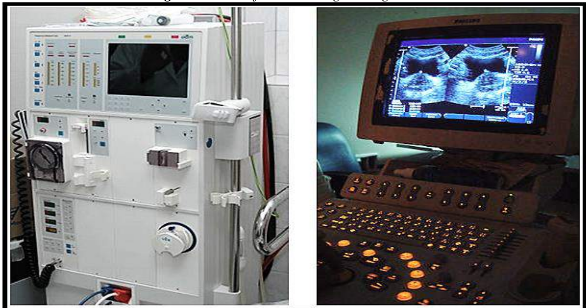
Figure 3: Medical engineering device for dialysis.