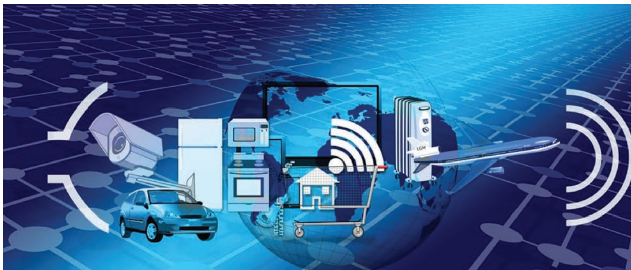
Figure 1.2: ICT Around Us

digital television. In addition to printed newspapers now we also have their electronic versions. Along with traditional radio, we also have online radio.