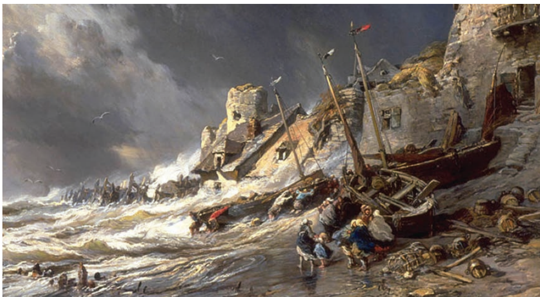
Figure 1.1: Coast Scene

Technology refers to methods, systems and devices, which are a result of scientific knowledge, being used for practical purposes. For example, Muskan went to an excursion to Bhubaneswar and visited the State Museum. She saw various mineral ores in the mineral section of the museum. She decided to capture photographs to share with others who may not have seen the ores. She borrowed her teacher's mobile and clicked pictures of the rare collection. She shared all the pictures on her blog along with a description of the ores. Many viewers commented and appreciated Muskan for sharing those pictures and description.