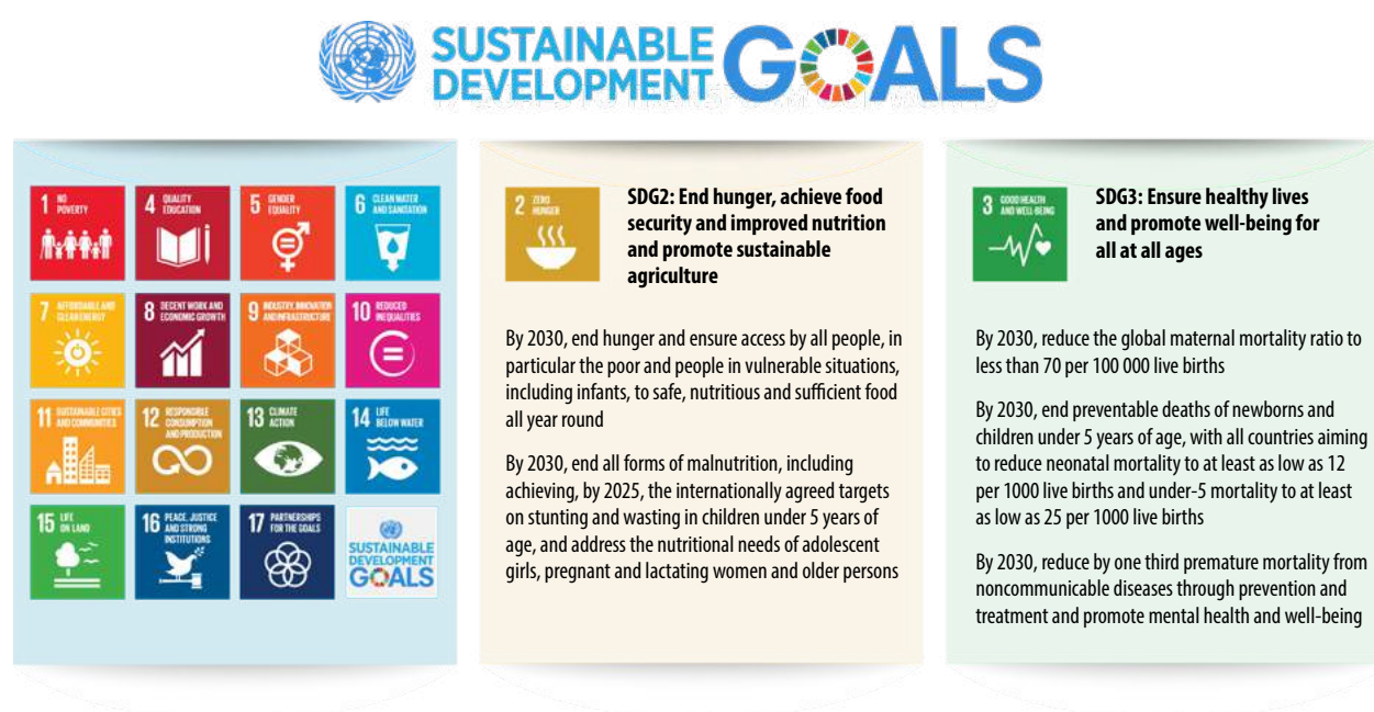
Fig. 2. Sustainable Development Goals most relevant to nutrition, and associated targets

In 2012, the 65th World Health Assembly endorsed the WHO global nutrition targets 2025, which provide concrete goals against which progress toward ending malnutrition in all its forms can be measured (see Fig. 1) (5). These six targets have helped focus the global community on priority areas to improve the nutritional status of women, infants and children. Closely following the establishment of the global nutrition targets, an additional three diet-related global noncommunicable disease targets were endorsed by the World Health Assembly, as part of the WHO Global action plan for the prevention and control of noncommunicable diseases 2013–2020 (20) (see Fig. 1). Reaching these nine targets will contribute to achievement of the United Nations Sustainable Development Goals, particularly SDG2 and SDG3, which aim to end hunger, achieve food security, improve nutrition, address all forms of malnutrition for all age groups, and ensure health and well-being for all at every stage of life, and came into effect in 2016 (see Fig. 2) (3). The aims of SDG2 and SDG3 directly address nutrition (see Fig. 2), but in total, 12 of the 17 SDGs have indicators that are highly relevant to nutrition (11). The past decade has witnessed the establishment of several global commitments and shared global declarations that have brought action in nutrition to