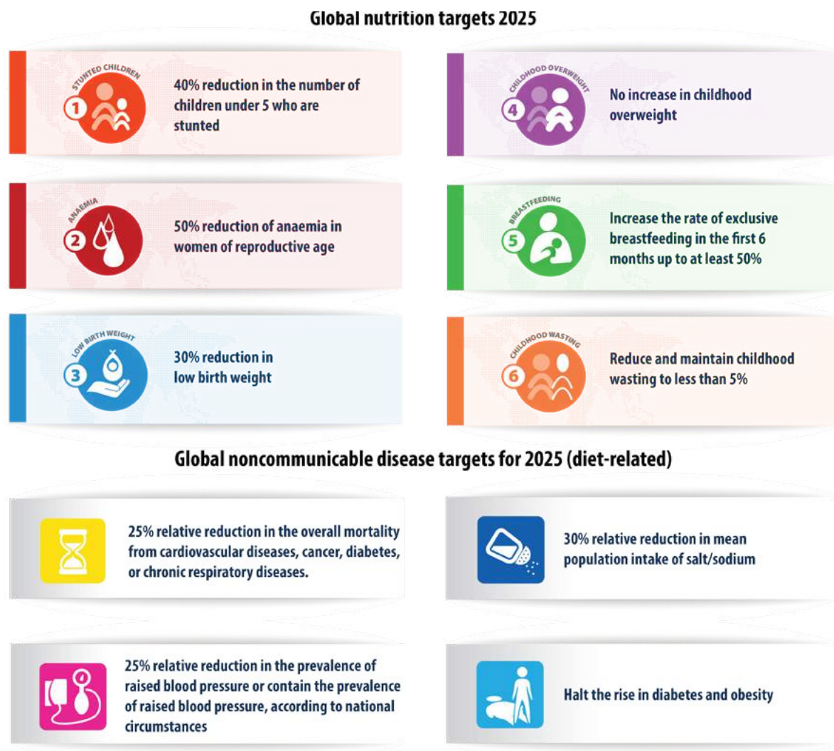
Fig. 1. WHO global nutrition targets 2025 and global, diet-related, noncommunicable disease targets for 2025