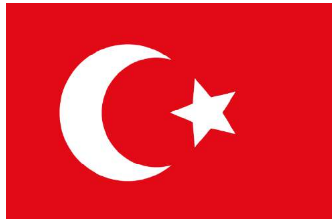
Flag of the Ottoman Empire (look familiar?)