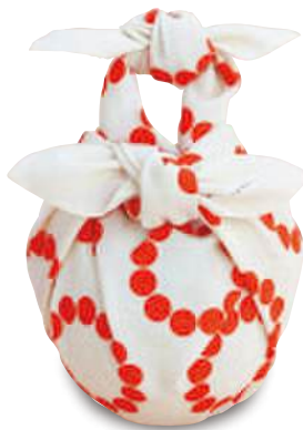
Watermelon (left) and wine bottle wrapped in furoshiki