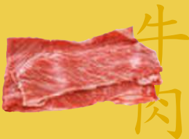
● Sliced beef

Serves 4 to 6 734 kcal Protein 18.7 g Fat 36.4 g (per person)