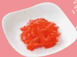
◆ Beni shoga