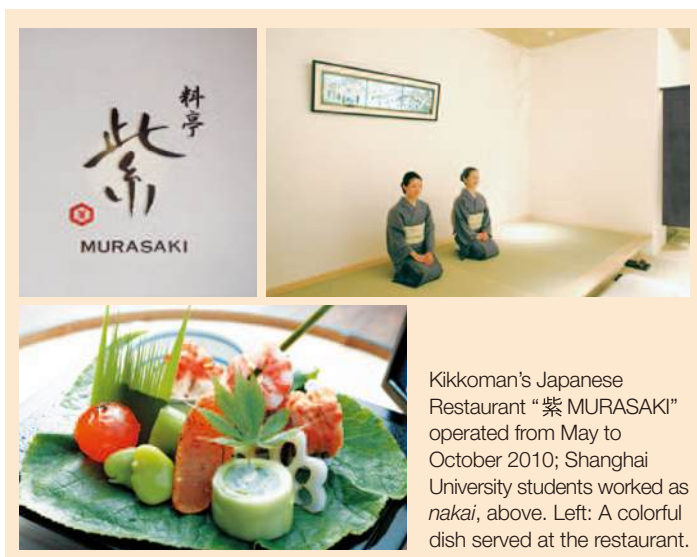
Kikkoman’s Japanese Restaurant “紫 MURASAKI” operated from May to October 2010; Shanghai University students worked as nakai , above. Left: A colorful dish served at the restaurant.

This summer Kikkoman plans to invite students from these five universities to participate in a company-sponsored essay contest on “Pleasant memories about food that bring smiles.” The grand prize winner will be invited to Japan this fall. Kikkoman values the connections that were established at Expo 2010 Shanghai, and will continue to contribute to the cultural exchange of food and ideas between Japan and China. ◆