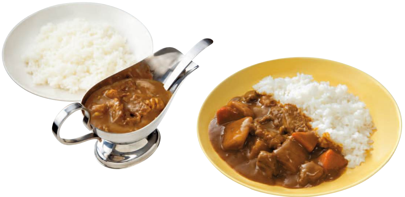
Curry sauce may be served separately in a gravy boat (left), or poured partially over rice, as shown at right