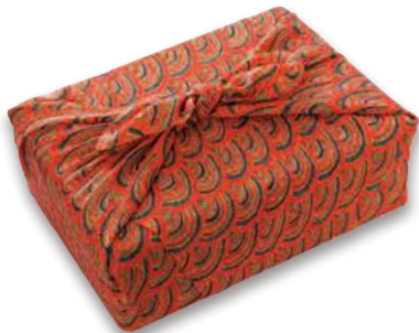
Popular way to wrap

Furoshiki come in many colors and patterns, some with the family crest. Furoshiki are ideal for wrapping objects of different shapes and sizes, and so are perfect replacements for paper gift-wrapping. After unwrapping the gift, the furoshiki is taken home by the giver. These days, this handy cloth has aroused a new appreciation, thanks to its ecological aspect, as it can be reused time and again.