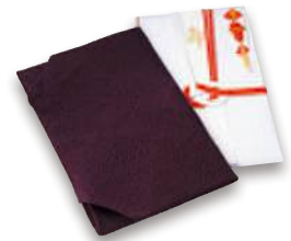
Fukusa and monetary envelope for a wedding