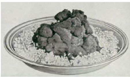
Illustration of curry with rice from Beeton's Book of Household Management .