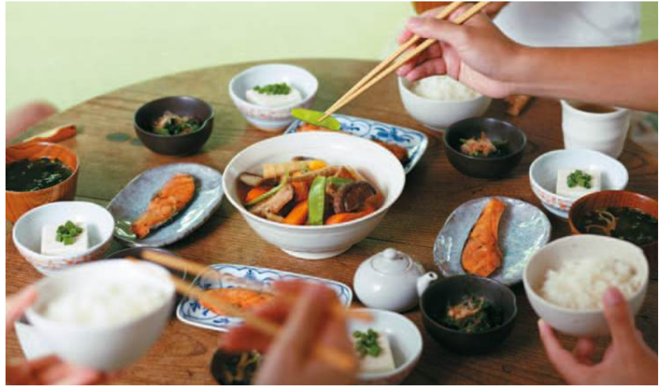
Washoku comprises a wide range of foods, including vegetables and fish.

Washoku is based on a spirit of respect for nature