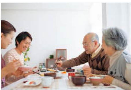
A family enjoys washoku together

UNESCO will determine as early as this autumn whether washoku will be registered as an Intangible Cultural Heritage. In Japan, the efforts involved in registering with UNESCO have served to awaken a greater appreciation and awareness of the true cultural value of the country’s unique cuisine. ◆