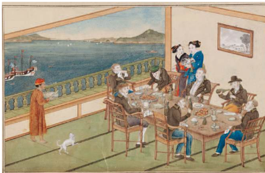
Early 19th-century scroll depicting a banquet, with views of the Dutch Factory and Chinese Quarter in Nagasaki. Torankan-emaki, rankan-zu emaki-zu by Kawahara Keiga.

At that time, most Western cookbooks invariably included a recipe for “curry and rice”—and it is this dish that has become a classic example of Japanese and Western fusion cuisine. Despite its Indian origins, curry and rice was introduced via England, where it had entered the diet from the British colonies; it was often made with white meat, such as chicken or rabbit. In Japan, its roots in India were not known, and curry rice here was served just as described in Mrs. Beeton’s recipe, with curried beef