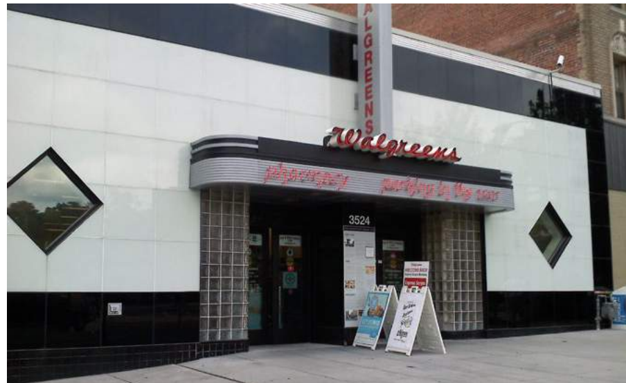
[11] (a) Some of the materials on the front of this historic building had been previously replaced, but the façade retained its essential distinctive features and design. (b) A vintage postcard of the building (far left) provided sufficient documentation to restore the façade to its historic 1945 appearance, using spandrel glass as a replacement for the original Carrara glass (c).