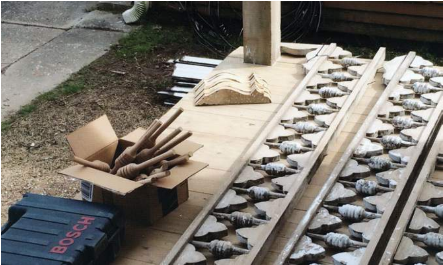
[5] New wood trim pieces were milled to match the few remaining historic features to replace those that were missing.

Constructing a wood feature that was part of the original design for the building but was never actually built, or a feature which was thought to have existed during the restoration period but cannot be documented.