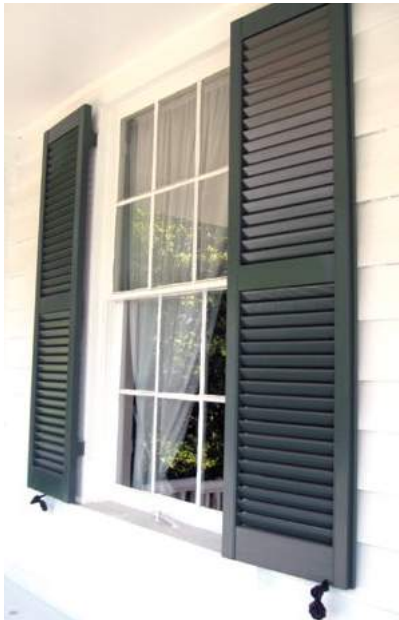
[9] Historic window and shutter hardware such as that shown here should be retained and repaired in a restoration project.