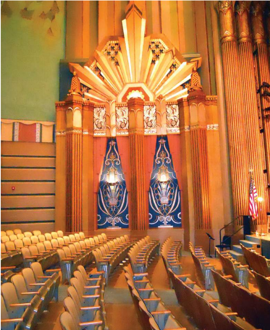
[14] When the 1931 Fox Theater in Spokane, WA, was rehabilitated as a performing arts center, the auditorium was restored to its original Art Deco splendor.