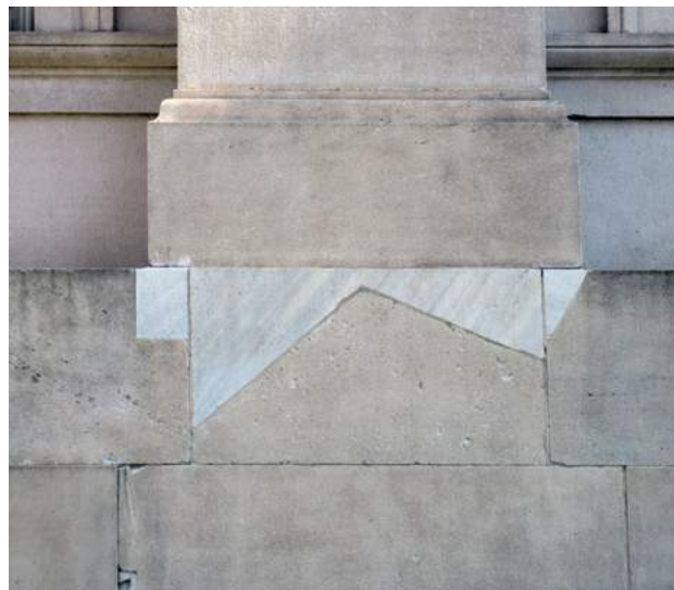
[3] Not Recommended: Although the Dutchman stone repair has been well executed, the replacement stone is not a good color match.