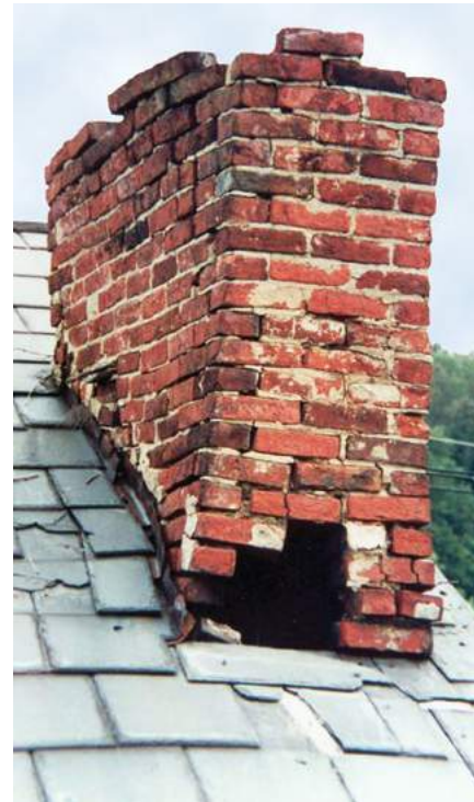
[7 a-b] This crumbling chimney was restored to its historic appearance using matching bricks.