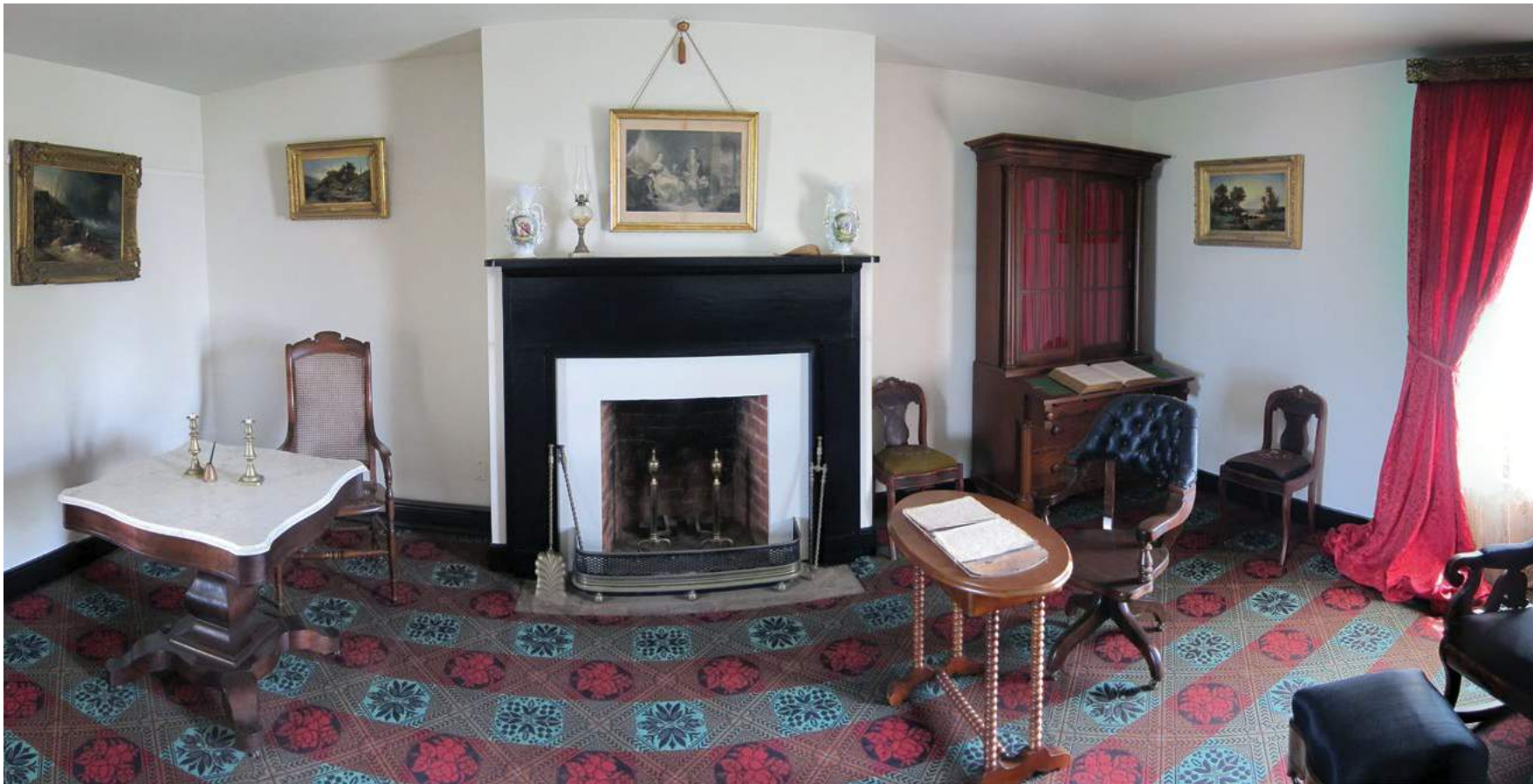
[5] The parlor of the McLean House was reconstructed to its appearance on the occasion of Robert E. Lee's surrender to Ulysses S. Grant in this room on April 9, 1865.