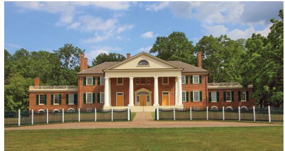
[1] (a) When it was acquired by the National Trust for Historic Preservation in the 1980s, Montpelier in Montpelier Station, VA, the home of James and Dolley Madison, had been much altered and enlarged since it was first constructed. Based on historical documentation and research, Montpelier was accurately restored to its 1820s appearance when the president and his wife lived there (b).