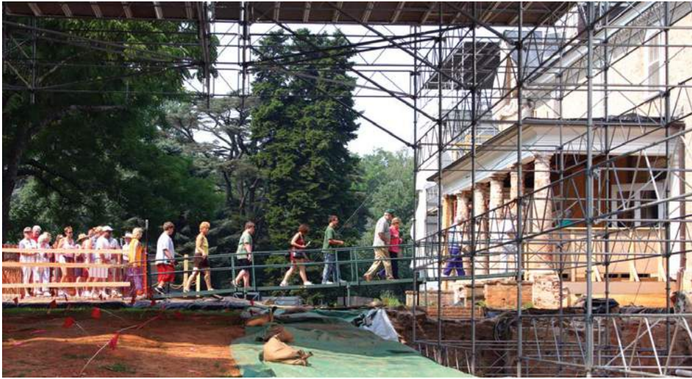
[16] Archeological investigation of the property was undertaken to ensure accuracy of the restoration of Montpelier.