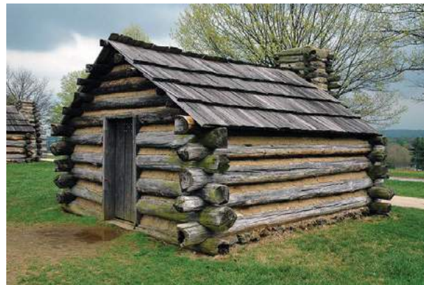
[7] The Muhlenberg Brigade Huts are reconstructions of nine log huts erected in 1777 at Valley Forge during the Revolutionary War. They have been reconstructed on the historic road with logs cut with modern power tools and finished with cement, unlike the original logs which were hand hewn and finished with traditional chinking.