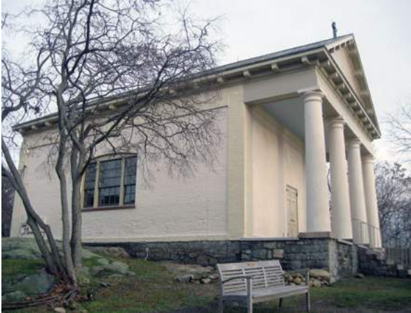
[18 a-b] The historic Chapel of Our Lady in Cold Spring, NY, is situated on a rocky promontory overlooking the Hudson River. Installing an accessible ramp would greatly compromise the character of the building and the site. However, an audio-visual program available in a separate building—located where it would not impact the character of the site, such as this small pavilion at the rear of the property—could provide visitors otherwise unable to access the Chapel an opportunity to experience the site.