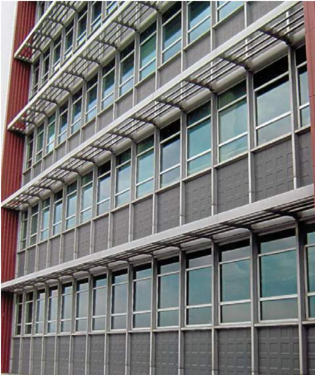
[12] This historic curtain wall features a distinctive variety of panel types which must be repaired or replicated in a restoration project if any are damaged or missing.

Replacing an entire curtain wall from the restoration period when repair of materials and limited replacement of deteriorated or missing components are feasible.