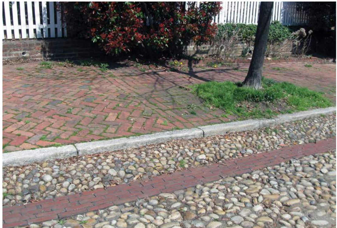
[17 a-b] The cobblestone street, brick sidewalks, and stone stoops of these houses are important restoration-period features of the late 18th-through the 19th-century restoration period of this historic district.