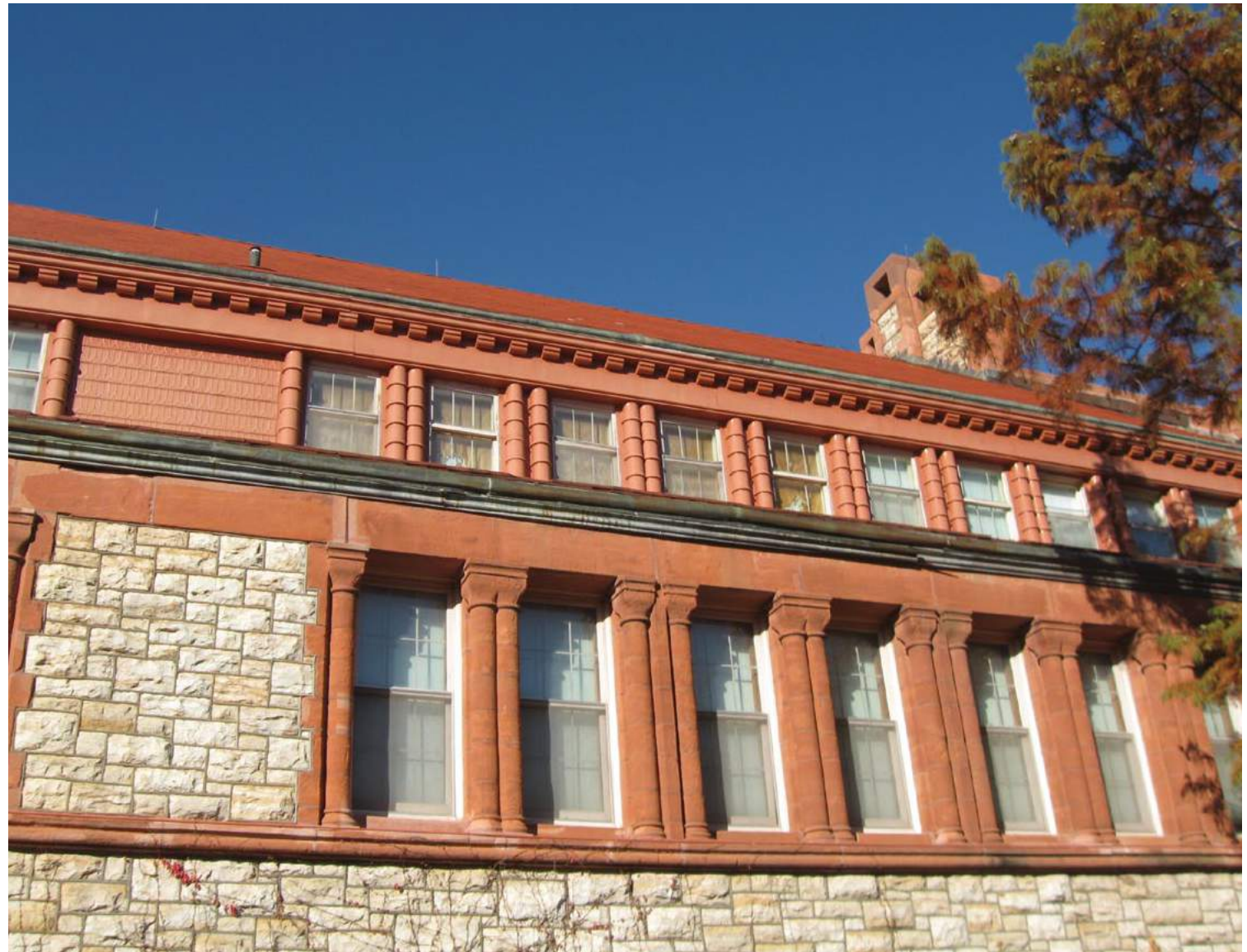
[6] Preliminary work before starting restoration revealed that the columns and the decorative shingles ornamenting the top floor of this historic building were fabricated of metal to imitate the red sandstone used elsewhere on the building.