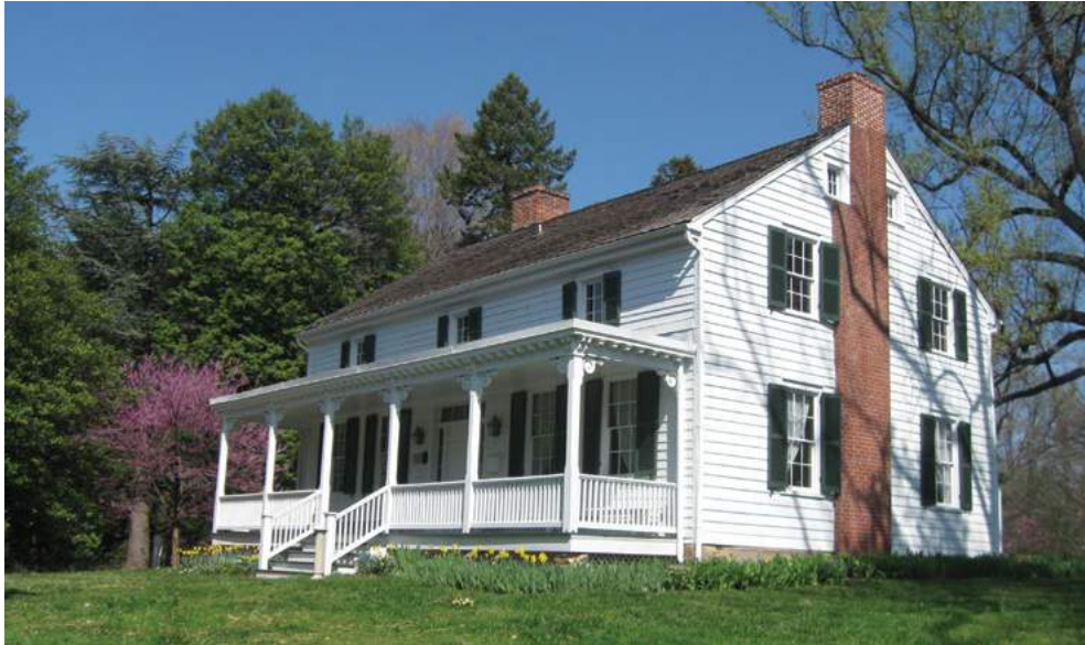
[15] (a) Cherry Hill House and Farm (c. 1845) in Falls Church, VA, was the site of encampments during the Civil War. Outbuildings on the property, such as the corn crib (b) in the foreground which was the source of provisions for the soldiers, are important in interpreting its role during the war.