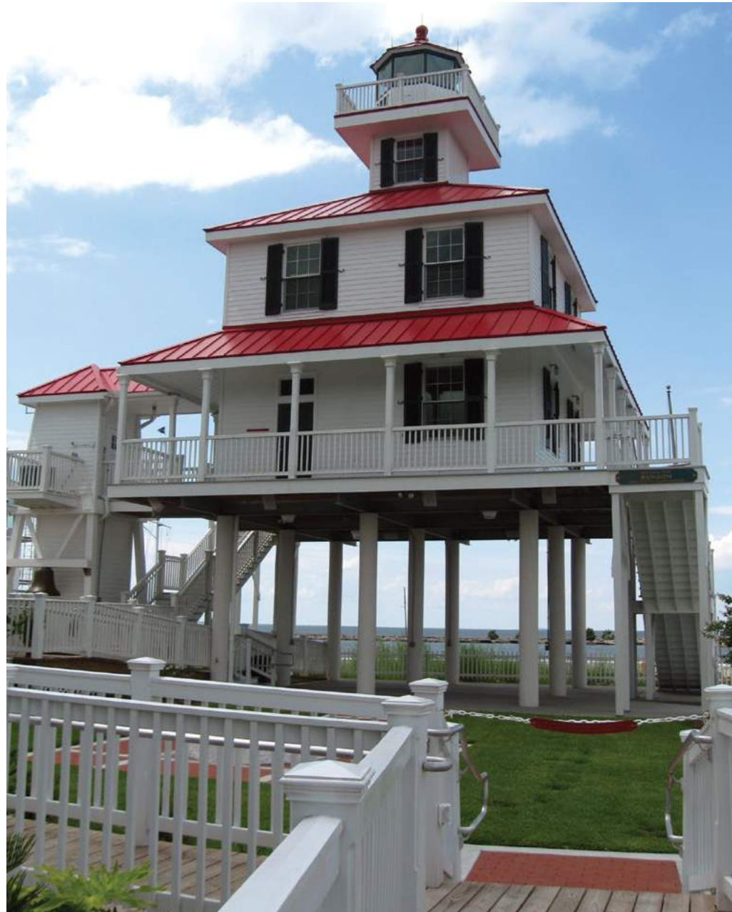
[6] This lighthouse on Lake Ponchartrain in New Orleans was reconstructed after the historic 1890 lighthouse was destroyed by Hurricane Katrina.