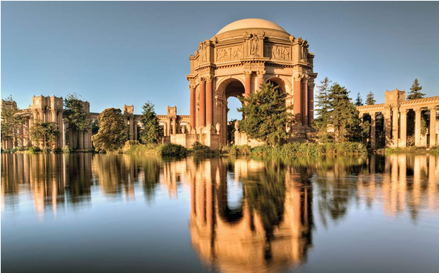
[8] The Palace of Fine Arts was designed by Bernard Maybeck and built for the 1915 Panama-Pacific Exposition in San Francisco. The pavilion was intended to be temporary and, although it had a steel structure, the exterior was finished only with stucco, an impermanent material composed of plaster and fiber. The building was not torn down after the exposition, and it eventually fell into ruin. In 1964, all but the steel structure was demolished, and the building was reconstructed with lightweight poured-in-place concrete.