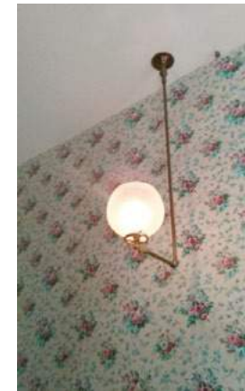
[13] (a) In the 1990s the Missing Soldier's Office—established by Clara Barton at the end of the Civil War—was discovered still extant on the third floor of a building in Washington, DC, that was slated for demolition. The office was restored to its historic appearance using physical and documentary evidence. The original numeral '9' is still on the door to the office, and wall paper was reproduced from scraps found on the walls (b-d).