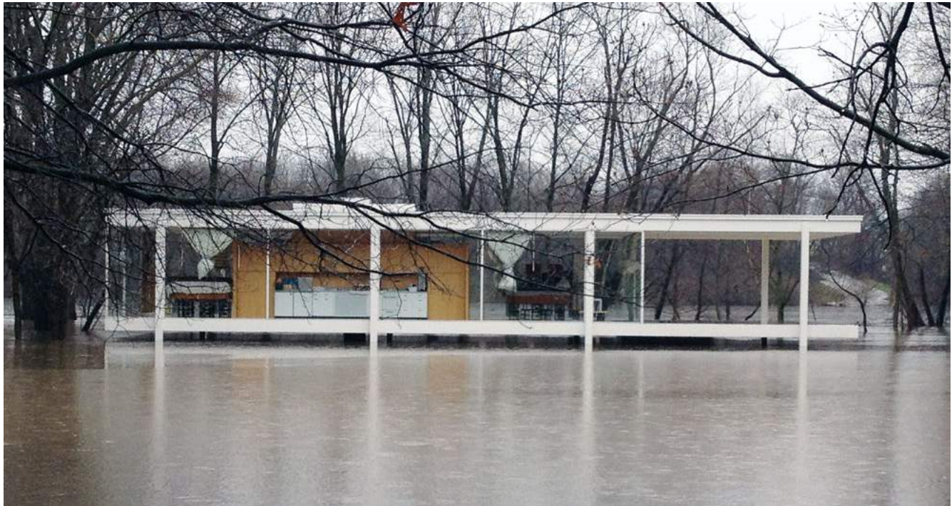
[19] The 1951 Mies van der Rohe-designed Farnsworth House, Plano, IL, was built close to the Fox River, which is increasingly prone to floods. To preserve the house in its original location, historic preservation architects and engineers continue to explore ways to protect it from the flooding, including a possible system that would lift the house above the flood waters and lower it back to the ground.