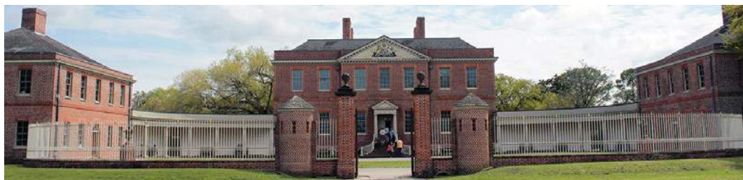
[1 a-b] Tyron Palace, New Bern, NC, was designed by John Hawks in 1767 for Governor William Tyron. It was completed in 1770, but destroyed by fire in 1798. The palace was reconstructed in 1959 based on the original plans, and on its original foundation, which was found 5 feet below the street, with the help of the 1767 drawing. Photo: Courtesy Tyron Palace, New Bern, NC. Drawing: Courtesy of the State Archives of North Carolina.