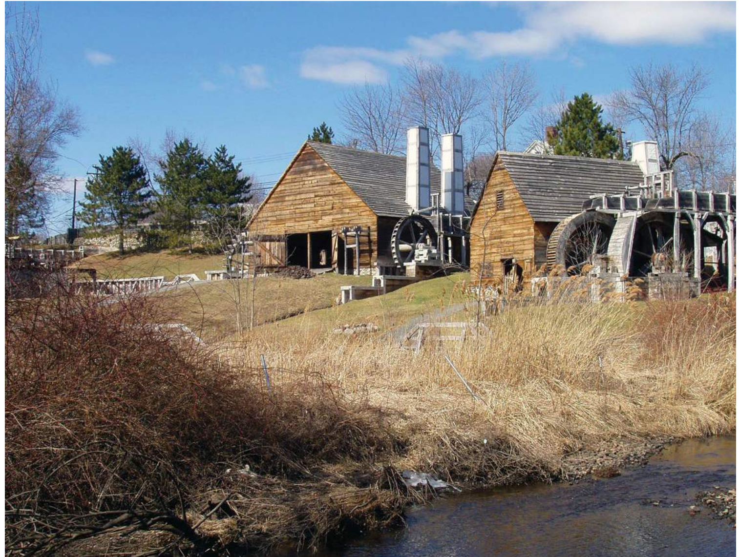
[2] The Saugus Iron Works, Saugus, MA, a National Historic Site, was active from 1646 to about 1670 and was the first integrated iron works in North America. The forge and mill (shown here) are part of the site which was reconstructed based on archeological research and historic documents and opened in 1954.