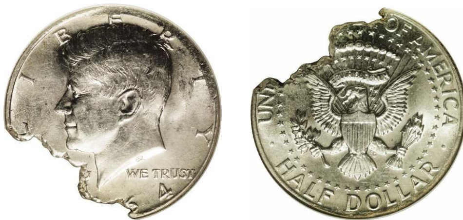
1964 Kennedy half dollar struck on a ragged-clipped planchet. A clip like this occurred due to the blank being punched out too close to the end of the sheet of metal.