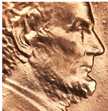
1984 Lincoln cent, doubled die obverse (notice the strong doubling below the ear and beard).