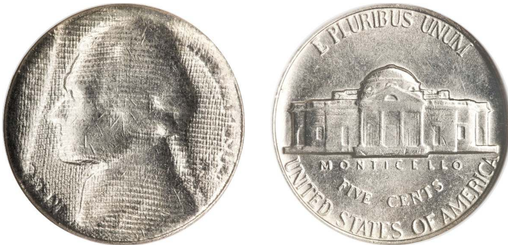
1964 Jefferson nickel obverse struck through cloth, producing a grid-like pattern.