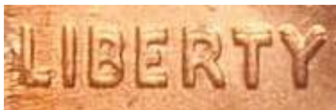
1995 Lincoln cent, doubled die obverse. This is a moderately doubled die, but still desired by many collectors. This is a great "first DDO" variety to search for.