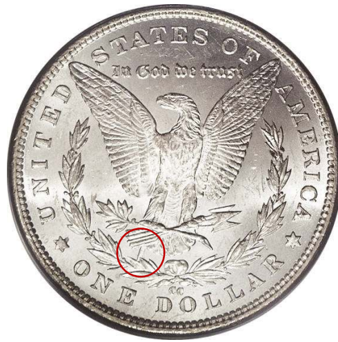
1890-CC Morgan silver dollar with a "tail bar" die gouge (right, normal reverse die left). Look under the arrow shafts for the thick line going down to the wreath, above the "E" in "ONE." A gauge on a die will show up as a raised mark on the coin struck from it.