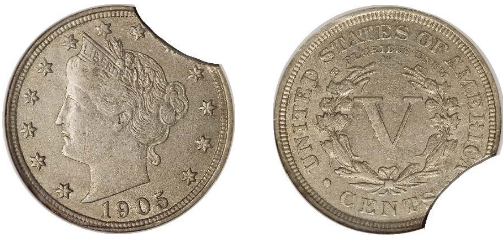
1905 Liberty Head nickel struck on a curved, clipped planchet.