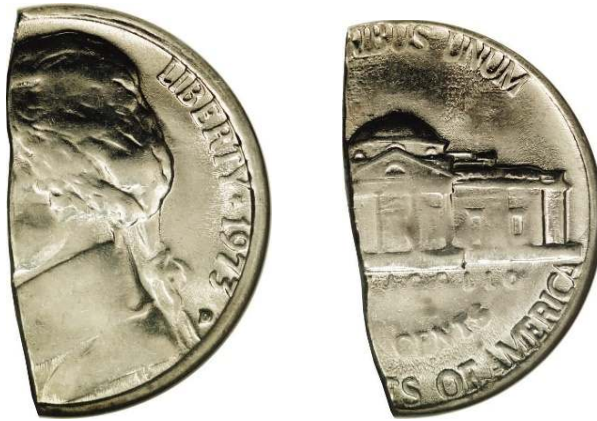
1973-D Jefferson nickel struck on a straight-clipped planchet. A straight clip like this is most likely from the end of a strip/sheet.