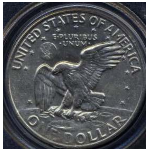
1972 Eisenhower dollar struck with partially filled-in dies. (Note: Circulated specimen but the lack of obverse details is due to a filled-in die as evidenced by the strength of the reverse design. The reverse die was also partially filled-in as evidenced by weakness on the "NE" and "D" in "ONE DOLLAR.")