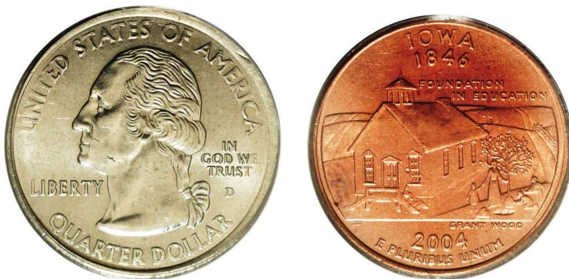
2004-D Iowa statehood quarter missing the entire reverse clad layer. Copper core fully exposed.