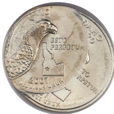
2007-D Idaho statehood quarter double-struck ( not a doubled die). The first strike was centered properly, but the accidental second strike was struck about 40 percent off-center.