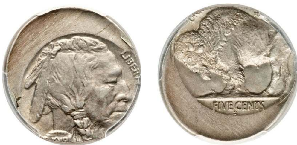
1918-S Indian Head/Buffalo nickel, struck about 25 percent off-center.

Eisenhower dollar blank (left) and Eisenhower dollar planchet (right). Notice that the blank is completely flat across the surface. The planchet has gone through the upsetting mill, as evidenced by the raised rim along the edge. Blanks are usually turned into planchets before they are struck.