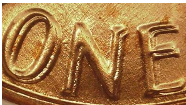
1983 Lincoln cent, doubled die reverse.