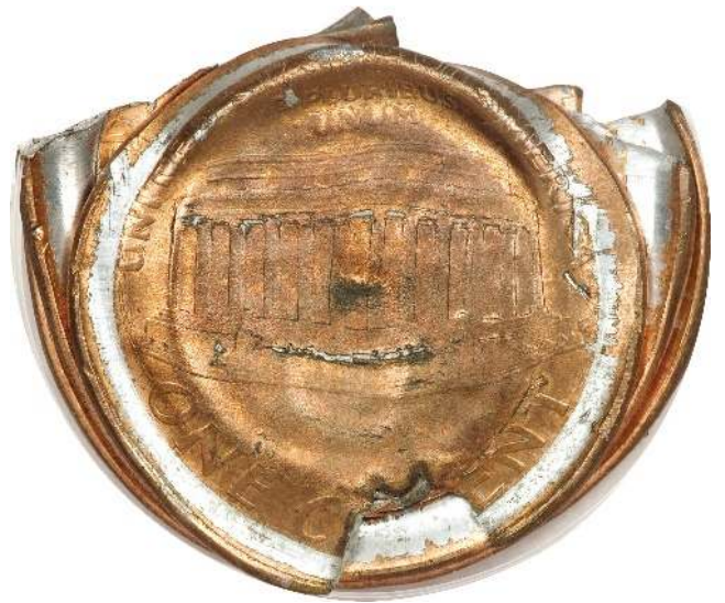
1999 Lincoln cent, three-piece bonded die cap. Three separate planchets became stuck in the coining chamber and were fused or bonded together due to the intense heat and pressure.