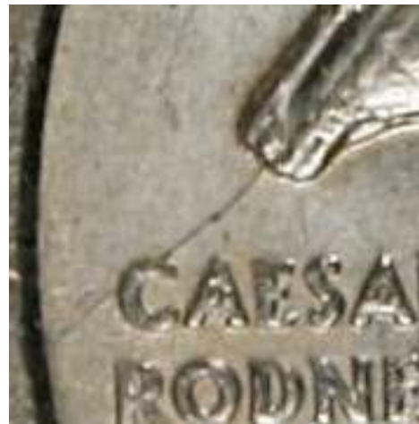
1999-P Delaware statehood quarter with a reverse die crack. (Enlarged image, right.)