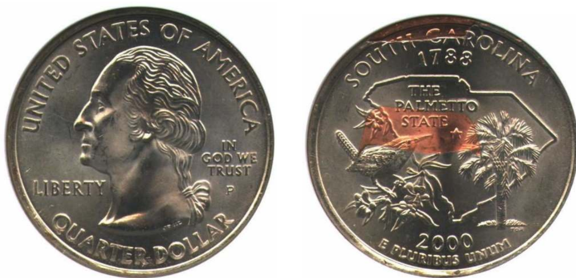
2000-P South Carolina statehood quarter reverse missing partial clad layer. Copper underneath is showing.