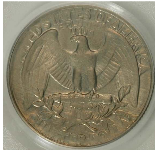
1970-D Washington quarter struck on a planchet the thickness of a dime. (Not struck on a dime planchet, but on copper-nickel stock that was rolled out for dimes. The coin was not able to receive a full/strong strike due to the thinness of the planchet. Dimes are thinner than quarters.)