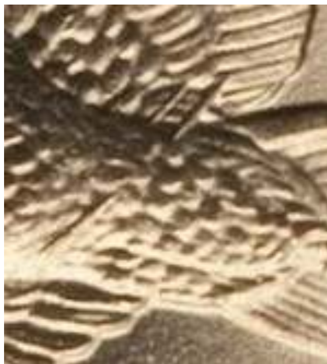
2000-P Sacagawea dollar, "Wounded Eagle" Reverse. Note the huge die gouge running through the eagle's belly. Some varieties earn clever nicknames; these "Wounded Eagles" can still be found in circulation.