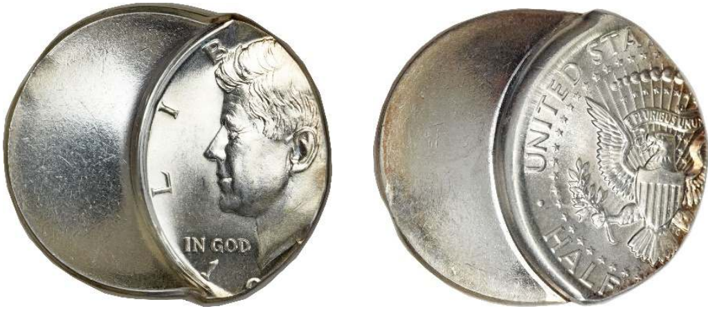
1964 Kennedy half dollar, struck about 50 percent off-center.