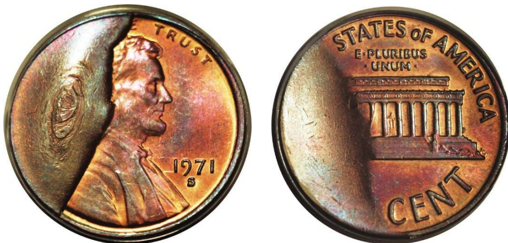
1971-S Lincoln cent with a major obverse die break. This huge cud was created by a piece of metal breaking off the obverse die face. (Notice the area on the reverse that couldn't be struck because of the void created by the missing portion of the obverse die.)