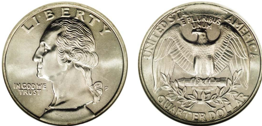
(19--)-P Washington quarter with an obverse die break where the date should be. This is a "cud." (Notice the affected area on the reverse that did not strike fully due to the obverse cud error.)