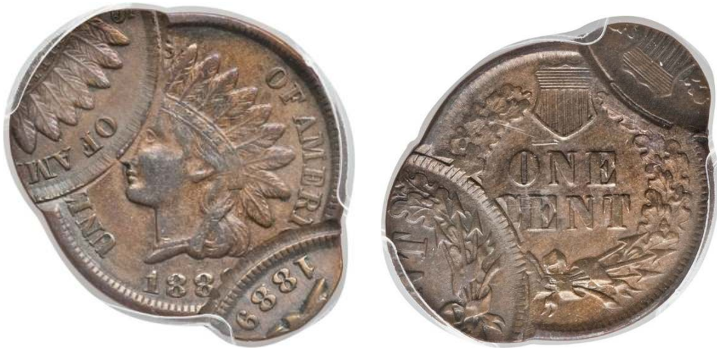
1889 Indian Head cent, triple struck.