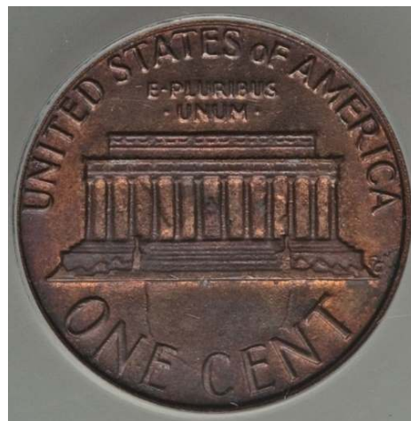
1985 Lincoln cent with clashed dies—an error nicknamed a “Prisoner Penny” as it appears Lincoln is behind bars! These raised lines surrounding Lincoln are from the spaces between the columns of the Lincoln Memorial design seen on the reverse. They were transferred to the obverse die from the reverse die when they smacked together without a planchet in between them.