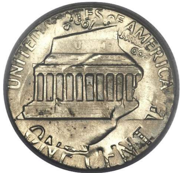
1981 Lincoln cent struck on a 1981-P Roosevelt dime. This is technically a double-denomination error, but it's much more fun to call it an 11-cent piece!