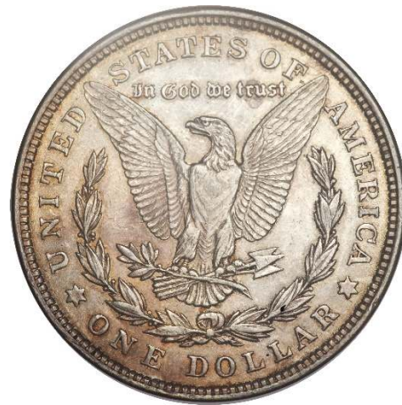
1921 Morgan silver dollar, obverse struck through grease or a filled die (reverse die unaffected).