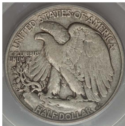
1921-S Walking Liberty half dollar, planchet lamination on obverse. Lamination errors are often the result of an improper mixture of coinage metals (reverse not affected).