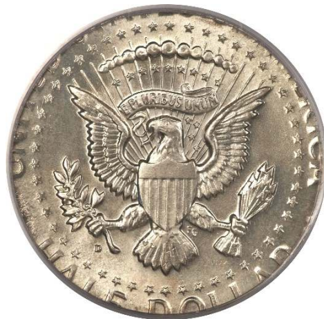
1964-D Kennedy half dollar struck on a quarter dollar planchet.