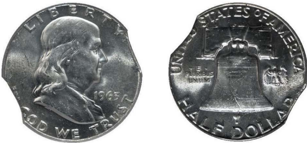
1963 Franklin half dollar struck on a double-curved, clipped planchet.