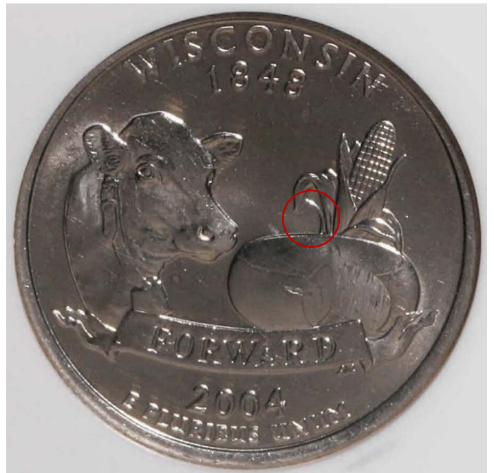
2004-D Wisconsin statehood quarters, normal reverse die (top), Extra Leaf-low (left), and Extra Leaf-high (right). Some Wisconsin quarters from the Denver Mint were struck with a strong die gouge on the reverse, under the left leaf on the ear of corn. This is a mysterious variety, as no one knows how or why this happened. Die gauges show up as raised marks on struck coins.