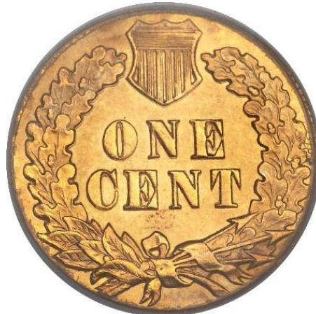
1900 Indian Head cent struck on a $2½ gold quarter eagle planchet.