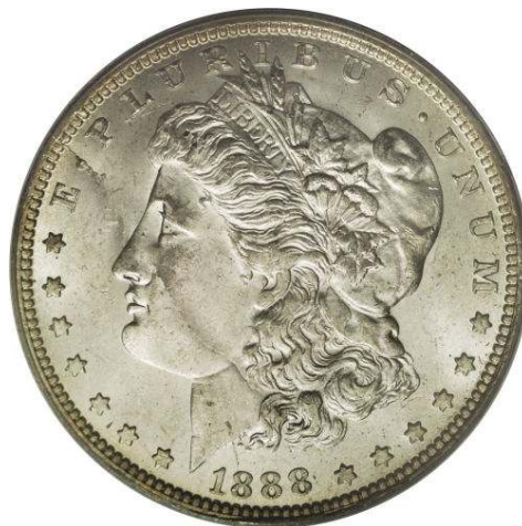
1994-P Jefferson nickel reverse and 1888-O "Scarfaced" Morgan silver dollar with sizable obverse die cracks.