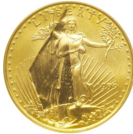
1966 Lincoln cent obverse struck through a staple that has been retained, and 1999 $25 American gold eagle obverse struck through a foreign object that was not retained.