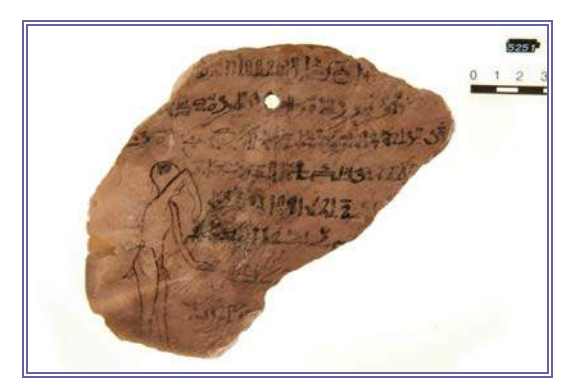
Figure 1. Sehaqeq, the headache demon. Ostracon Leipzig, Ägyptisches Museum Georg Steindorff. Inv.-No. 5152.