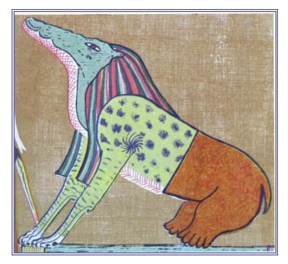
Figure 4. Ammut, "the devourer of the dead", from Spell 125 of the Book of the Dead .

Egyptological interpretation of demons as minor deities derives from these protective figures, which are often depicted with an animal head on an anthropomorphic or mummified body and holding knives or other weapons in their hands.