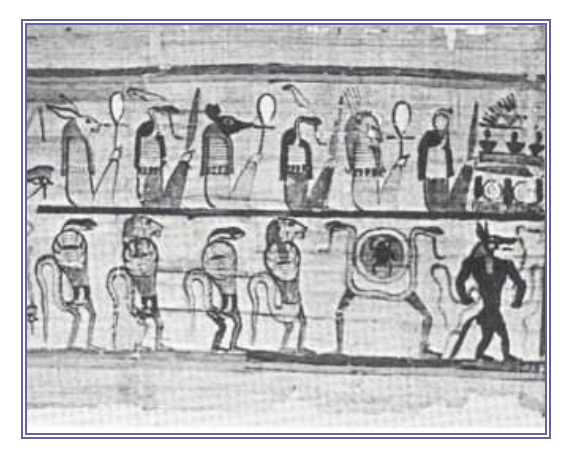
Figure 3. Guardian demons from a Guide of the Netherworld