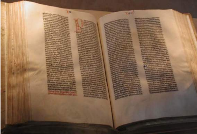
An original copy of the Gutenberg Bible at the Library of Congress in Washington D.C.

Gutenberg's moveable type printing press was made possible by the earlier invention of paper which, by the 15 th century, had largely replaced vellum (leather). It used to take 170 calfskins to produce one copy of the Bible, so the use of paper reduced the cost of books. However, prior to Gutenberg, scribes still had to copy texts by hand thus keeping books financially out of reach for many people. In addition, copying errors were common.