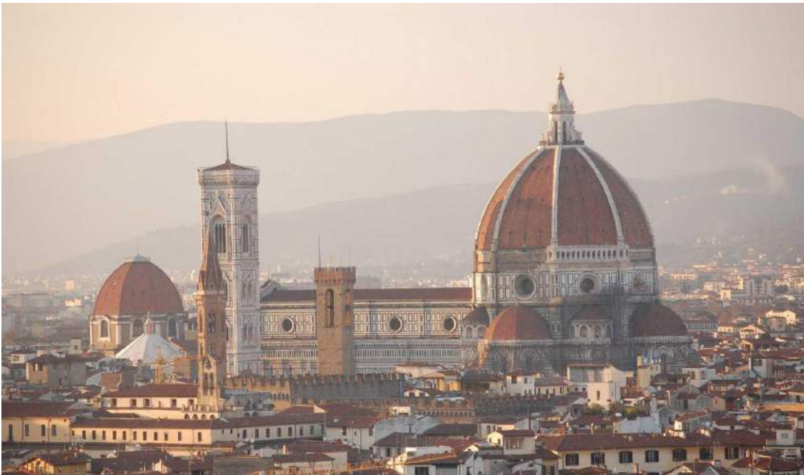
The massive dome of the cathedral dominates Florence's skyline.

Is it any wonder that of all the cities in northern Italy, Florence is unarguably the Birthplace of the Renaissance!