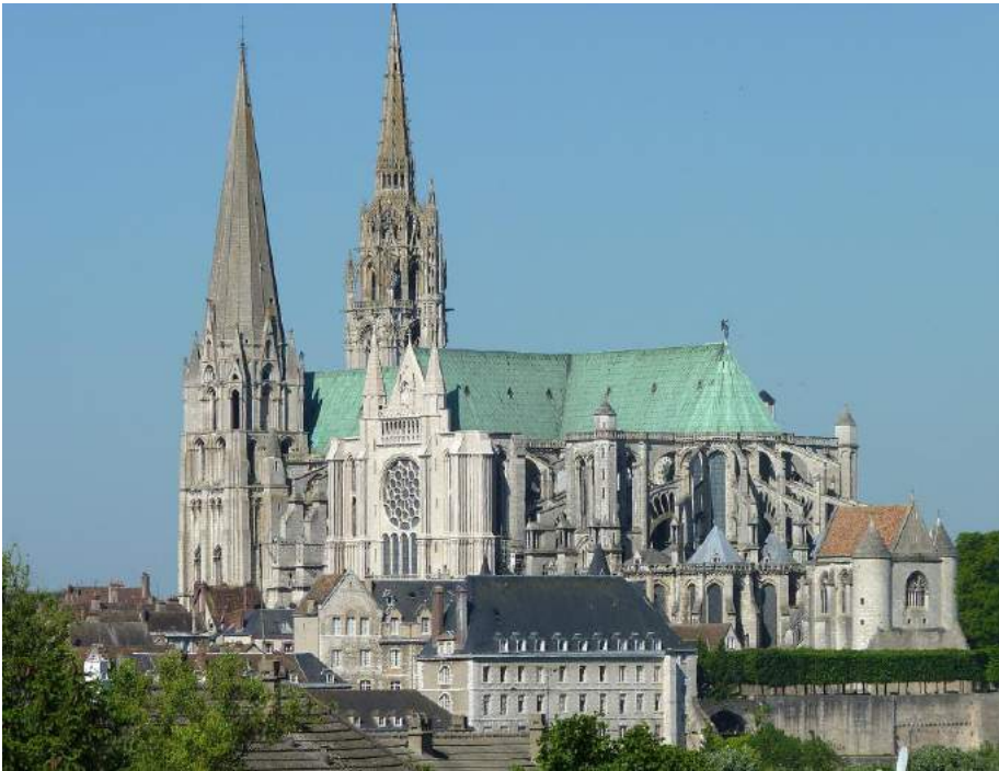
The splendor of medieval Gothic architecture: Chartres Cathedral in France

of St. Peter in Rome, was respected and feared by all in Christendom – kings and peasants alike. Beneath the pope, in hierarchical order, cardinals, bishops, and a multitude of priests, monks, and nuns, ensured that the population obeyed and paid. Everyone was subject to the 10% tithe (religious tax) for instance as well as countless fees for baptisms, weddings, funerals, etc. The Church provided great comfort to Europe’s population. It explained the origins and purpose of life; it provided the path to Heaven; it taught how to avoid eternal damnation; and on a practical level, it provided alms to the poor, and educational opportunities to the bright. The soaring Gothic cathedrals that dominated the skylines of most major towns were an ample testament to the religiosity of the age.