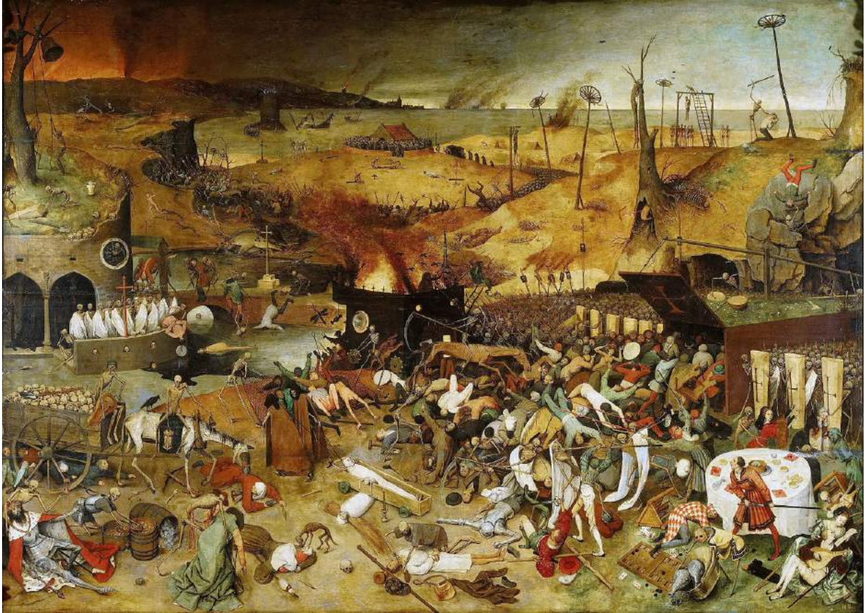
Bruegel, Pieter. The Triumph of Death . 1462. Museo Del Prado, Madrid, Spain. Archaeology and Arts . Web. 12 July 2015.

This painting depicts the macabre theme of death that became prevalent after the Black Death.