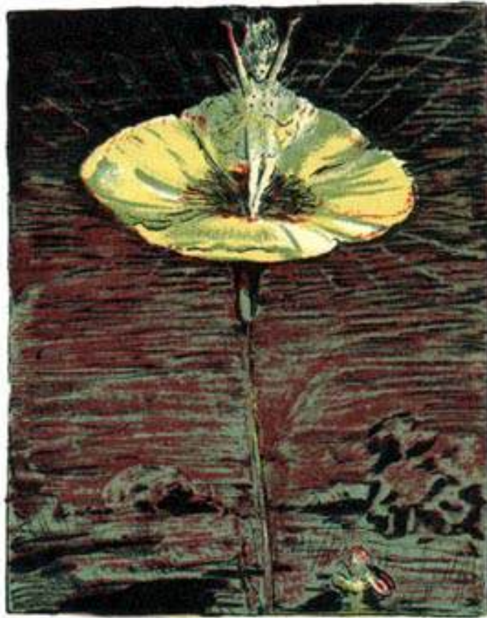
The Fairy Flower

"Little Rabbit," she said, "don't you know who I am?"