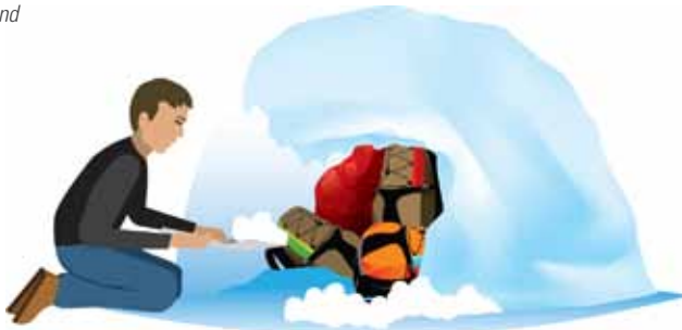
Making a snow mound

hours at least. In the meantime you are getting wet and cold in your cotton shirt and pants, and everyone else is just plain getting cold. Realistically, the snow mound or snow cave option, while it can provide the warmest shelter, will probably make you hypothermic once you stop digging and remain wet in your cotton clothing. You will burn up a lot of energy digging, which you would have been better using to keep warm and dry by some other means. So this option is the last resort, and even then, only if you are prepared for it and the snow is favourable.