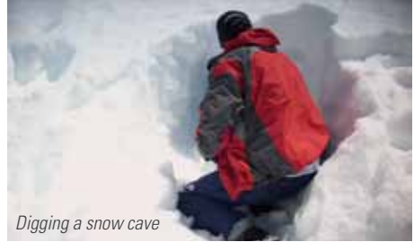
Digging a snow cave

The second shelter option is required if you have damaged the aircraft to such a