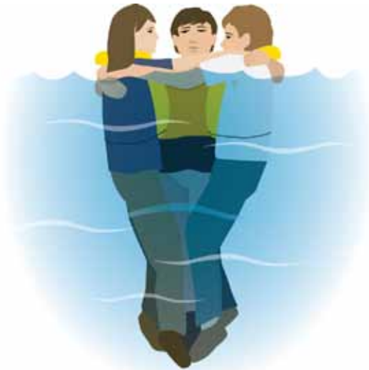
Huddle and hold

If you are on your own, then the technique is to huddle up with yourself, cross your legs and pull your knees up towards your chest. Keep your arms against your sides and folded in front of you. The big heat loss areas are your head, so keep it out of the water, your armpits, so keep your arms at your side, and your groin so keep your legs folded.