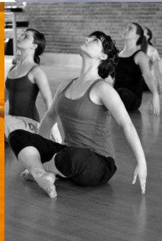
Martha Graham Technique – Contraction and Release