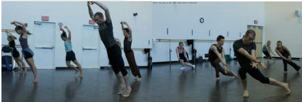
Fall and Recovery Technique