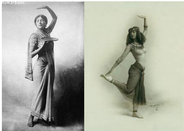
Ruth St. Denis

II. Ruth St. Denis turned to the dance styles of India, Egypt and Asia, as the basis for her compositions. She created dance that expressed the mysticism by the goddess’s image conveyed and full of dramatic elements. She founded Denishawn Company, the “cradle of American modern dance”, with her husband Ted Shawn. It increased the popularity of modern dance throughout the United State and nurtured the leaders of the second generation of modern dance like Martha Graham and Doris Humphrey.