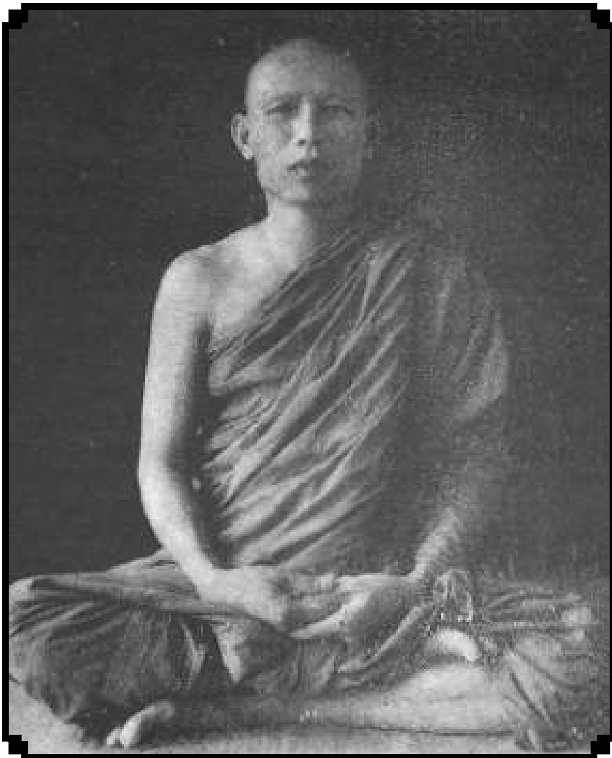
AJAAN LEE DHAMMADHARO