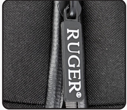
CUSTOM WATERPROOF ZIPPER