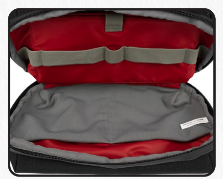
INTERIOR POCKETS AND HOLDERS