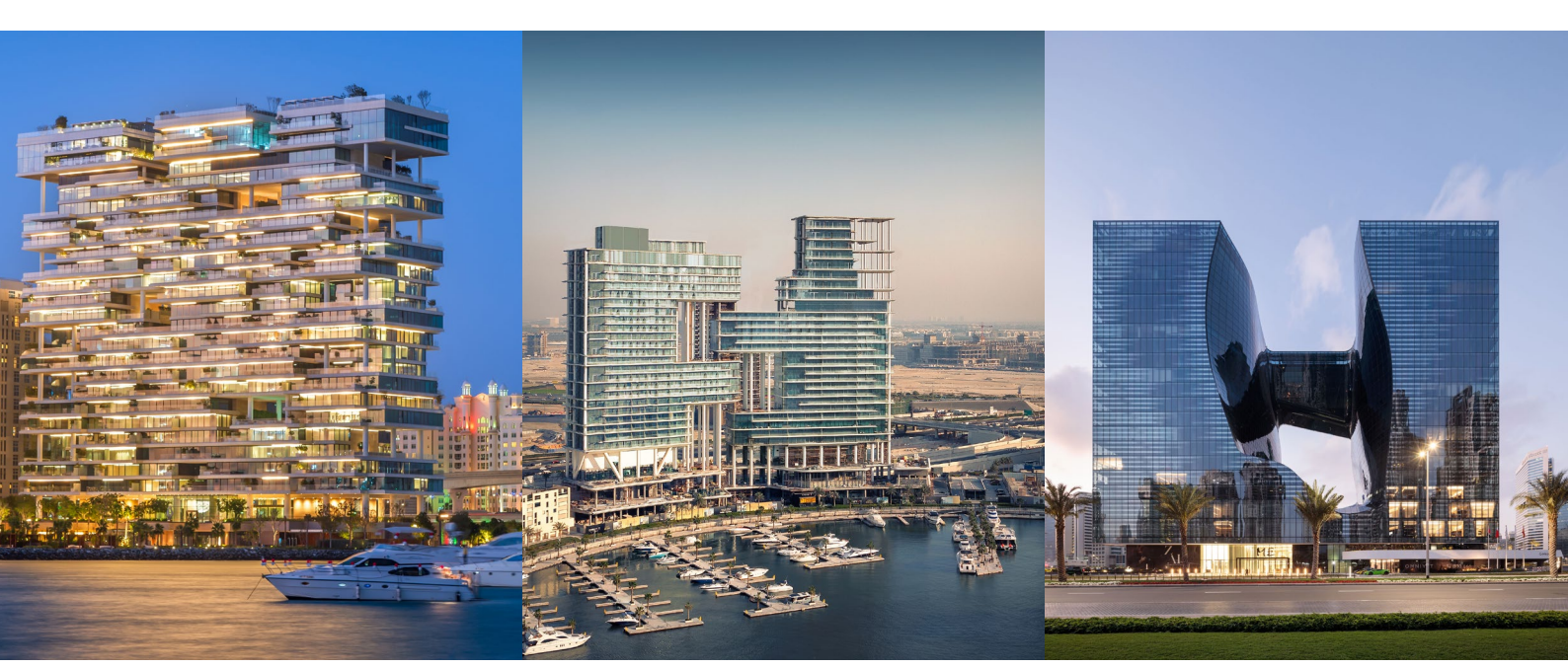
THE RESIDENCES, DORCHESTER COLLECTION, DUBAI

OMNIYAT's impressive portfolio, with a combined gross realisation of over AED 17 billion, includes stars such as The Opus by OMNIYAT, One at Palm Jumeirah, Dorchester Collection, Dubai and The Residences, Dorchester Collection, Dubai.