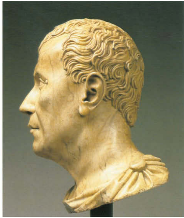
2 CONRAT MEIT German (active in France, Brabant, Mechelen, and Antwerp), 1480s?–1550/51 Head of a Man (possibly a portrait of Cicero), circa 1520 Alabaster 33 cm (13 in.) 96.SA.2

Born in Worms, Meit was in Wittenberg by 1511, working for the Saxon elector Friedrich the Wise, who also employed Albrecht Dürer and Lucas Cranach the Elder. Around 1512 the sculptor moved permanently from Germany, and in 1514 he became official court sculptor to Margaret of Austria (1480–1530), regent of the Netherlands, in Mechelen. In 1526, Meit began work on his first monumental undertaking, the tombs of Margaret, Philibert, and Philibert's mother, Margaret of Burgundy, in the Church of Saint Nicolas de Tolentin in Brou. These tombs, together with a signed alabaster statuette of Judith , provide a secure foundation for the assessment of Meit's style and the attribution of works to him.