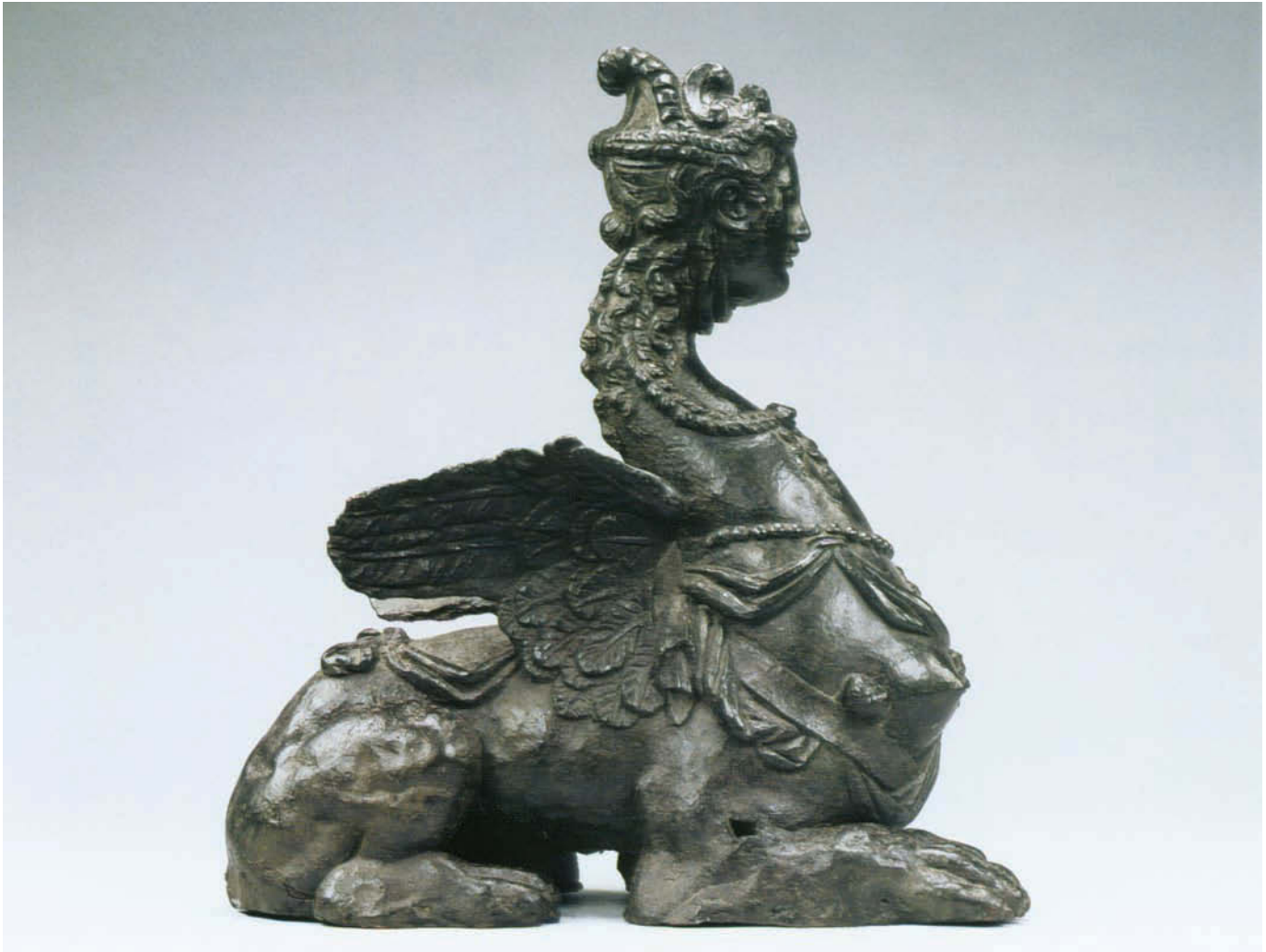
7 Sphinx Italian (Florence), circa 1560 Bronze 64 cm (25 3 / 16 in.) 85.SB.418.1

The sphinx is a creature of fable, composed of a woman's head and chest, a lion's body, and an eagle's wings. She is depicted crouching on all fours, with heavy-lidded eyes and her head pulled back—like a snake about to strike—over a long, bejeweled, curving neck that leads down to large projecting breasts proffered to an unsuspecting victim. The overall impression conveyed is of a cool, threatening sensuality. Her exotic allure, combined with the elaborate coiffure, sinuous forms, and fantastic imagery, is typical of much Florentine Mannerist art and finds close sculptural parallels in the work of Benvenuto Cellini and Vincenzo Danti.