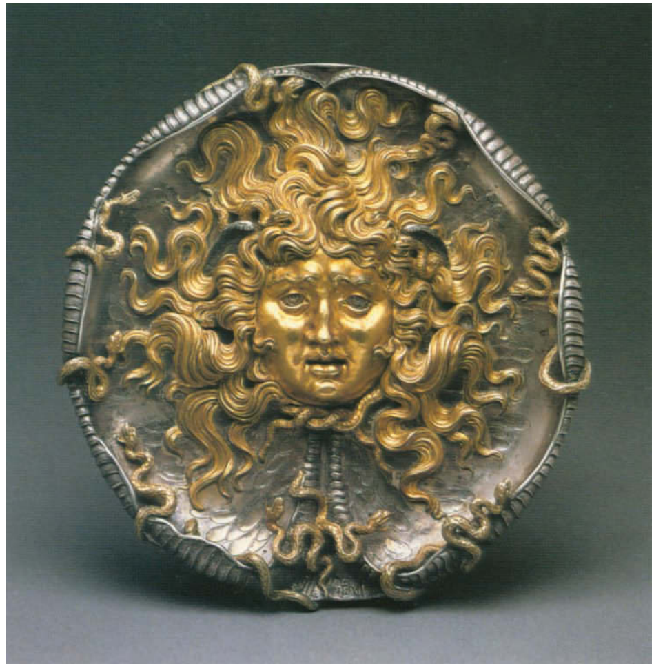
47 VINCENZO GEMITO Italian (Naples), 1852–1929 Medusa , 1911 Parcel-gilt silver Diameter: 23.5 cm (9¼ in.) Inscribed at the bottom center of the obverse: 1911, GEMITO 86.SE.528

In several respects Vincenzo Gemito's life is the stuff of which nineteenth-century novels were made. Abandoned at birth on the doorstep of a foundling home, the nameless infant was recorded in the customary fashion as Genito (literally "begotten" in Italian), which by a slip of the pen became the more poetically accurate Gemito ("wail" or "moan"). As a street urchin at the age of nine, he found work in the studio of a painter. In 1868, when he was only sixteen, he exhibited at the Protomotrice di Napoli, and his work was bought for the city. While working on two important state commissions, Gemito experienced a serious mental depression. In 1887 he was committed to a sanitarium, but he immediately ran away and returned home, where for about twenty years he remained hidden in a single room, secluded from the outside world, seeing only a few friends and working intermittently on subjects readily at hand (drawings of dead fish, for example, and portraits of his wife). In 1909–1910 he returned to the world. From this time until his death in 1929 he led a relatively normal life, continuing to draw and to sculpt in the vein he had established before his self-imposed withdrawal.