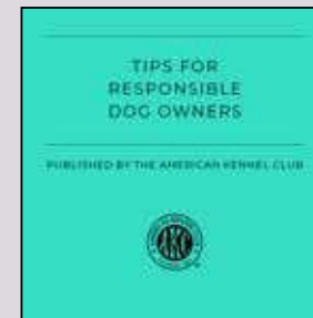
RESPONSIBLE DOG OWNER TIPS