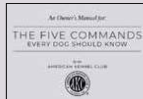
5 BASIC COMMANDS