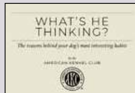
WHAT'S HE THINKING?