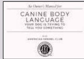
CANINE BODY LANGUAGE