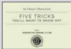
5 TRICKS TO SHOW OFF

We hope this information was valuable to you in helping your puppy live a long, healthy, happy life. Below, find additional books in our Owner's Manual series designed to strengthen the bond between you and your furry family member.