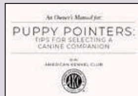
SELECTING A PUPPY