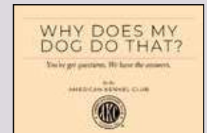
WHY DOES MY DOG DO THAT?