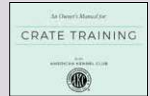
HOW TO CRATE TRAIN YOUR DOG