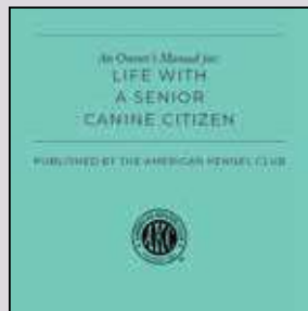
LIFE WITH A SENIOR DOG