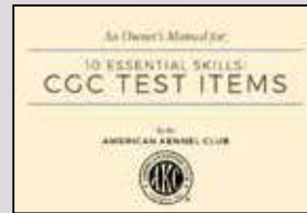
CANINE GOOD CITIZEN