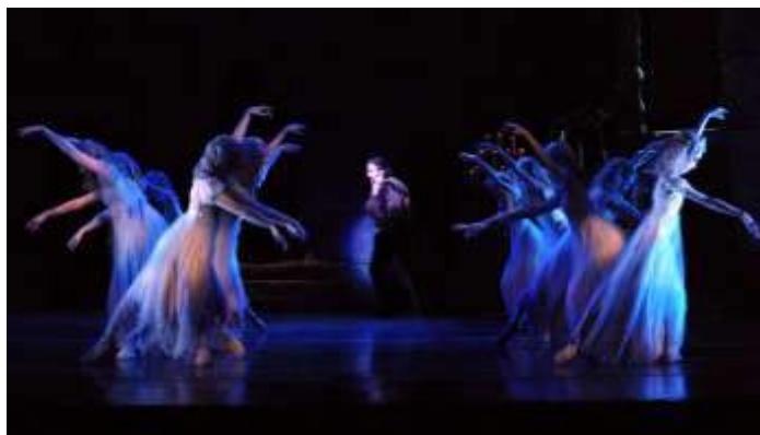
2011 production of Dracula.