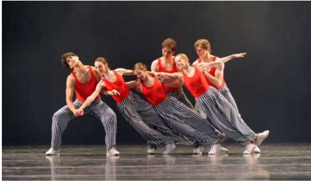
In the Upper Room , by Twyla Tharpe, 2010.

Plotless ballets have no storyline: rather they utilize the movement of the body and theatrical elements to interpret music, create an image, or to express or provoke emotion. George Balanchine was a prolific creator of plotless ballets.