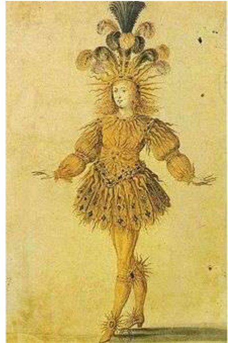
King Louis XIV in Ballet de la nuit , 1653 PD-US

By 1661 a dance academy had opened in Paris and in 1681 ballet moved from the courts to the stage. The French opera Le Triomphe de l'Amour incorporated ballet elements in its performance, creating a long-standing opera-ballet tradition in France. By the mid-1700s French ballet master Jean Georges Noverre rebelled against the artifice of opera-ballet, believing that ballet could stand on its own as an art form. His notions—that ballet should contain expressive, dramatic movement, and that movement should reveal the relationships between characters—introduced the ballet d'action , a dramatic style of ballet that conveys a narrative. Noverre's work is considered the precursor to the narrative ballets of the 19th century.