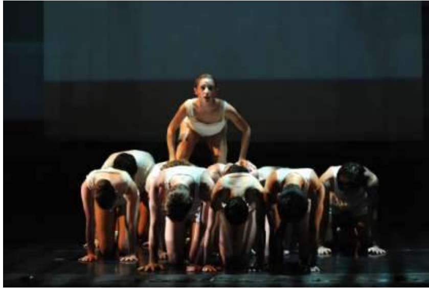
Light: The Holocaust and Humanity Project , by Stephen Mills, 2009

Ballet is an art form created by the movement of the human body. It is theatrical—performed on a stage to an audience utilizing costumes, scenic design and lighting. It can tell a story or express a thought or emotion. Ballet can be magical, exciting, provoking or disturbing.