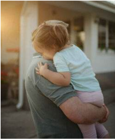
“Young child in the embrace of her grandfather, sunny day at garden” by shixart1985 is licensed under CC BY 2.0.

Anxiety disorders are very prevalent and in fact the most common disorder for someone to have. It can occur before someone does something outside of their comfort zone and or enter a life-changing event. For most people, this anxiety is temporary, but for others, it is a permanent fixture in life. This can encompass physical symptoms, subjective distress, avoidant behavior, and negative cognition. Women are most likely to suffer from an anxiety disorder.