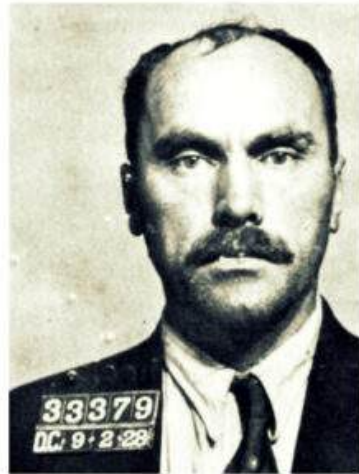
Charles "Carl" Panzram (June 28, 1891 – September 5, 1930) was an American serial killer, spree killer, mass murderer, rapist, child molester, arsonist, robber, thief, and burglar. Also a classic mesomorph.