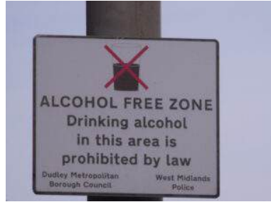
“Alcohol Free Zone – Drinking alcohol in this area is prohibited by law – sign on Trindle Road, Dudley”