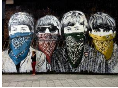
“Girl in Front of Beatles Mural” by James Jardine is licensed under CC BY-NC-ND 2.0.

In early America, The Salem Witch Trials were punishing men and women who were considered deviant by allegedly practicing witchcraft determined by religious zealots who felt themselves the judge, jury and executioner. The Boston Tea Party was considered deviant as it went against the government's laws.