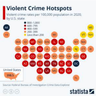
Violent Crime Hot Spots in 2020

discussed expectations and successes of a civilized society without deviant behaviors in the United States: