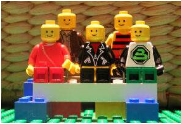
“Lego Family”

Human biology is the study of—well humans. This includes human development, our evolution, genetics, anthropology, and anatomy and physiology. This is a broad topic with multiple avenues we could travel. So, let's narrow things down a bit and focus on psychological biology of adults and how it connects to deviant behaviors.