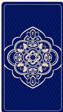
CARD DRAWN #3