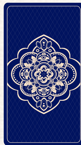
CARD DRAWN #2