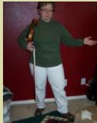
2: Reach out with your left hand and take a small left-ward step.