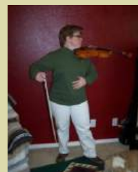
6: Tuck the violin under your chin.