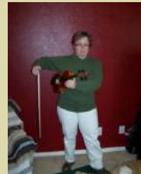
3: Grasp your violin by its shoulder.