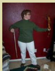
5: Turn your elbow and the scroll down.