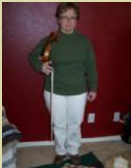
1: Face your audience with your left hand free.

Once you learn this right, it becomes habit pretty quickly, and the pay-off is huge! The photos below are a quick guide, but click here to view my video explaining a simple way to get from rest position to playing position. (the simple steps are last 5 minutes of the 12-minute video...sorry!) And here is a video showing a beginner’s bow hold , and another showing an advanced bow hold . The beginner’s bow hold helps develop a nice, circular thumb and an open “ whale mouth ”. Children benefit the most from the beginner’s bow hold, because they are less coordinated. Adults may dive right in and learn the advanced bow hold, as long as their thumb is able to stay rounded.