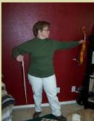
4: Extend the arm, F-holes facing away from you.