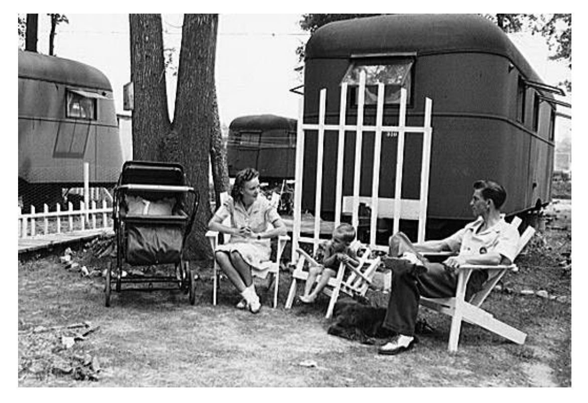
A worker's family is shown behind their trailer in a Farm Security Administration housing project for Glenn L. Martin aircraft workers, Middle River, Maryland. Possible date, August 1943.