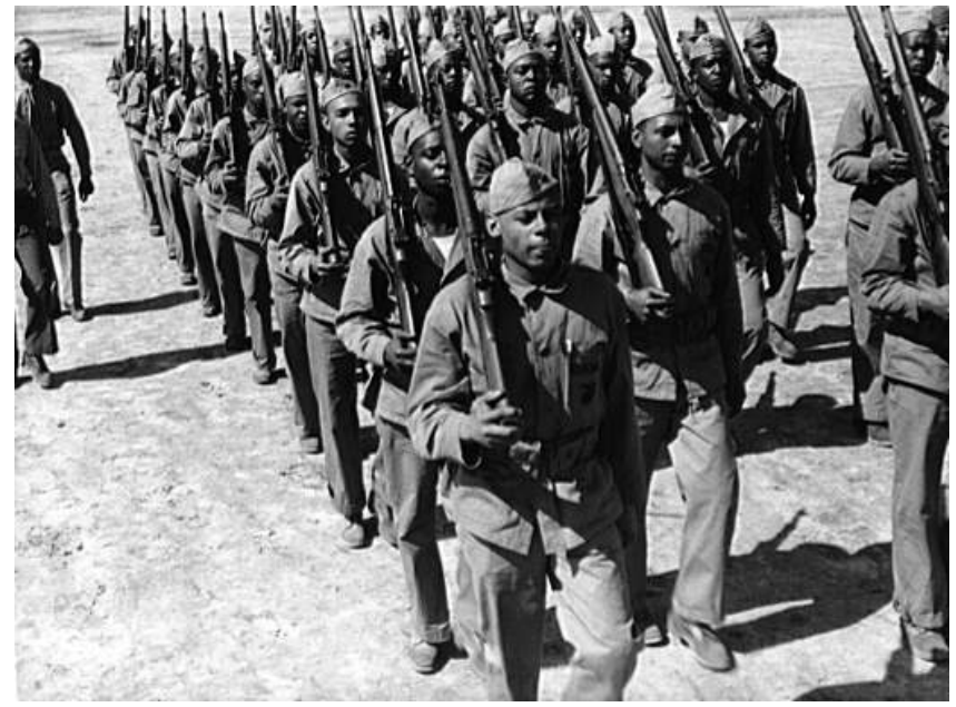
The U.S. Marine Corps trained its African American volunteers at Montford Point, North Carolina. March 1943.

Ultimately about one million African Americans served in the World War II military. Blacks were eventually accepted into the Marine Corps and Army Air Corps. As the war proceeded, African Americans received a wider range of duties, including combat, and some served in integrated units by 1944 and 1945. Sometimes serious racial tensions and disturbances occurred on or near military training bases, many of them located in the segregated South. The wartime experience, including African American protest against discriminatory treatment, began the process that would end with the desegregation of the armed forces in 1948.<sup>33</sup>