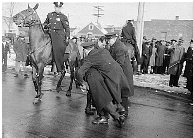
Police arrest an African American during the riot at the Sojourner Truth homes caused by white neighbors' attempts to prevent black tenants from moving in. February 1942.

The racial beatings, shootings, burning, and looting in Detroit in June 1943 symbolized the rawness of American race relations. Just a spark was necessary to ignite hostilities, and not surprisingly, that spark flared on a hot, sweltering Sunday in June, when whites started to stone a black boy who had mistakenly drifted into the white swimming area in Belle Isle Park, an island in the Detroit River. Quickly rumors of murderous attacks by each race on the other spread throughout the city; thousands of Detroiters poured into the streets bent on vengeance. Bands of whites attacked innocent black passengers on streetcars and buses, while African Americans