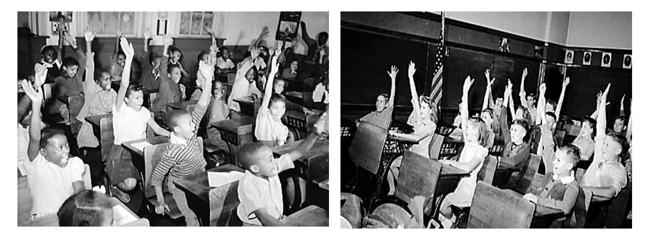
Office of War Information photographs taken inside a white school and a black school illustrate children volunteering to collect scrap for the war effort. Both photographs bear the identical caption: "... Everyone in this Roanoke, Virginia class wants to be one of the thirty-million children banding together throughout the United States to form America's junior army..." October 1942.

America's children and youth made important contributions to the war effort. They saved their nickels and dimes to buy War Bonds, and they pulled wagons from house-to-house collecting old newspapers, rubber tires, and tin cans. "I became fiercely patriotic," recalled a Nebraska farm girl, "and participated in every war effort that I could." Thousands of young people went to work. In 1940, for example, 900,000 Americans between the ages of fourteen and eighteen were employed. By the spring of 1944 their number had climbed to 3 million—one-third of their age group. Teenagers were dropping out of high school in record numbers, and some observers believed that the most pressing social problem afflicting young people was not juvenile delinquency but failure to finish school. High-school enrollments hit new lows during the war, which prompted a back-to-school drive in 1944.<sup>73</sup>