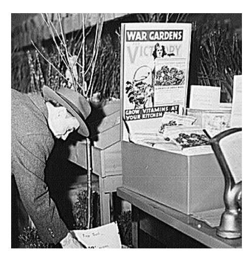
Citizen buys topsoil to improve a victory garden. May 1943. Library of Congress, Prints & Photographs Division, FSA/OWI Collection [LC-USW3-028105-D].

As part of the campaign to find or produce enough rubber, Roosevelt in June 1942 said that Americans should collect "old tires, old rubber raincoats, old garden hoses, rubber shoes, bathing caps, gloves—whatever you have that is made of rubber."<sup>57</sup> Within a month, people had contributed 450,000 tons of scrap rubber in a multitude of forms. A variety of other scrap drives involved civilians in the war efforts and yielded mountains of materials. Boy Scouts went door-to-door, collecting paper for recycling to make up for the shortage of wood pulp caused by the demand for lumber, and the General Eisenhower Waste Paper Campaign of 1945 gave special awards to Scouts collecting 1,000 pounds of paper.