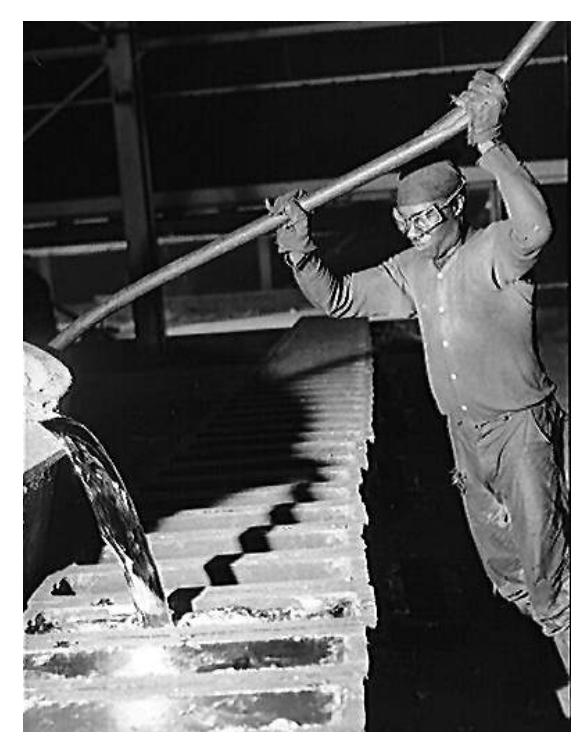
A workman pours aluminum into molds at the Reynolds Metal Company in Sheffield, Alabama. Possibly dates to August 1942.

But if wartime conditions made African American advancement possible, forceful and well-organized protests of black workers were necessary to persuade unions and the federal government to root out discrimination in jobs, housing, and politics. The first, and in many ways the most dramatic, protest movement began in 1940, when A. Philip Randolph and other leaders of the Brotherhood of Sleeping Car Porters decided that only a show of strength would win African Americans access to good jobs