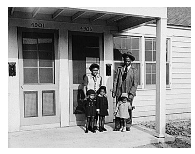
An African American family poses in front of the Sojourner Truth homes in Detroit, Michigan. February 1942.

The nearly 50,000 African Americans who migrated to Detroit, the nation's leading industrial city, met constant discrimination and frustration. They had difficulty in getting hired for the newly created war jobs, in getting promoted, and in finding decent housing. Most of the city's blacks were forced to crowd together in Paradise Valley, a black slum, where rents were high, housing substandard, and recreational facilities almost impossible to find. Recent Southern white migrants and local ethnic groups, particularly Polish Americans and Irish Americans, most of whom were themselves living in overcrowded, overpriced apartments, resented the black newcomers, who, they believed, were causing the rapid deterioration of "their" city and did not deserve priority in federal housing projects. Throwing bricks, burning crosses, overturning moving vans, Polish Americans protested violently when a federally-financed housing project being built in "their" neighborhood was designated for African American defense workers in early 1942. Only the presence of hundreds of state troops with fixed bayonets allowed black tenants to move into the spaces assigned to them in the Sojourner Truth Housing Project—named for the former slave and famous abolitionist.<sup>34</sup>