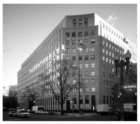
Lafayette Building.

This building, completed in 1940, was the headquarters of the Reconstruction Finance Corporation (RFC), which played an important role in the industrial expansion of World War II. Established as a Depression-relief agency in 1932 and given greatly expanded power, flexibility, and resources in 1940, the RFC, usually working through one of its defense-related subsidiaries, financed over one-third of the $25 billion invested in new industrial plants during the war. The building is also associated with Jesse Jones, who maintained his control over the powerful RFC even after being promoted to other posts in the administration. A "rugged product of Texas capitalism," Jones's close association with the