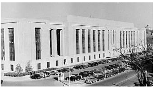
New Social Security Building in Washington, D.C. January 1942. Library of Congress, Prints & Photographs Division, FSA/OWI Collection [LC-USE6-D-002115].

labor, but denied authority over the draft and military production decisions; and the Office of War Information, which worked closely with the entertainment industry and private advertising agencies to maintain morale and support for the war, both at home and abroad, but was criticized for using its powers for partisan propaganda purposes. Recommendation: This property should be evaluated for possible NHL designation.