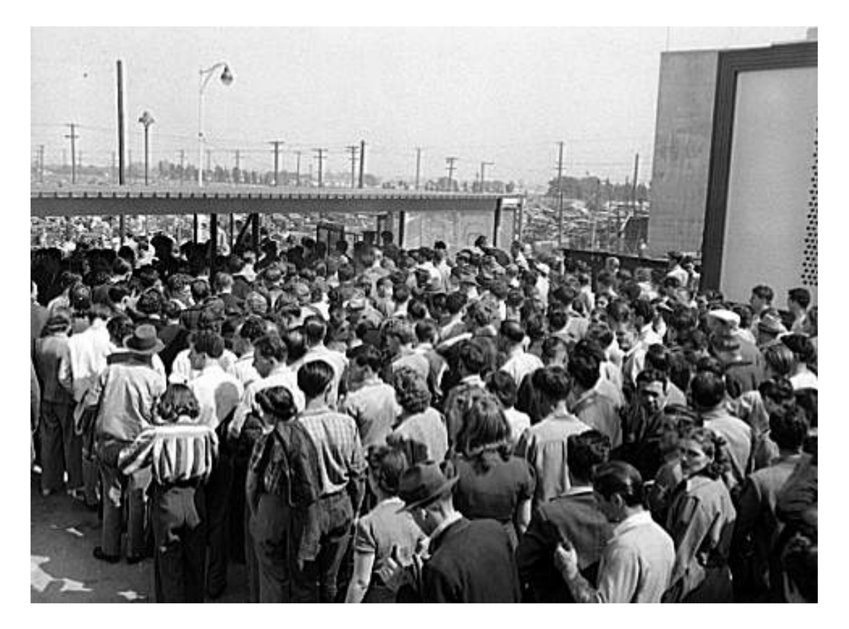
Workers lined up for car pooling at the Lockheed Vega aircraft plant in Burbank, California. June 1942. Library of Congress, Prints & Photographs Division, FSA/OWI Collection [LC-USE6-D-004527].