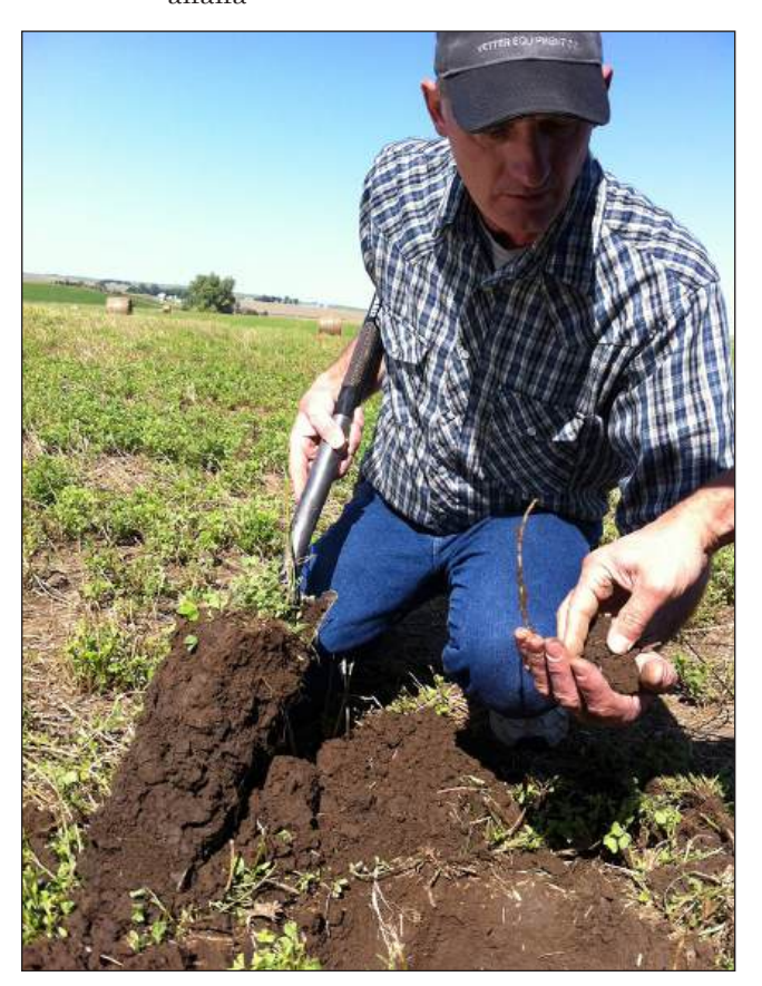
Figure 1 Examining organically managing soil under alfalfa

When crops need additional nutrients, organic producers choose plant, animal, and natural mineral-based fertilizers, most of which release nutrients gradually through the action of soil organisms. Synthetic fertilizers are prohibited in organic production systems.