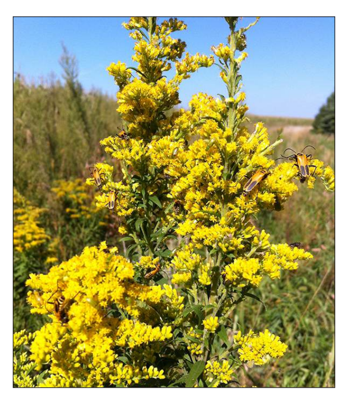
Figure 8 Plants in a buffer area attracting beneficial goldenrod soldier beetles

Protecting Riparian Areas: Farmland Management Strategies (ATTRA) <a href="https://attra.ncat.org/attra-pub/summaries/summary.php?pub=115">https://attra.ncat.org/attra-pub/summaries/summary.php?pub=115</a>. This publication is designed to help farmers, watershed managers, and environmentalists understand what healthy riparian areas look like, how they operate, and why they are important for the environment and society. It also discusses the costs and benefits of riparian management, and how watershed residents can work together to protect this vital resource.