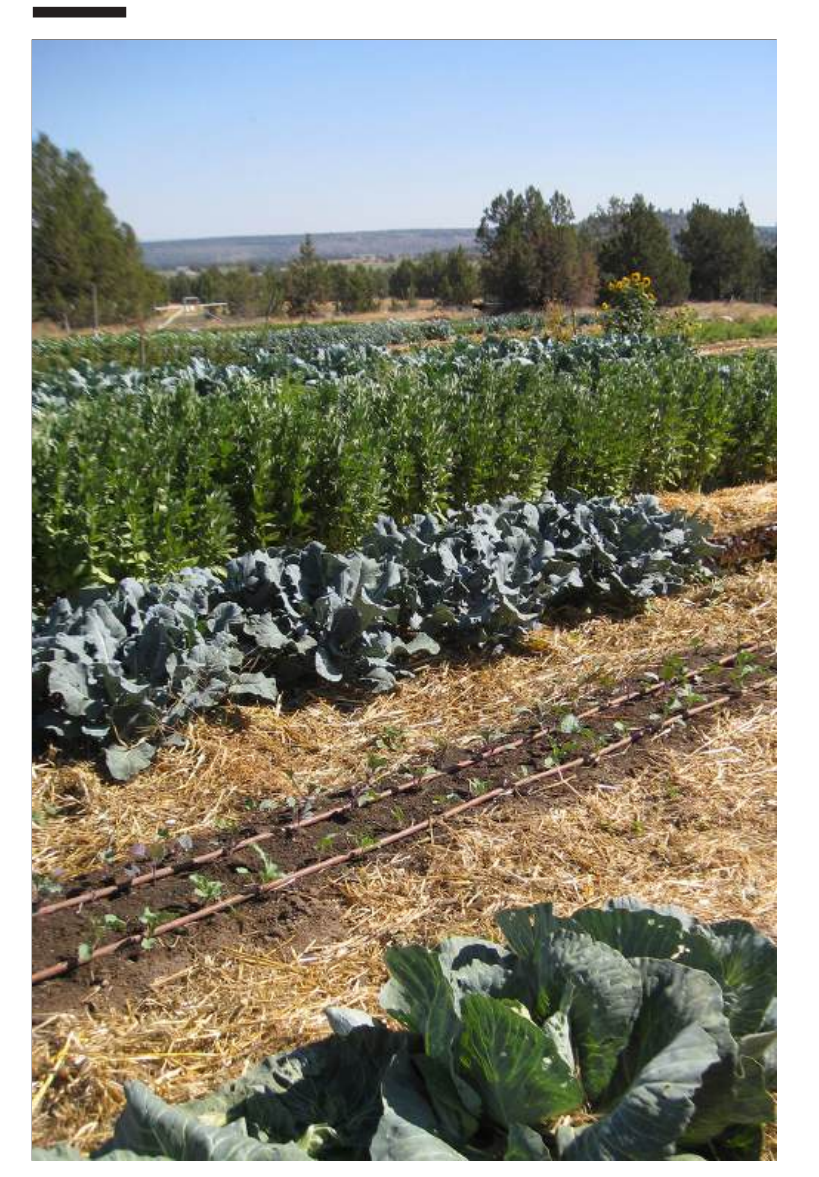
Figure 5 Diverse mixture of vegetable crops on an organic farm

http://www.extension.org/pages/18634/use-of-tillage-in-organic-farming-systems:-the-basics. This article describes the benefits and drawbacks of different forms of tillage and considerations when making decisions about tillage and tillage implements. Conservation tillage and no-till are also discussed briefly.