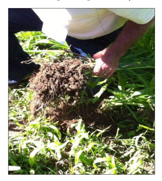
Figure 3 Roots and soil under organically managed sudan grass cover crop

State-specific versions of this guide are being developed for certain States; final versions will be available here: <a href="http://www.nrcs.usda.gov/wps/portal/nrcs/main/national/landuse/crops/organic/">http://www.nrcs.usda.gov/wps/portal/nrcs/main/national/landuse/crops/organic/</a>. This publication discusses CPS 590 as a tool for meeting the USDA organic regulations' nutrient management requirements and minimizing environmental risks from applied N and P. It covers major and minor nutrients, and how to estimate N release from cover crops, past organic inputs, and soil organic matter.