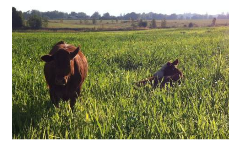
Figure 9 Cows in sudan grass on an organic farm

stock; the USDA organic pasture rule; organic soil and weed management for pasture and hayland; and grazing for parasite management.