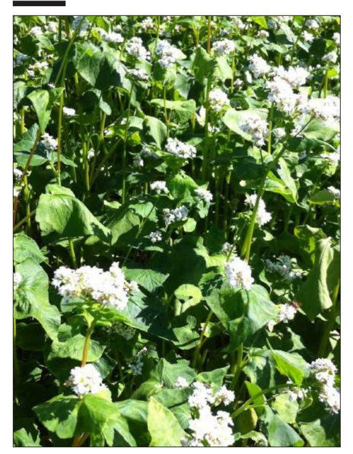
Figure 4 Organically managed buckwheat cover crop.

Cover Cropping in Organic Farming Systems (eOrganic)