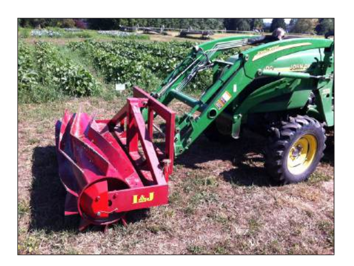
Figure 6 Roller crimper

other key NRCS practices that have primary resource protection benefits can also offer significant benefits to organic producers.