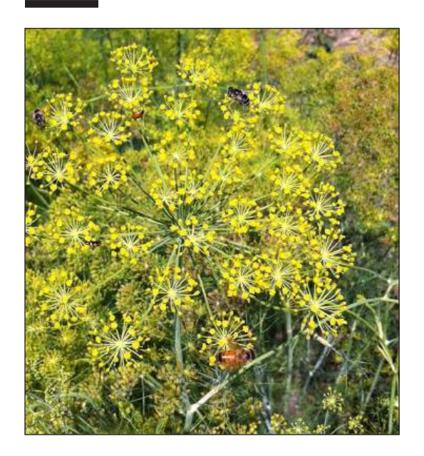
Figure 7 Flowers from dill

manual covers planning based on knowledge of pest and beneficial life cycles, cropping system design, sanitation and other preventive cultural practices, and physical, mechanical, biological, and chemical controls.