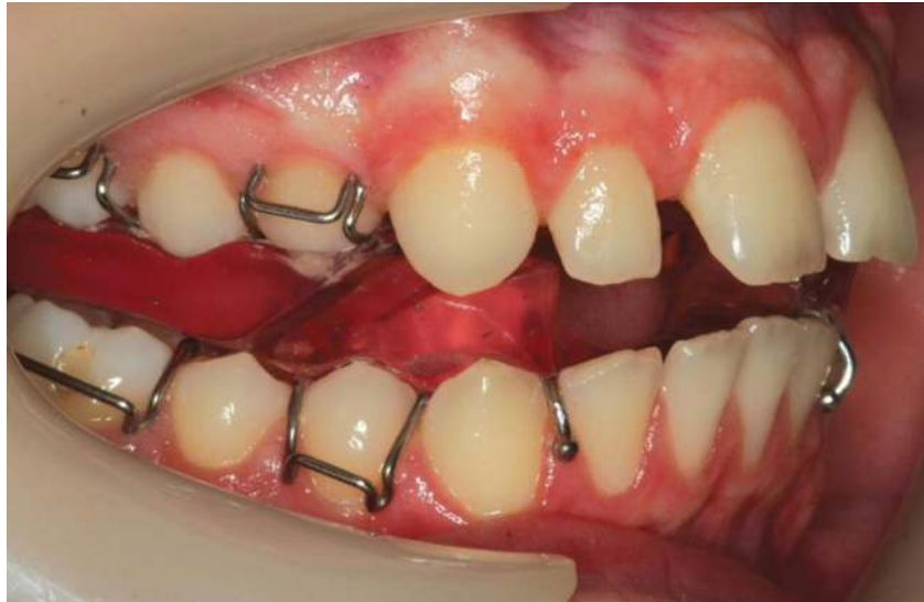
Figure 1.5: Twin block appliance