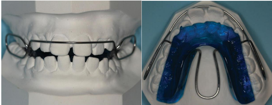
Figure 1.2: Bionator

Wilhelm Balters has developed activators of reduced bulk, known as bionators (Figure 1.2). The upper and lower components of bionator were connected by a wire, facilitating incremental activation.