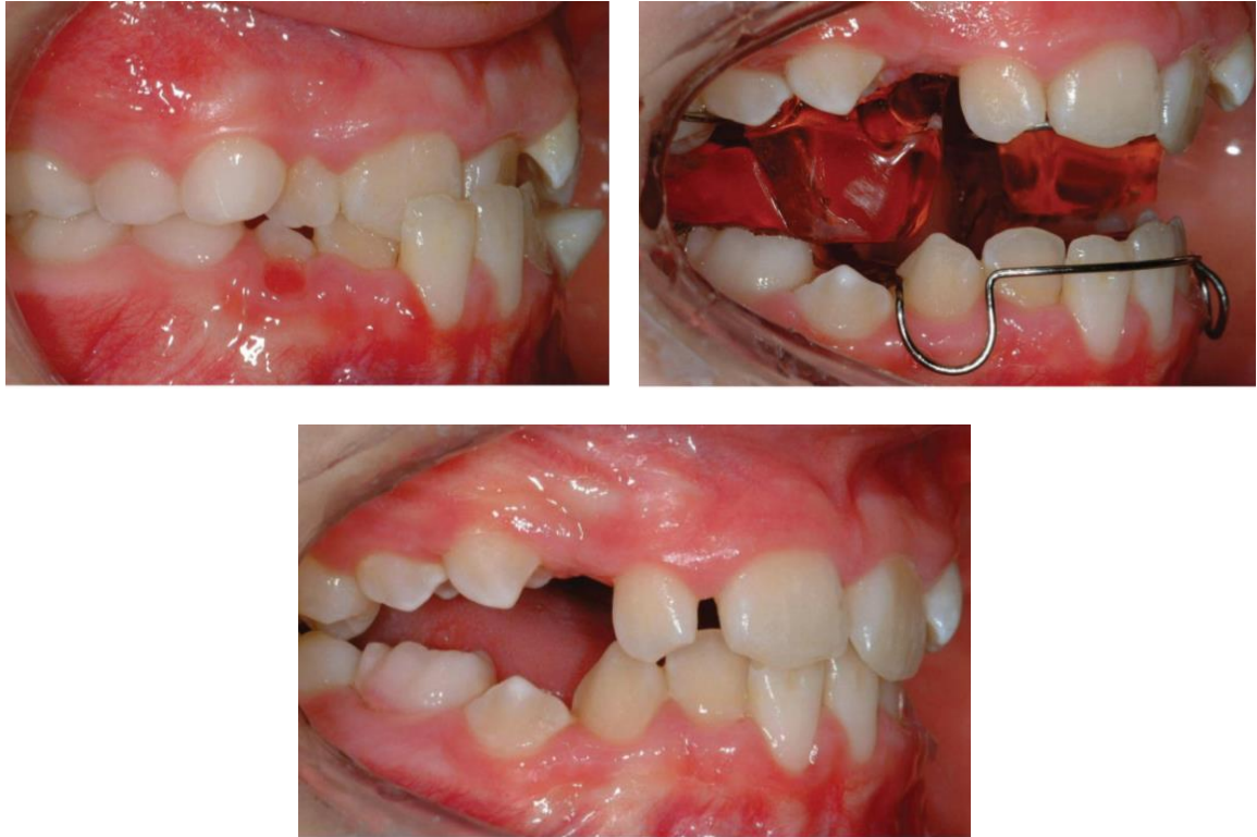
Figure 1.11: Reverse Twin Block appliance

concept. It also tends to be robust and well tolerated and can be worn in function without precluding speech or eating. It also has a very potent and efficient Class II effect, resulting in significant dento-alveolar results. Clark also described a version of the appliance for Class III correction, the basic premise of which is reversing the blocks so that the lower block occludes distal to the upper block.