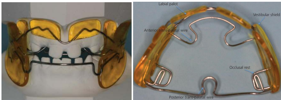
Figure 1.10: Frankel functional regulator 3

This is probably the most easily recognized and commonly used functional appliance for Class III correction. It is a soft tissue–borne appliance that consists of a wire framework to which are attached acrylic pads and shields designed to displace the soft tissues and muscles that restrict maxillary development. The vestibular shields in the FR3 appliance (Figure 1.10), as with the FR2, are positioned buccally, extending from the depth of the sulci to displace the force of the buccinators and the perioral muscles away from the dentition. The labial pads are situated in the upper labial vestibule above the teeth and extended to remove the force of the upper lip from the maxilla.