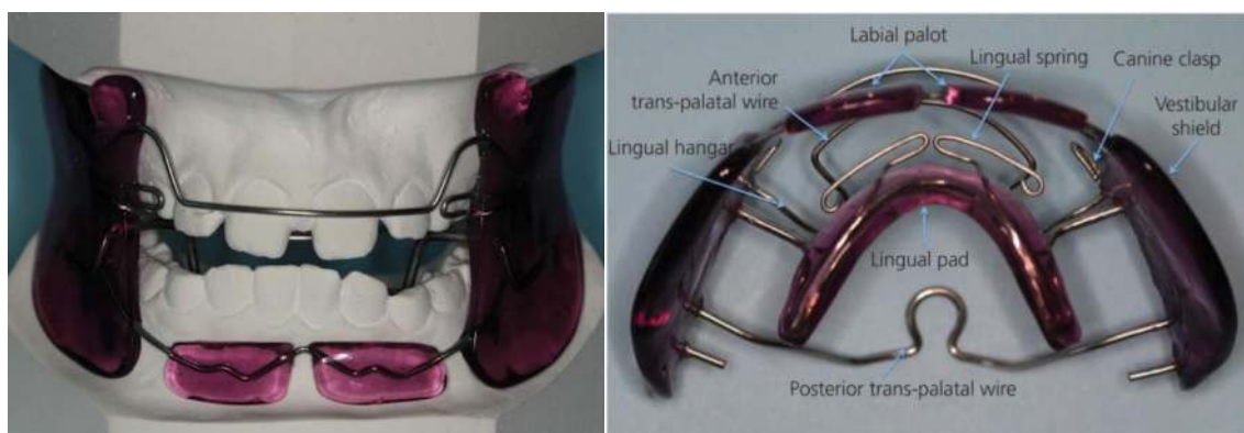
Figure 1.3: Frankel functional regulator 2

It was developed by Dr. Rolf Fränkel. He exhibited records of patients achieving major occlusal changes and improvement of facial appearance with the use of a group of appliances that are referred to as functional regulators (FR). The first version of this appliance, FR1, was used in Class II malocclusion with mal-aligned teeth; the FR2 was used in patients with a large overjet or deep overbite; the FR3 for the correction of Class III malocclusion; and the FR4 for the correction of anterior open bite. The FR2 (Figure 1.3) had vestibular shields to remove the influence of the buccal musculature on the dentition, allowing unopposed expansion due to the position and activity of the tongue. Moreover, by incorporating buccal shields, Fränkel believed that more room was given to the tongue to allow tongue exercises to be undertaken.