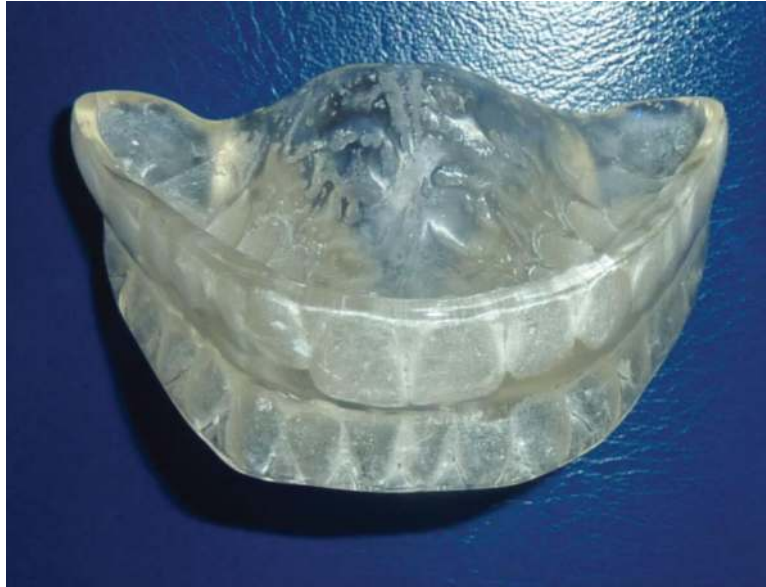
Figure 1.4: Monoblock appliance

It was developed by Pierre Robin in 1902. This mono-block appliance (Figure 1.4) was a single vulcanite bite jumping appliance which was used to position the mandible forward in patients with Class II malocclusion due to mandibular deficiency.