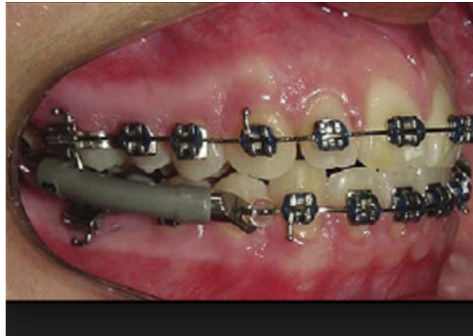
Figure 1.7: Jasper Jumper

It was developed in 1987 by J.J. Jasper and was popularized thereafter. It was the first flexible fixed functional appliance (Figure 1.7) to apply a distal and intrusive force to the maxillary molars along with a mesial and intrusive force on the lower incisors. It consists of vinyl-coated springs attached to the maxillary molar headgear tubes and attached either directly to the lower arch wire just distal to the canines, or to a sectional bypass wire from an auxiliary tub on the lower molar to just distal to the lower canine.