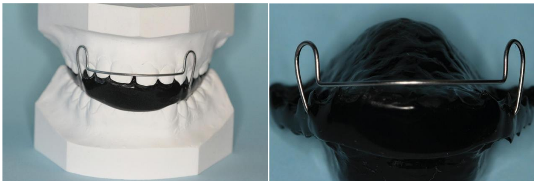
Figure 1.1: Activator

This removable appliance was developed by Andresen in 1908 and subsequently popularized as the Andresen–Häupl appliance (Figure 1.1). The original Andresen activator was rigid, tooth-borne and loosely fitting. It was a bulky appliance, with acrylic blocks covering the palate and both arches. Also, it was constructed to hold the mandible in a protrusive position, or to cause the mandible to occlude in a protrusive position.