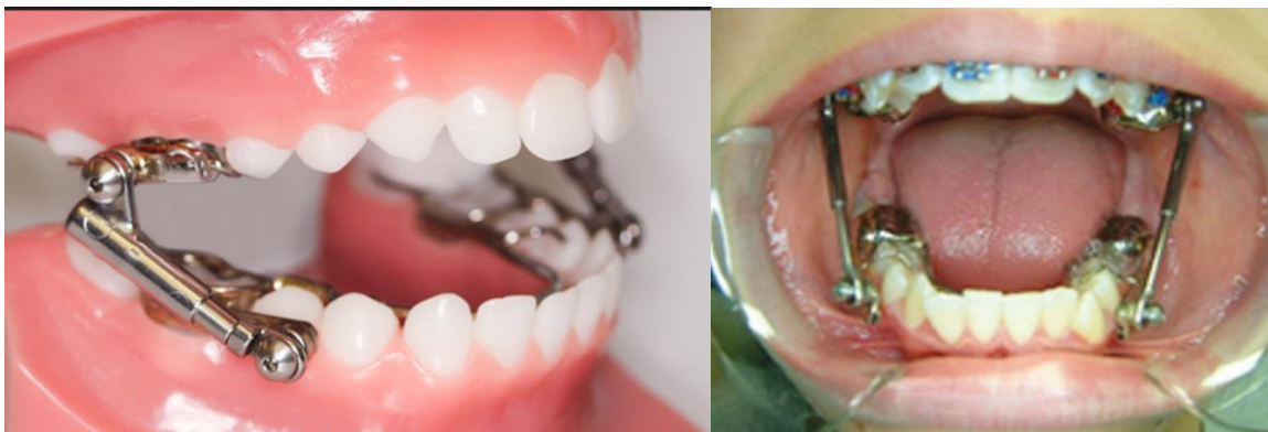
Figure 1.6: Herbst appliance

It is the first fixed functional appliance developed by Emil Herbst in 1909. It was later popularized by Pancherz (1979). It consists of a bilateral telescopic mechanism (Figure 1.6) that maintain the mandible in a protruded position. The Herbst appliance can be banded, cast, and acrylic splint or cantilever bite jumper.