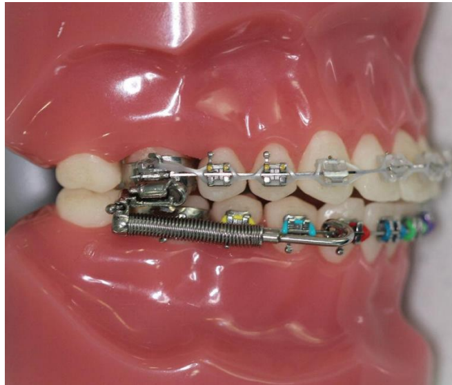
Figure 1.9: Forsus FRD (fatigue resistant device)

The original Forsus was developed by Bill Vogt in 2001 and was attached to the maxillary molar tubes and lower arch wire, similar to the Jasper Jumper but consisting of a Nitinol flat spring or ribbon. The later design of the Forsus FRD (fatigue resistant device) consists of an inter-maxillary push spring attached to the maxillary molar headgear tube and a push rod attached distal to the lower canine or first premolar, in conjunction with fixed appliance (Figure 1.9).