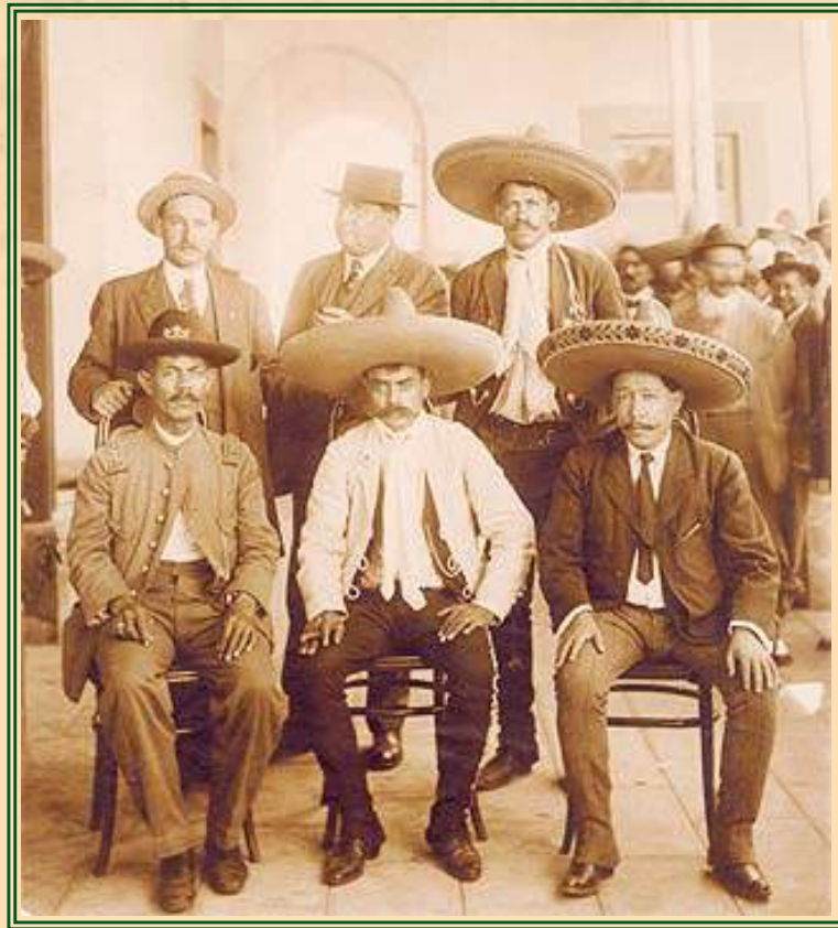
Emiliano Zapata, the caudillo of the South.

Mexico: because the middle class had grown stronger, the possibility existed for the exercise of democracy. Other writers, on the other hand, were skeptical on this point. One of them, evolutionist Andrés Molina Enríquez, the author of what was undoubtedly the best diagnosis of the situation, warned that democracy was still far off. In his book Los grandes problemas nacionales (The Great National Problems), published in 1909, he took into account factors like the interaction among ethnic-social groups with different forms of land ownership. From this analysis, he was able to come to important conclusions foreseeing that in the face of kind of diversity that existed, it was impossible to evolve. A homogeneous society, by contrast, could have a democratic government, but before that, it would evolve from a personal dictatorship into a party dictatorship.