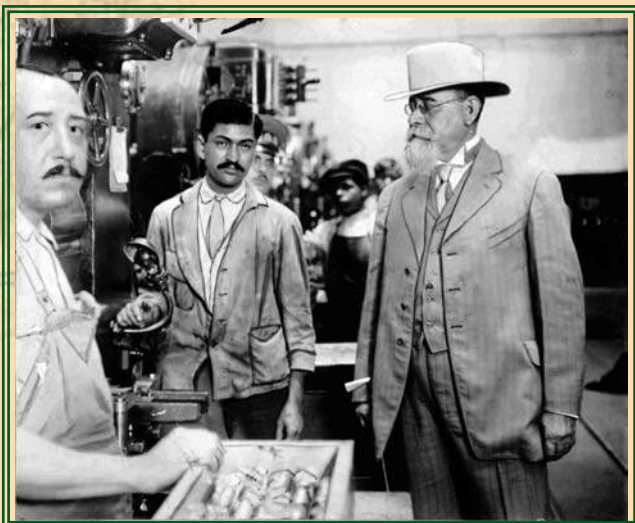
Venustiano Carranza (right).

In 1913 Carranza gave the movement a national dimension by sending contingents to the South and Southeast and occupying ports and customs offices, allowing him to raise money for his movement.