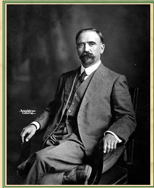
Francisco I. Madero, who overthrew Porfirio Díaz.

A few days later, the Zapatistas’ impatience manifested itself through the Plan of Ayala, which urged the restitution of the towns’ collective ejido farms. New anti-Madero outbreaks