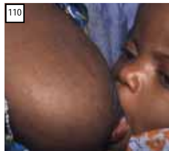
Fig. 109 & 110. Hemangioma of the lower lip. The baby can feed well, there is no indication for treatment.