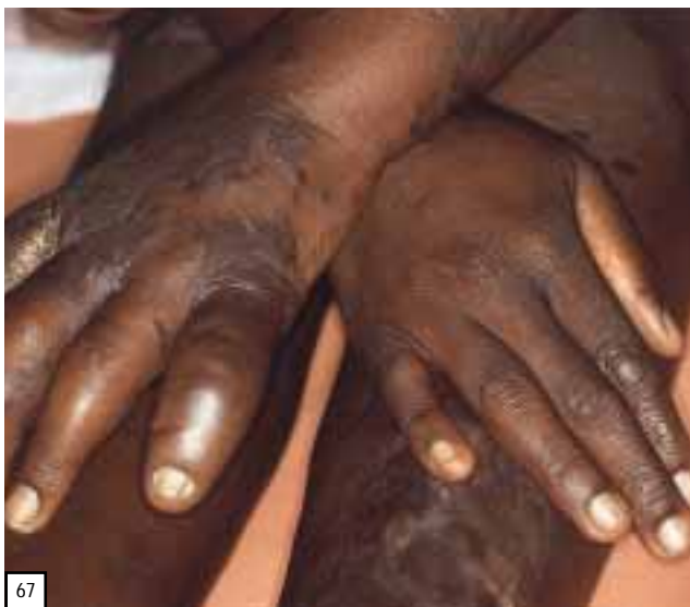
Fig. 67. Multiple plaques of Kaposi's sarcoma in a 23 year old woman.