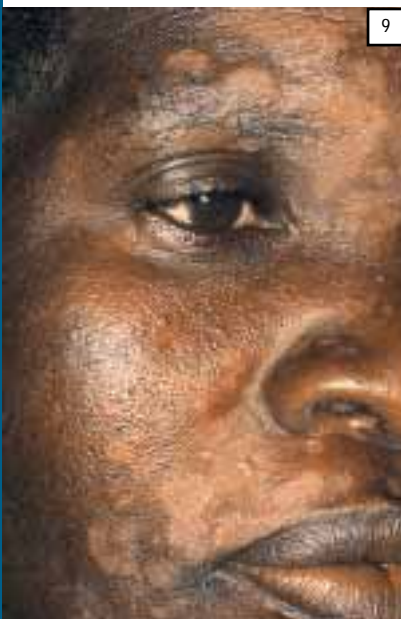
Fig. 9. Typical greasy scales of seborrheic eczema in the face.