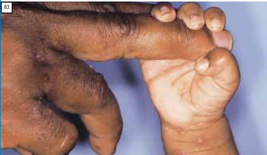
Fig. 83. Papules and pustules of scabies in mother and child.