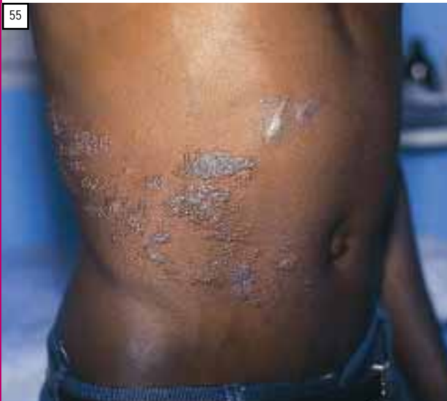
Fig. 55. Herpes Zoster in more than one dermatome in a 30 year old HIV positive man.