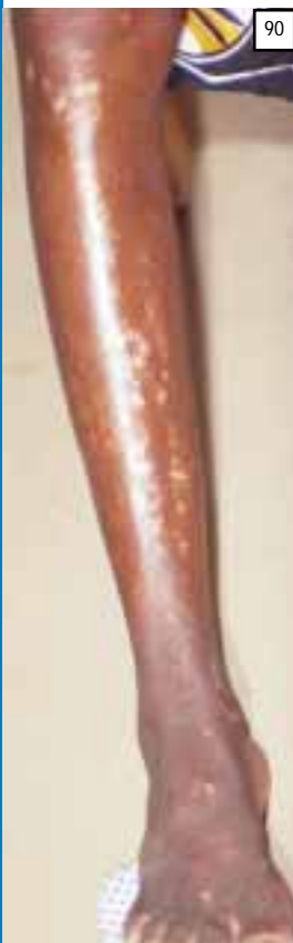
Fig. 91. Onchonodules.