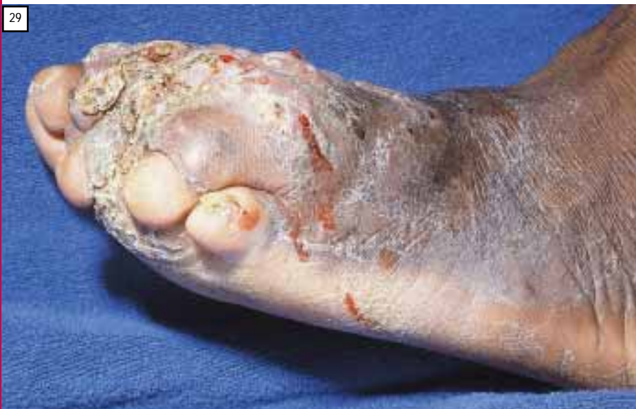
Fig.29 A 45 year old man with slowly progressive deformity since 13 years.