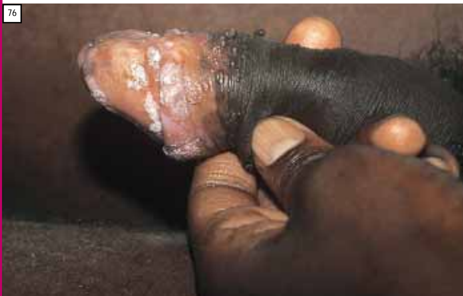
Fig. 76. Condylomata acuminata on glans penis and foreskin of a 30 year old man.