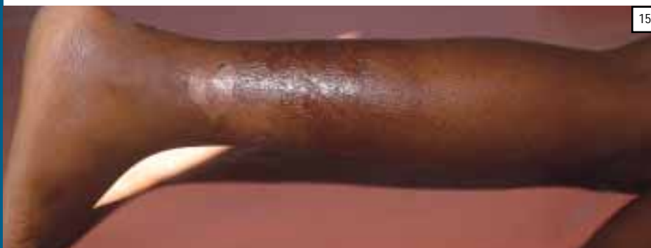
Fig. 15. Allergic contact eczema caused by betadine dressings.

Some examples of contact allergens are: occupational (dyes, preservatives, rubber, bleach, soap, floor wax, nickel, oils, diesel, fertilisers, pesticides, cement), environmental (plants, spices), medical (betadine, lanolin, local anaesthetics, menthol, camphor), cosmetic (perfumes, nail polish, hair-chemicals), clothes or jewellery (chromate, nickel, rubber, dyes). This list is not complete. Allergy testing may be done by a dermatologist or allergologist.