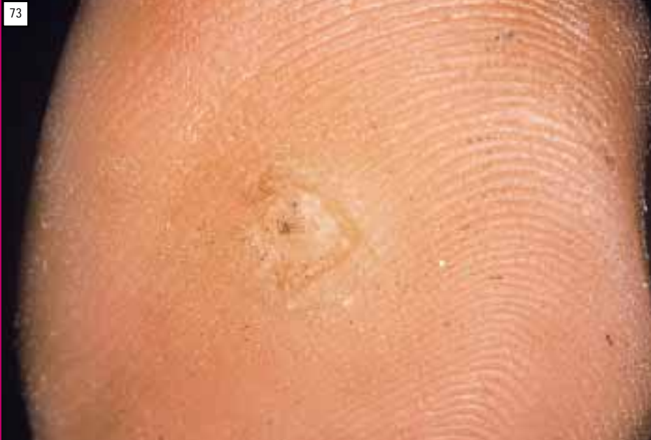
Fig. 73. Plantar wart.