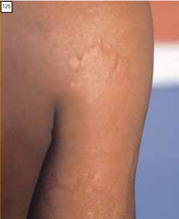
Fig. 126. Papular urticaria in an infant.