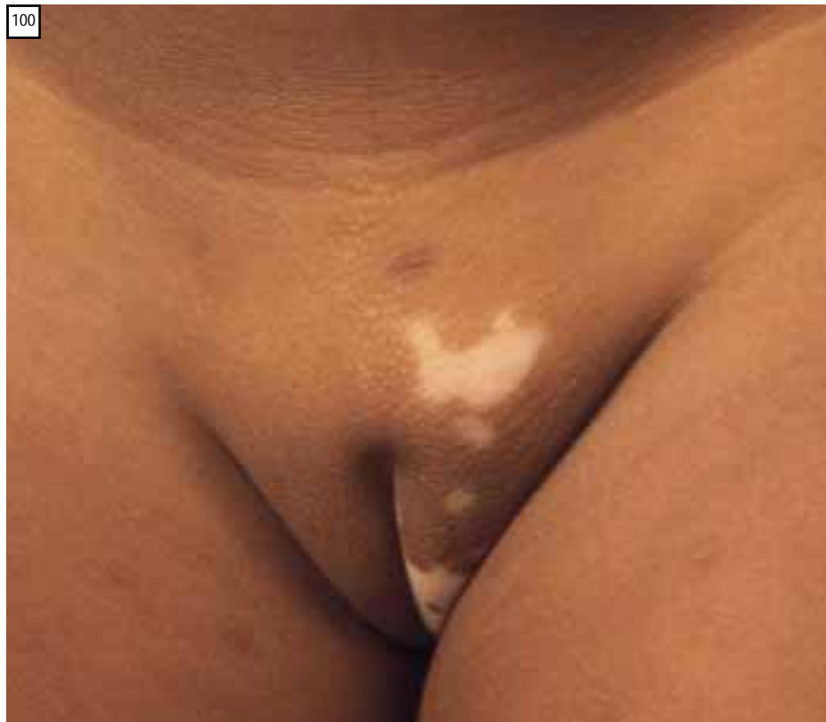
Fig. 100. Vitiligo of the genital area in a young girl.