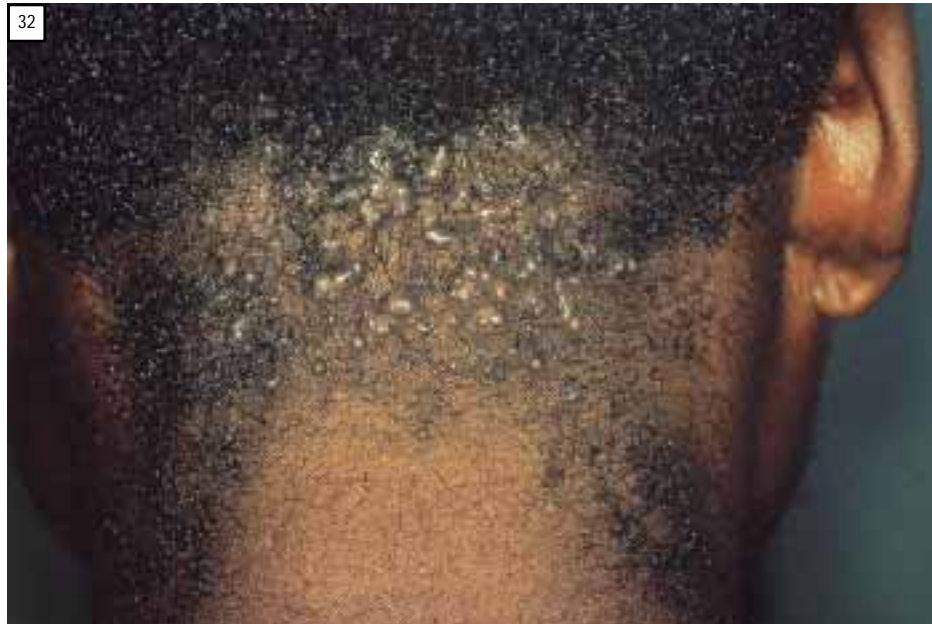
Fig. 32. Folliculitis keloidalis nuchae.