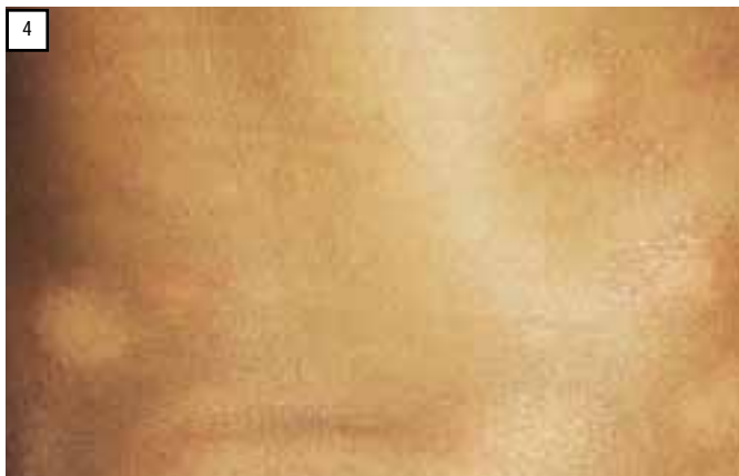
Fig. 4. Pityriasis alba on the back of a 4 month old girl.