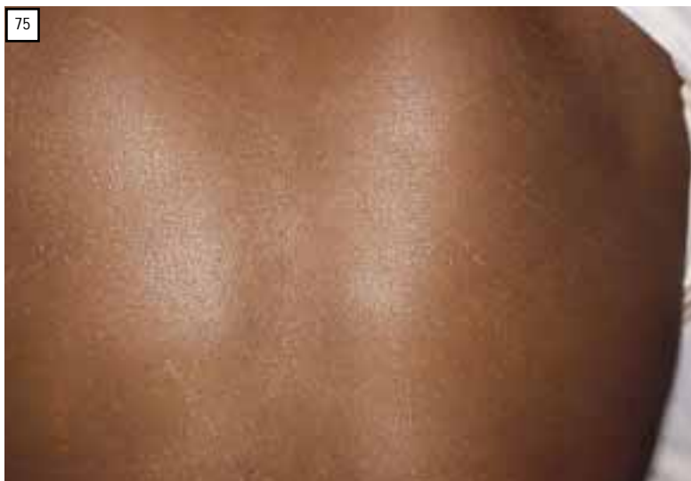
Fig. 75. Plane warts on the back of a 25 year old HIV positive woman.