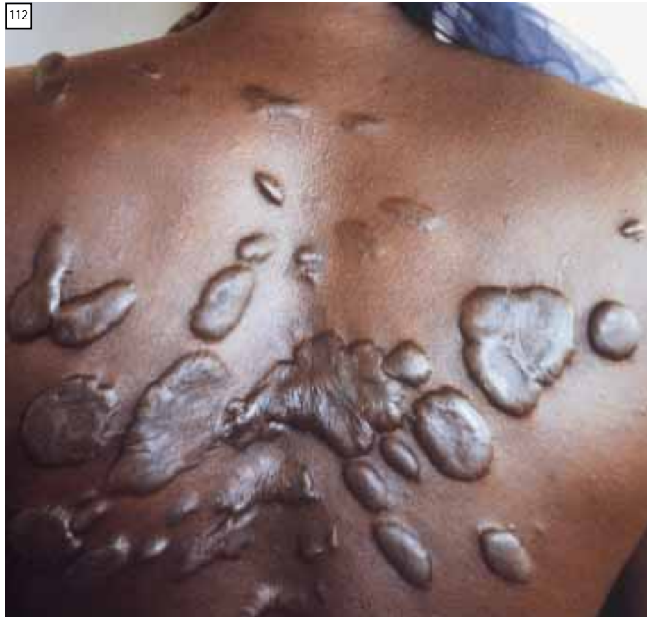
Fig. 112. Acne scars forming keloids on the back.