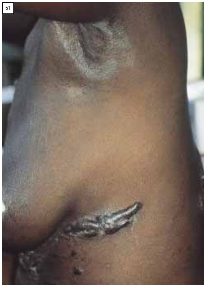
Fig. 51. A HIV positive patient with seborrheic eczema of the armpit and a scar from a previous herpes zoster infection.

HIV related skin diseases occur throughout the course of HIV infection in 90% of the infected persons. During seroconversion an exanthema may occur together with fever and constitutional symptoms. After seroconversion there will be a period of symptomless HIV infection. Herpes zoster is an early clinical sign which in young age-groups (under 50 years) is very strongly related to HIV infection. Severe and chronic seborrheic eczema may also be an early manifestation. Other cutaneous manifestations of HIV infection are molluscum contagiosum, papular pruritic eruption, severe herpes simplex or human papilloma infection, severe bacterial, mycobacterial and fungal infections and Kaposi's sarcoma. Infestations such as scabies are more severe. Adverse drug reactions are very common in HIV infection.