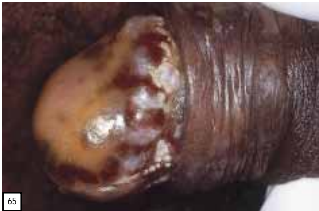
Fig. 65. Kaposi's sarcoma of the penis in a 57 year old man.