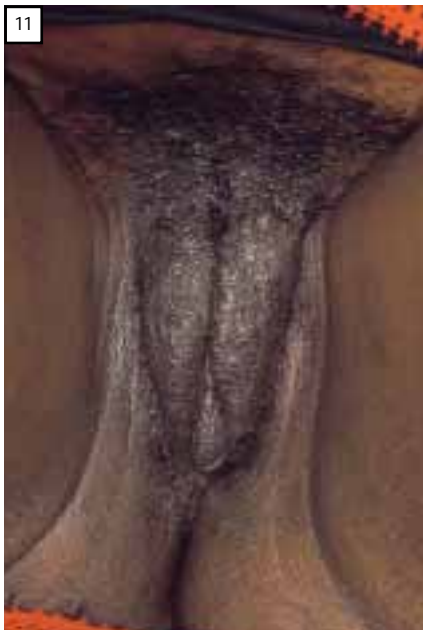
Fig. 10. Infected Seborrheic eczema of the groin in a HIV positive 7 year old boy. Fig. 11 & 12. Seborrheic eczema of groin and armpit easily becomes superinfected and is very common in HIV infected patients.