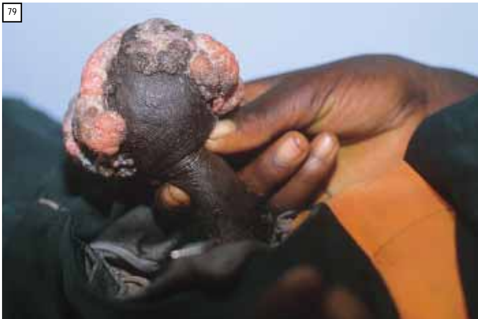
Fig. 77. Persistent condylomata acuminata in a HIV positive 22 year old woman. Fig. 78. Condylomata acuminata in an 11 year old rape victim who also tested HIV positive. Fig. 79. Giant condylomata acuminata in a 24 year old man with clinical immune suppression.