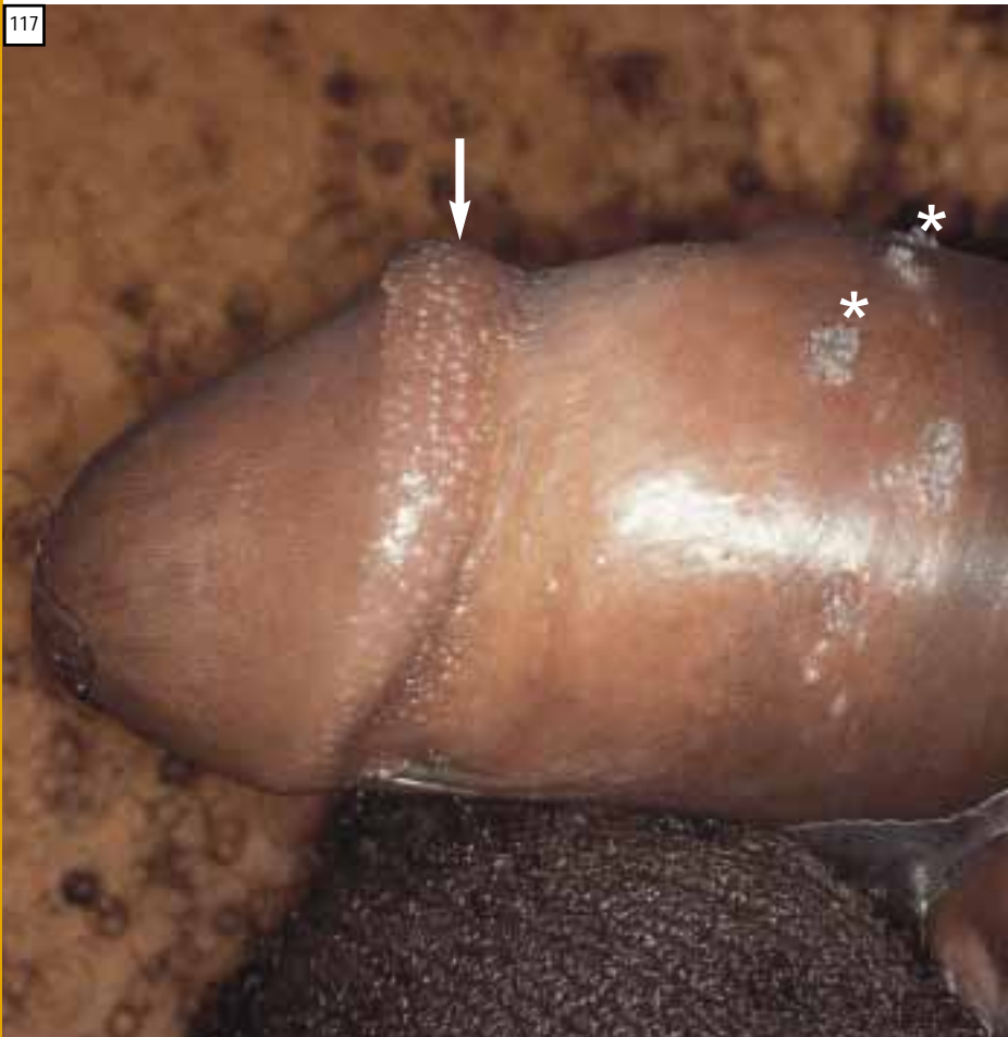
Fig. 117. Pearly penile papules → This patient also has condylomata acuminata *

Explain to the patient that no treatment is necessary.