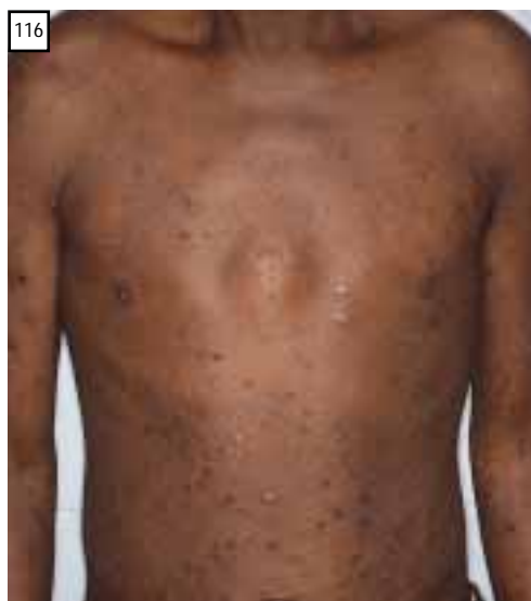
Fig. 115 & 116. Papular pruritic eruption.