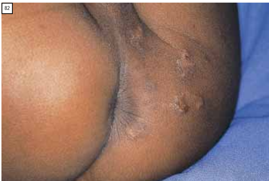
Fig. 82. Creeping eruption in a 18 month old boy.