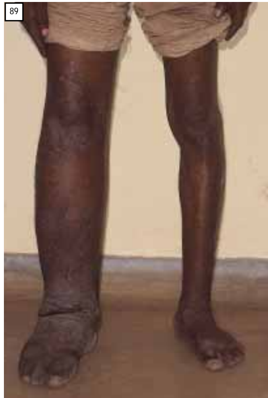
Fig. 89. Lymphatic filariasis.