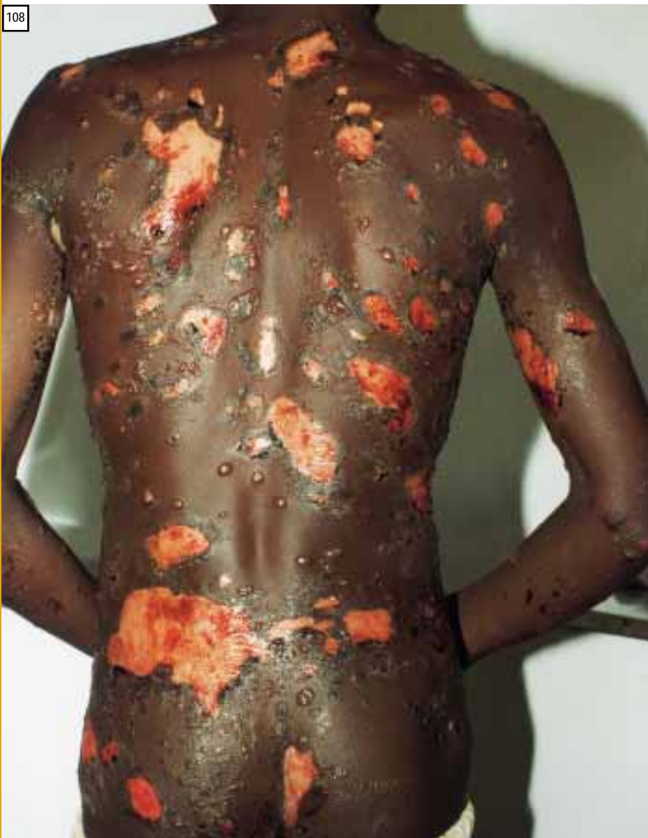
Fig. 107 & 108. Stevens-Johnson syndrome as a reaction to cotrimoxazole in a 16 year old boy.