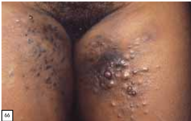
Fig. 66. Nodules and woodlike infiltration of the thighs in Kaposi's sarcoma.