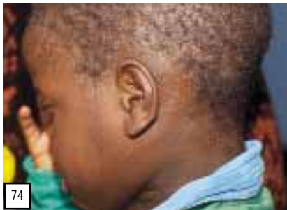
Fig. 74. Plane warts on the face and scalp of a 5 year old girl.