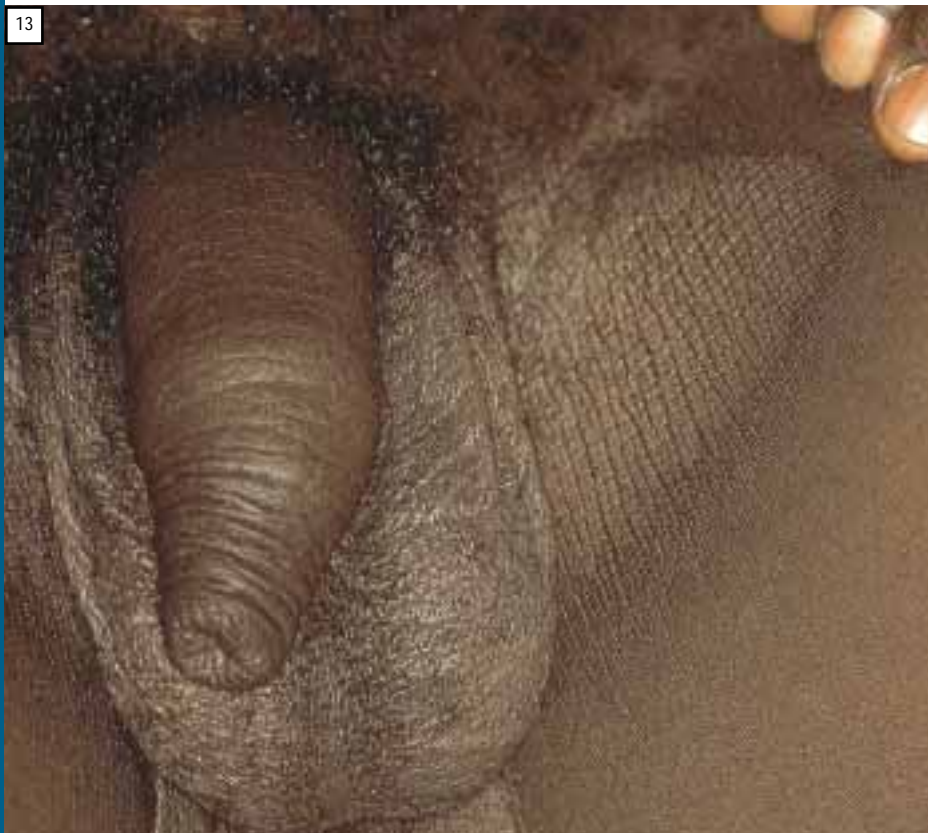
Fig. 13. Lichen simplex of the groin showing lichenification.