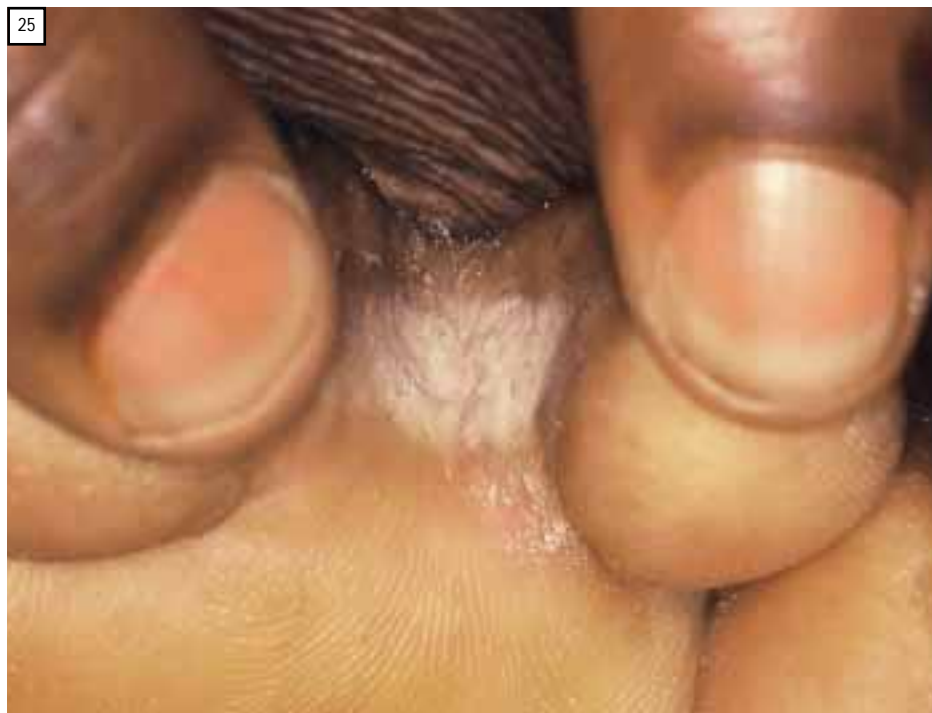
Fig. 25. Typical white, macerated lesions of Athlete's foot.