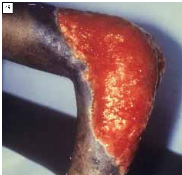
Fig.49. Buruli ulcer on the arm.