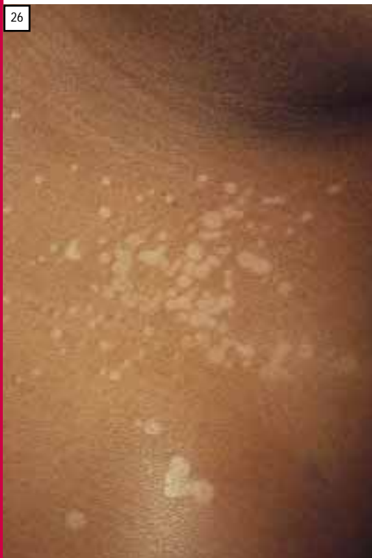
Fig. 26. Fine scaling hypopigmented macules of pityriasis versicolor.