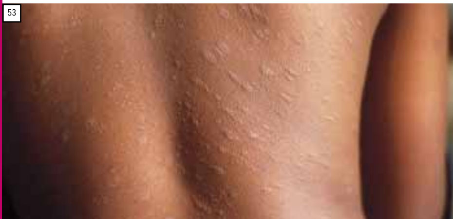
Fig. 53. "Christmas tree" pattern of pityriasis rosea on the back.