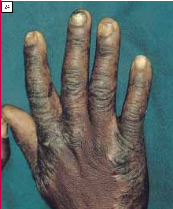
Fig. 24. Fungal infection of the hand and nails.