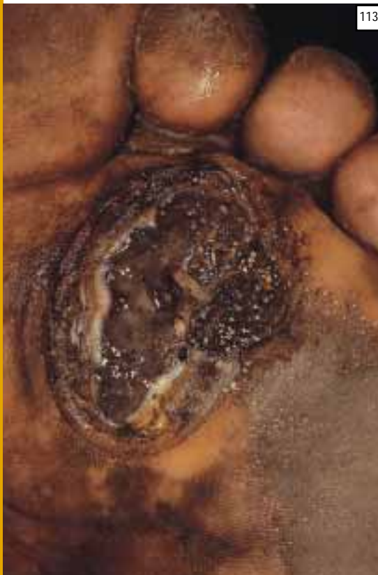
Fig. 113 & 114. Malignant melanoma of the sole with inguinal lymph node metastasis in a 62 year old man.