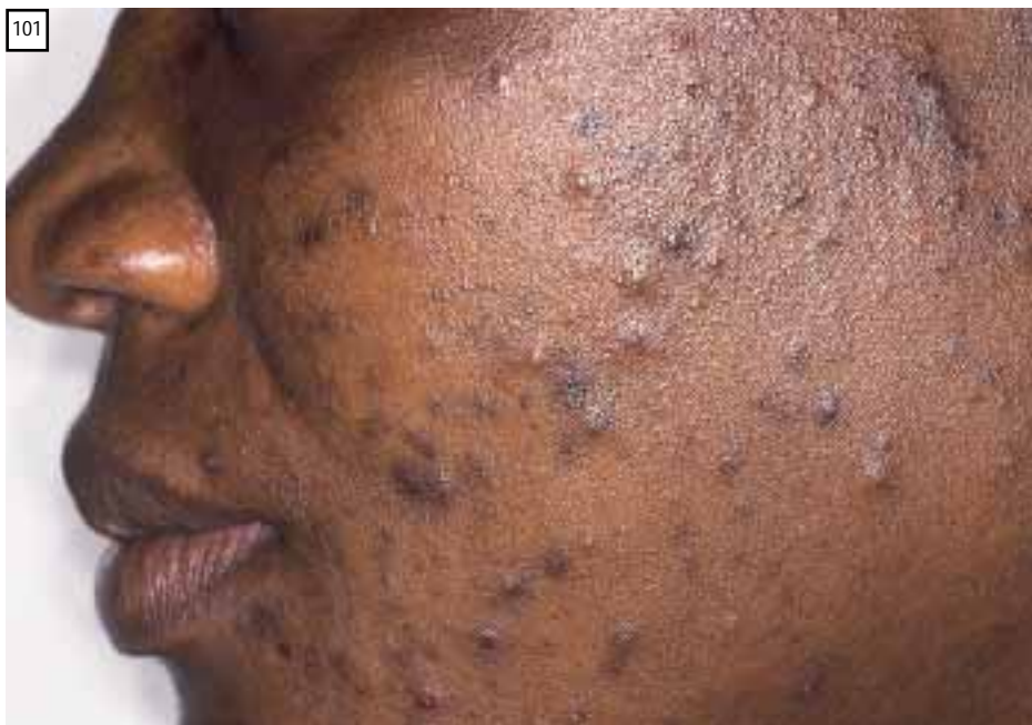
Fig. 101. Acne vulgaris.