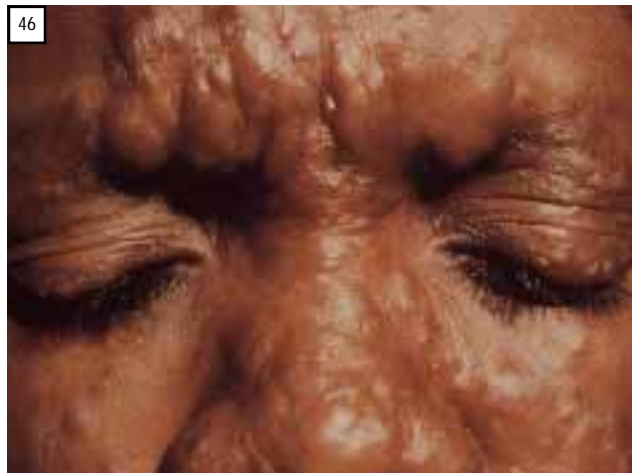
Fig. 46. ENL, tender papules and nodules, the patient is ill.

Deformity is the result of loss of muscle strength and ulceration followed by osteomyelitis and shortening of digits, mostly accompanied by stiffness and contractures.