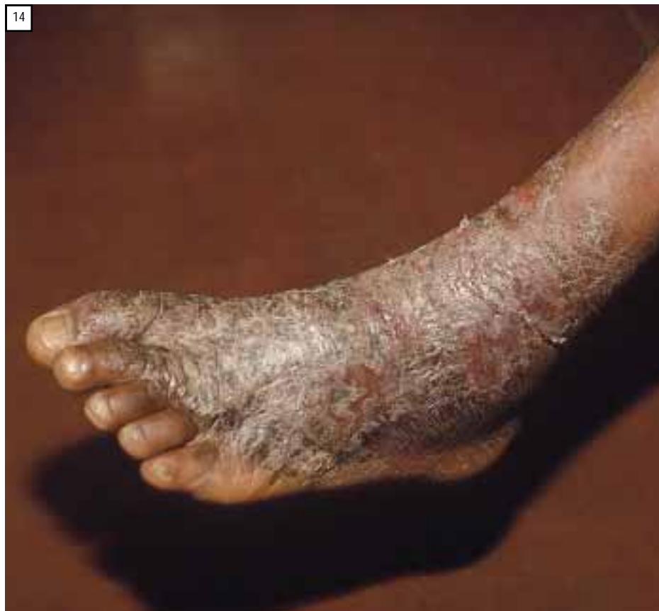
Fig. 14. Infective eczema.