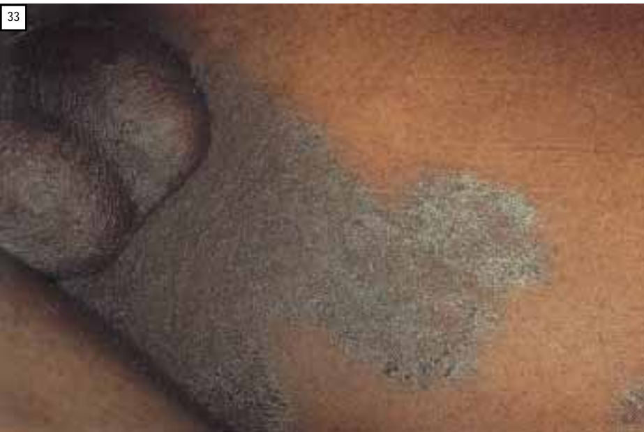
Fig. 33. Erythrasma in the groin of a 30 year old man.