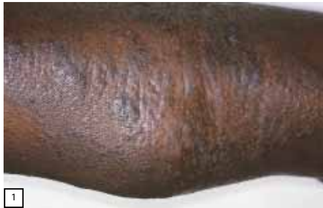
Fig. 1 & 2. Recurrent atopic eczema in an 8 year old boy showing lichenification in the elbow folds.