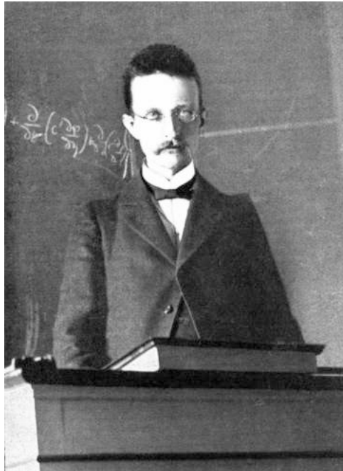
Figure 3.1: Max Planck teaching, late 1880s.

semester 1905/06" (Planck 1906, iv). Even though the structure of the book exhibits many similarities to Planck's Vorlesungen über Thermodynamik , the lectures on the theory of heat radiation certainly read more like a textbook. Compared to his earlier text on thermodynamics, Planck's work on heat radiation is less focused on his own research, and in addition, it discusses the subject much more comprehensively—in the manner of an "introduction to the study of the entire theory of radiative heat on a uniform thermodynamic foundation" (Planck 1906, iii). With this text Planck provided what has come to be recognized as the first comprehensive account of the theory of radiation.