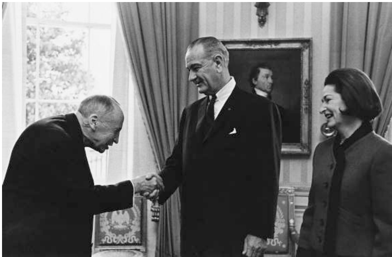
Figure 7.3: Van Vleck receiving the National Medal of Science in 1966 from President Lyndon B. Johnson with Lady Bird Johnson looking on.

Over the same period, Van Vleck had been busy pursuing the line of inquiry that would secure him fame as an expert in magnetism. He published a three-part paper that advanced a general theory of susceptibilities (Van Vleck 1927a; 1927b; 1928a). This trilogy would form the basis for The Theory of Electric and Magnetic Susceptibilities (Van Vleck 1932b).