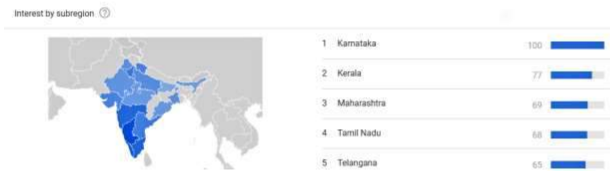
Figure 3: Ethical Hacker Demand in India Region wise:

As the region wise of India shows that each and every part of India is looking for ethical hacker. Most demand of it is in Karnataka then Kerala then Maharashtra so on. With its increasing boom the pay scale is also high in every part of India.