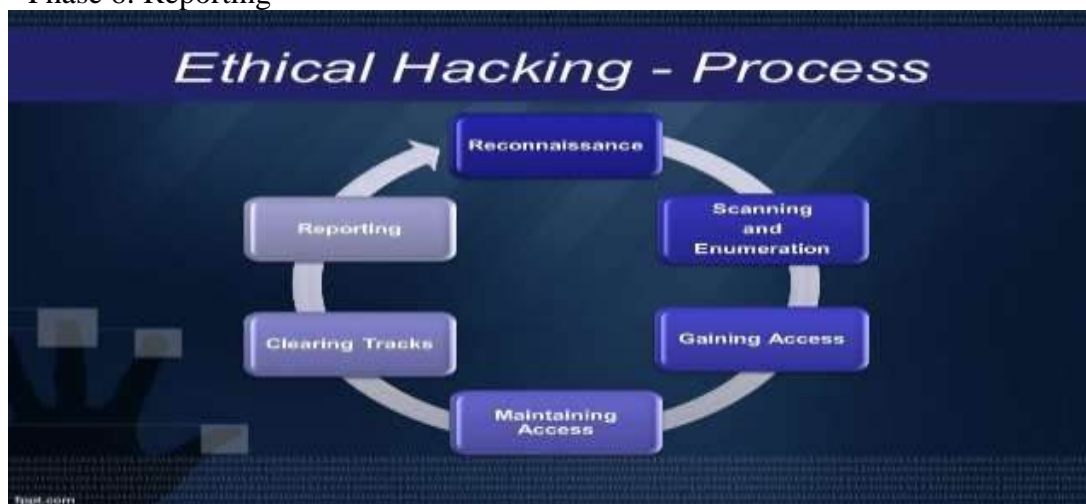
Figure 1 – Phase of Ethical Hacking