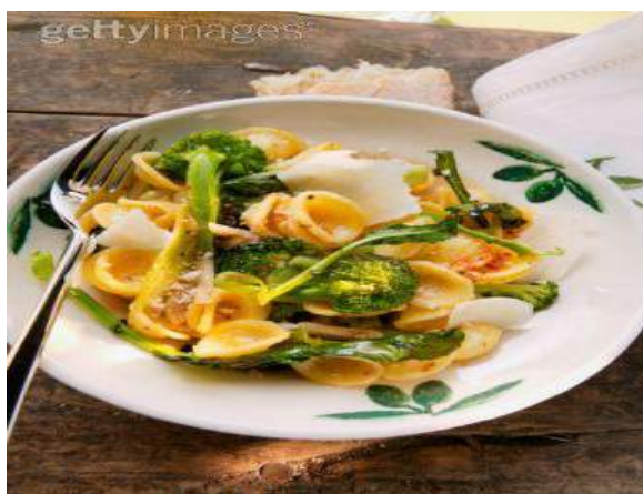
Broccoli and pesto pasta