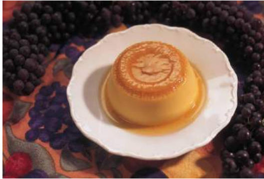
Baked Egg Custard