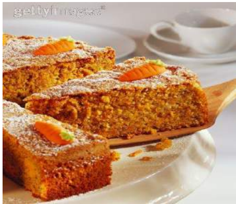
Tea & Carrot Loaf