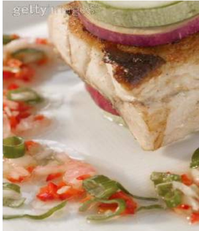
Roast swordfish with salsa