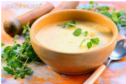
Scallion and Potato Soup