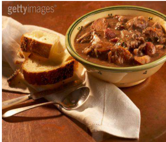
Beef Hot Pot