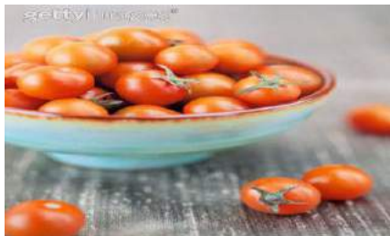
Cherry Tomato Relish