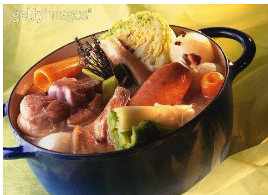
Beef and Red Wine Stew