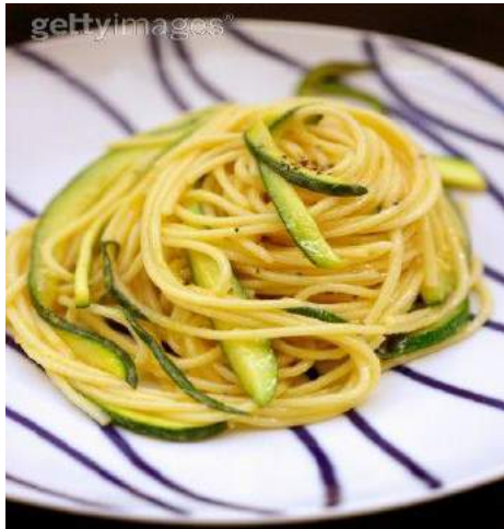
Courgette and herb pasta