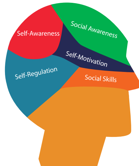
Figure 2: The Domains of Emotional Intelligence