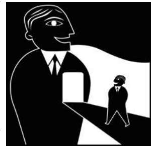
Figure 1: An Emotional Intelligence Assessment Tool for the Workplace

The intelligence quotient, or IQ, is a score derived from one of several different standardized tests to measure intelligence. 1 It has been used to assess giftedness, and sometimes underpin recruitment. Many have argued that IQ, or conventional intelligence, is too narrow: some people are academically brilliant yet socially and interpersonally inept. 2 And we know that success does not automatically follow those who possess a high IQ rating.