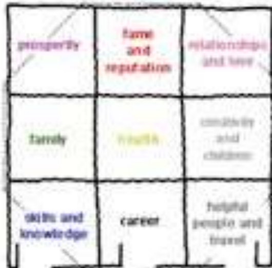
This side of the bagua always has the main door of the home or room located on it. Simplified bagua showing the associated life situations.