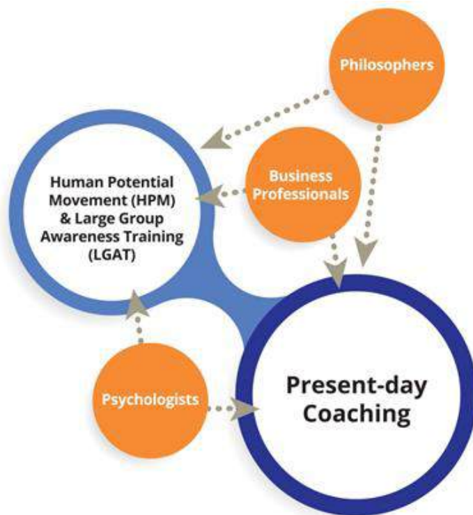
Figure 2. Influences on Coaching

Carl Rogers was one of the founders of the field of humanistic psychology. He emphasized the need to focus on and maintain a presence with the client (Rogers, 1957). Albert Bandura, a social psychologist, provided a significant contribution to