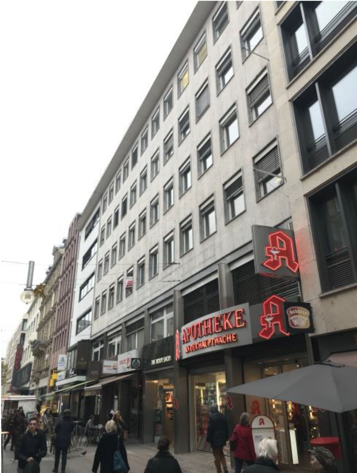
The property at Schillerstrasse, Frankfurt