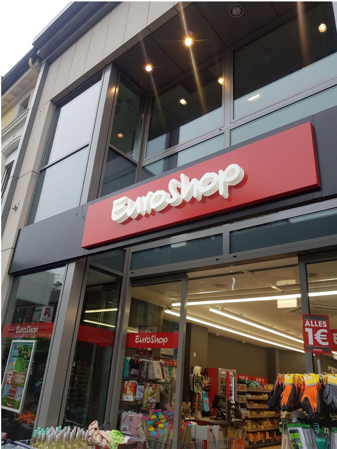
Property in Leverkusen