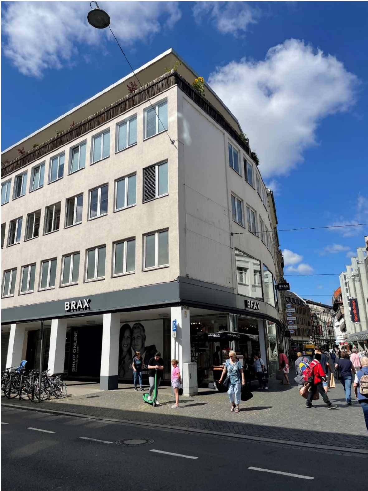
The property Braunschweig Münzstrasse