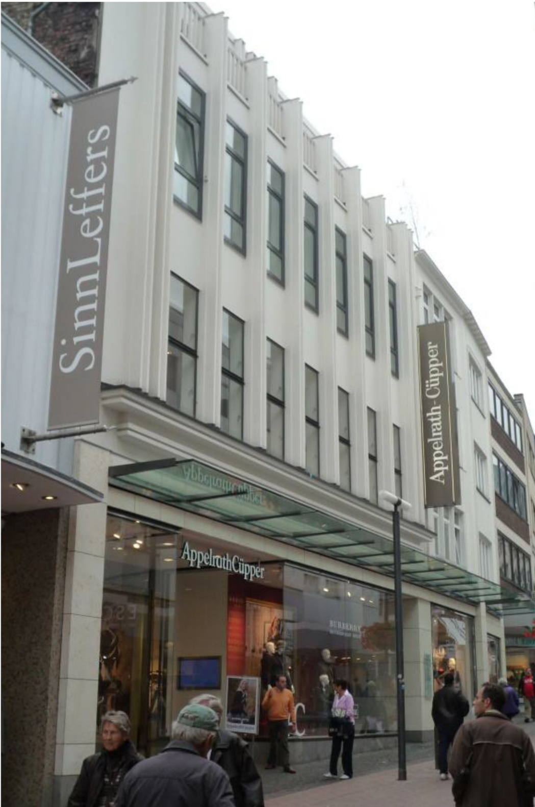
Grosskölnstrasse 20-28, Aachen