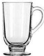
Footed Glass Mug/Glass with handle