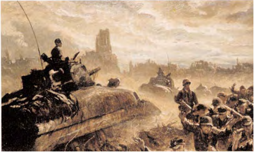
“Sherman Tanks Passing Stream of German Prisoners” by Ogden Pleissner. After seven weeks of slow, costly advances against determined German defenders in the hedgerows, Army armored formations seized the initiative at St. Lô and made rapid advances against a demoralized enemy. (Army Art Collection)

On 5 June 1944, General Eisenhower took advantage of a break in stormy weather to order the invasion of “fortress Europe.” In the hours before dawn, 6 June 1944, one British and two U.S. airborne divisions dropped behind the beaches. After sunrise, British, Canadian, and U.S. troops began to move ashore. The British and Canadians met modest opposition. Units of the U.S. VII Corps quickly broke through defenses at a beach code-named UTAH and began moving inland, making contact with the airborne troops within twenty-four hours. But heavy German fire swept OMAHA, the other American landing area. Elements of the 1st and 29th Infantry Divisions and the 2d and 5th Ranger Battalions clung precariously to a narrow stretch of stony beach until late in the day, when they were finally able to advance, outflanking the German positions.