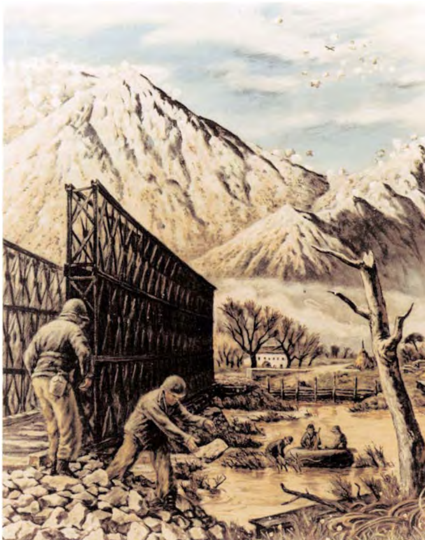
"Bailey Bridge" by Tom Craig. Mechanized warfare demanded a substantial increase in tactical bridging; in Italy the Bailey Bridge proved versatile and adaptable to a variety of weights and situations. (Army Art Collection)

As the Allies advanced up the mountainous spine of Italy, they confronted a series of heavily fortified German defensive positions, anchored on rivers or commanding terrain features. The brilliant de-