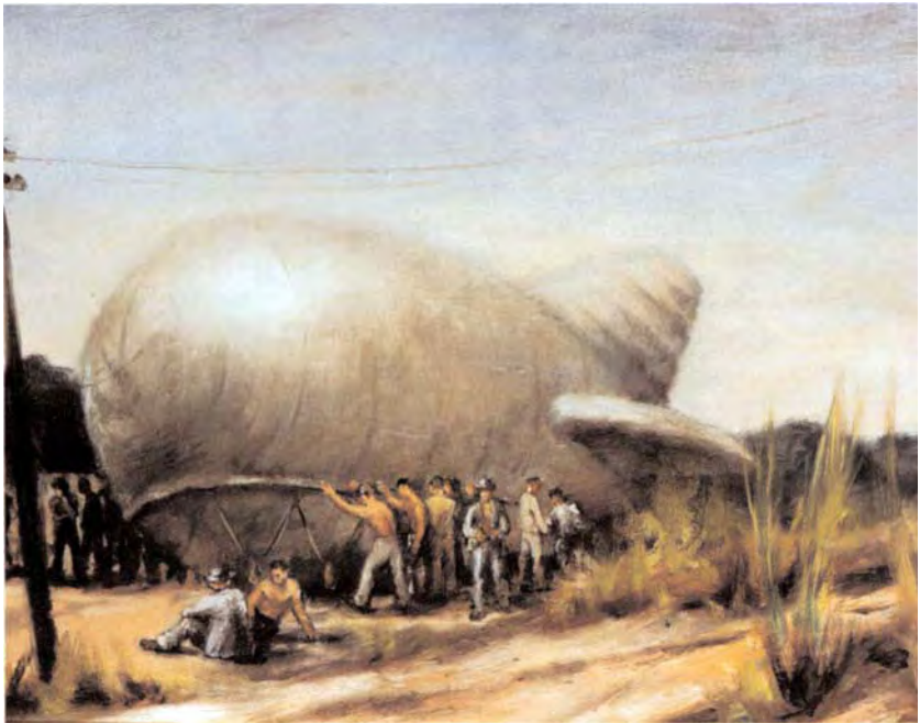
“Barrage Balloon” by Alexander Brook. The reported ability of balloons to interfere with low-level bombardment in Great Britain and Germany spurred the Army to develop a barrage balloon force for continental defense. (Army Art Collection)

lar Army and the National Guard. Congress amended the Neutrality Act to permit munitions sales to the French and British, and large orders from them stimulated retooling and laid the basis for the expansion of war production in the future. The Army concentrated on equipping its regular forces as quickly as possible and in 1940 held the first large-scale corps and army maneuvers in American history. The rapid defeat of France and the possible collapse of Britain dramatically accelerated defense preparations. Roosevelt directed the transfer of large stocks of World War I munitions to France and Britain in the spring of 1940 and went further in September when he agreed to the transfer of fifty over-age destroyers to Britain in exchange for bases in the Atlantic and Caribbean. In March 1941 Congress repealed some provisions of the Neutrality Act. Passage of the Lend-Lease Act, which gave the President authority to sell, transfer, or lease war goods to the government of any country whose