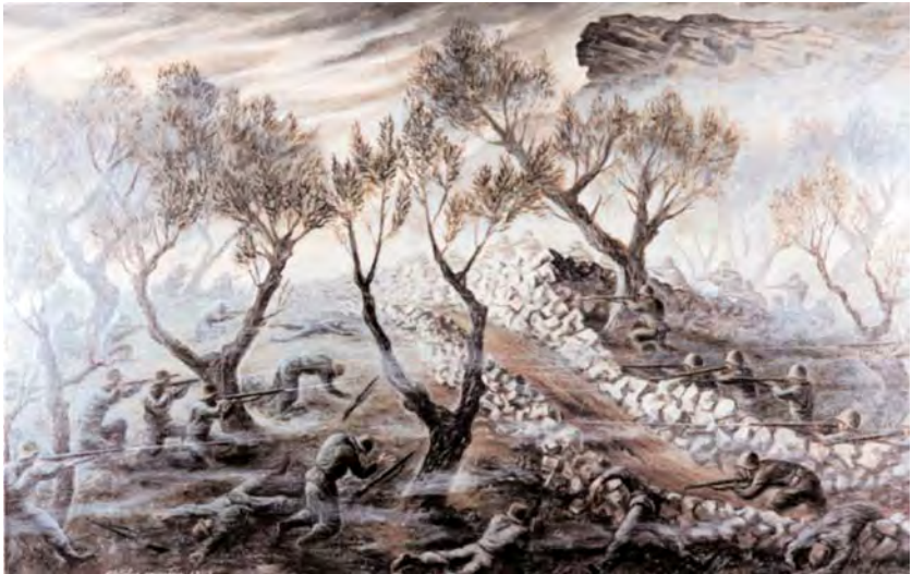
"Hill 609" by Fletcher Martin. Much of the Army's fighting in the final offensive in northern Tunisia involved dismounted infantry attacks on prepared defensive positions in rugged hill country. (Army Art Collection)

A chain of mountains separates coastal Tunisia from the arid interior. In a plain between two arms of the mountains and behind the passes in the west lay important Allied airfields and supply dumps. On 14 February 1943, the Axis commanders sent German and Italian forces through the passes, hoping to penetrate the American positions and either envelop the British in the north or seize Allied supply de-