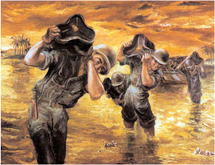
"Bringing in the Ammo" by Joseph Hirsch. At Rendova in the Solomons, landing craft went aground in shallow water fifty feet offshore, forcing troops to wade ashore with equipment and ammunition. (Army Art Collection)

jungle-covered mountains inland, and evil-smelling swamps along the coasts. Insects abound. The soldiers and marines were never dry; most fought battles while wracked by chills and fever. For every two soldiers lost in battle, five were lost to disease—especially malaria, dengue, dysentery, or scrub typhus, a dangerous illness carried by jungle mites. Almost all suffered “jungle rot,” ulcers caused by skin disease.