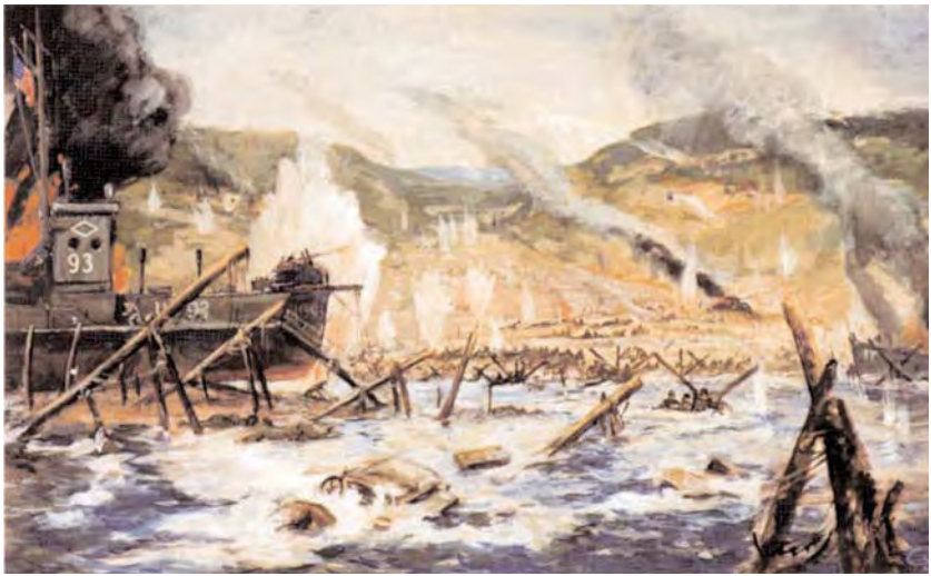
“OMAHA Beach” by Gary Sheahan. This was the one sector of the Normandy coast where the German defenses had begun to reach the expectations of Field Marshal Rommel, and here the Allied invasion of France faced its greatest crisis.