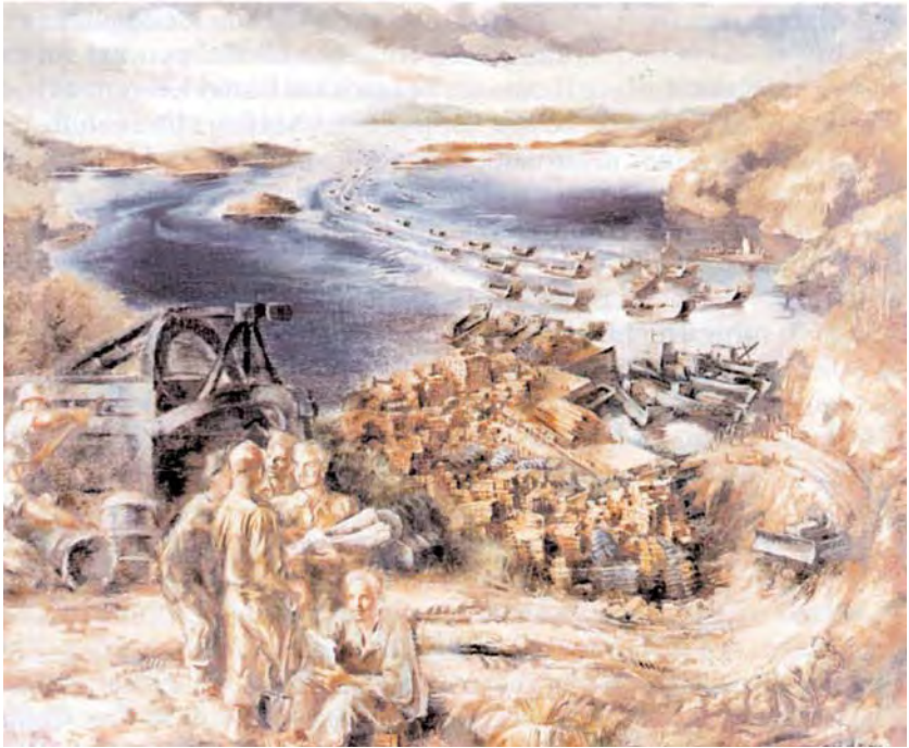
“Pim’s Jetty” by Frede Vida. The logistics of MacArthur’s leaps up the New Guinea coast sometimes posed greater difficulties than did the Japanese defenders. (Army Art Collection)

infantry, and both direct air support and effective naval gunfire were essential. MacArthur’s leaps up the northern coast of New Guinea were measured precisely by the range of his fighter-bombers. The primary task of Nimitz’s carriers was to support and defend the landing forces. As soon as possible after the landings, land-based planes were brought in to free the carriers for other operations.