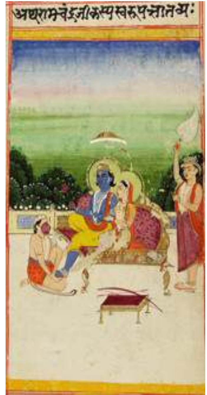
Illustrated page of a book showing Hanuman serving Rama and Sita. Unknown Artist (1825-1875)

Once you are comfortable with these concepts, read the story of Hanuman below and look out for how Hanuman demonstrates each of these Hindu values.