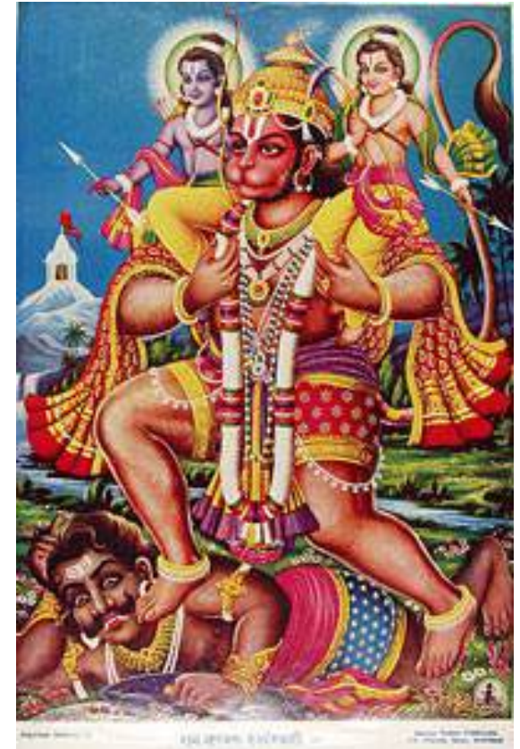
Print of a scene from Ramayana showing Hanuman's strength

Suddenly powerful again, Hanuman transformed into the size of mountain, and flew across the narrow channel to Lanka. Upon landing, he discovered a city ruled by the evil King Ravana and his demon followers, so he shrank down to the size of an ant and snuck in.