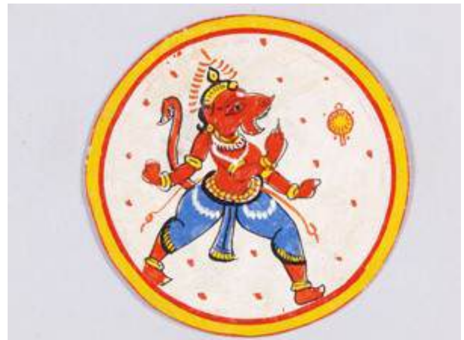
Indian Ganjifa playing cards featuring Hanuman (Date unknown)