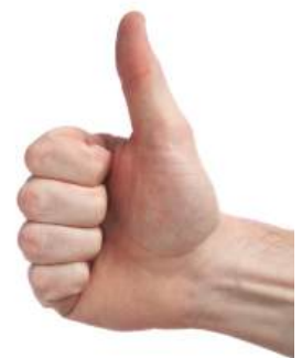
Emblems are gestures that have a specific meaning. In the United